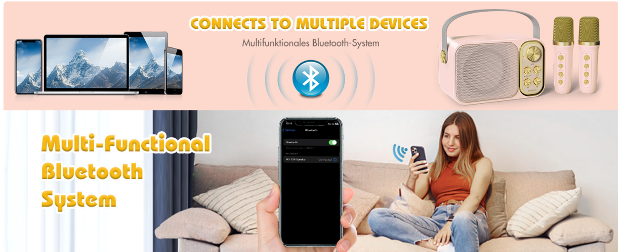
Image: Illustrates the various connection methods, including Bluetooth pairing.