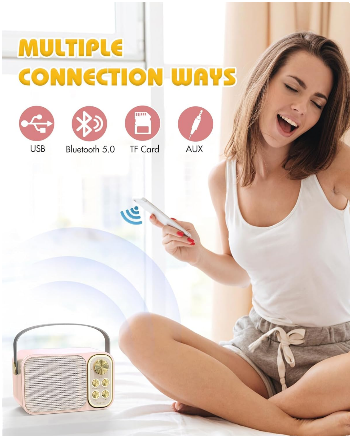
Image: Visual representation of the multiple connection options available for the karaoke machine.