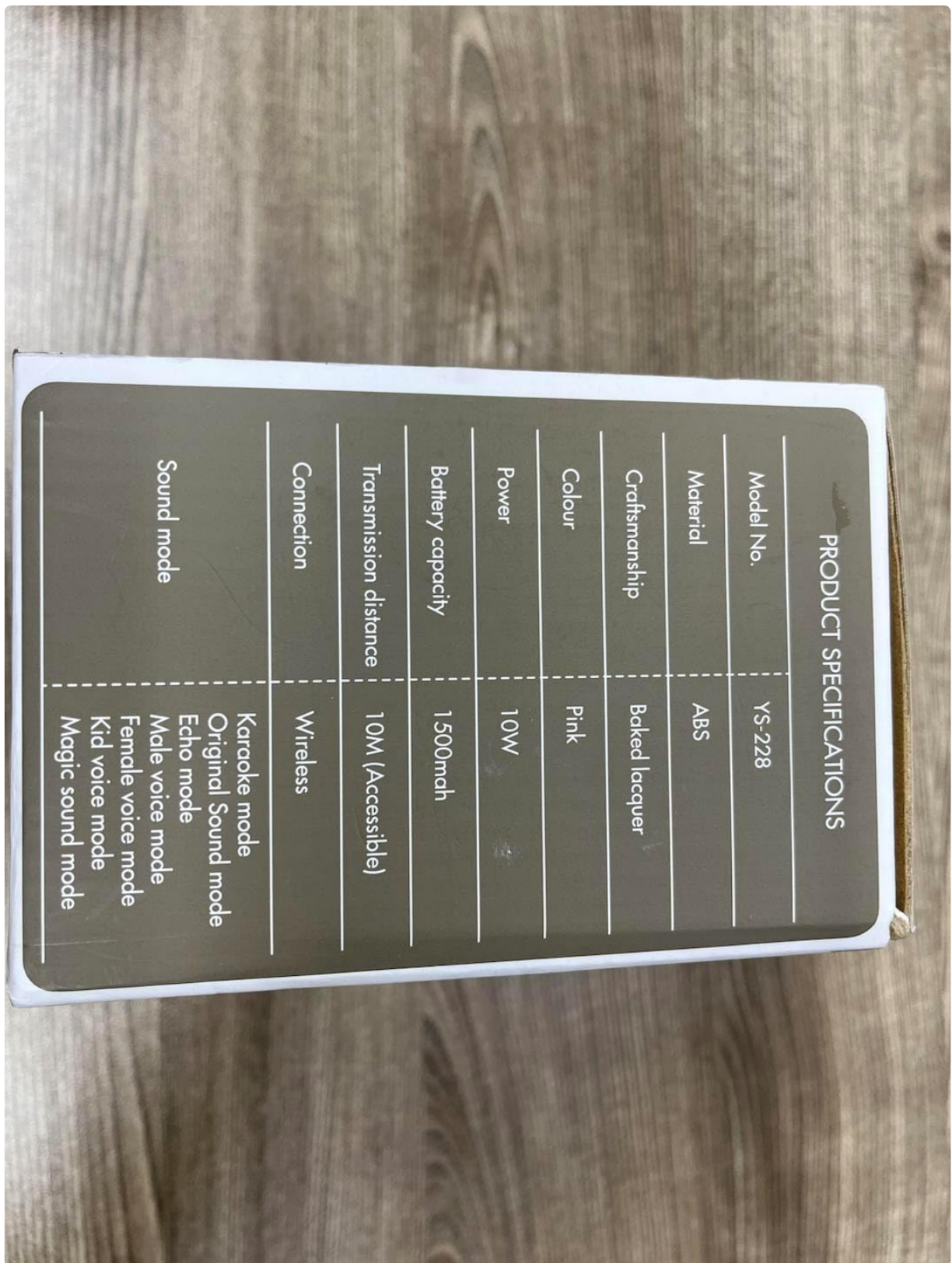
Image: Product specifications as listed on the packaging.