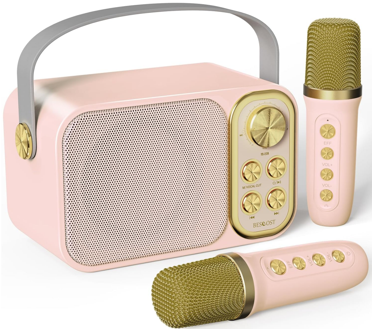
Image: The main karaoke machine unit and its two accompanying wireless microphones.