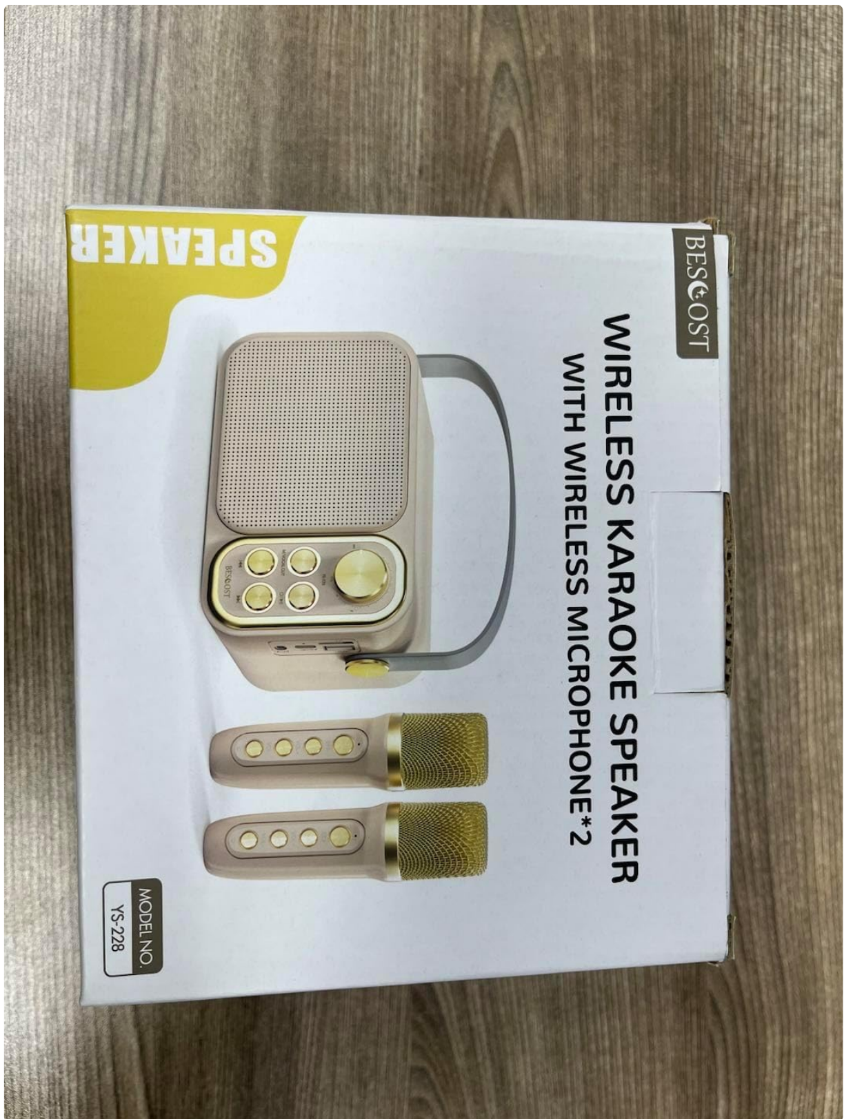
Image: The product packaging, illustrating the main speaker unit and the two wireless microphones included.