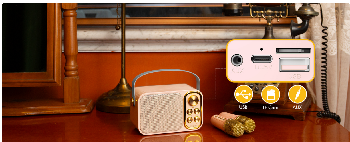
Image: Detailed view of the connectivity ports on the side of the karaoke machine.