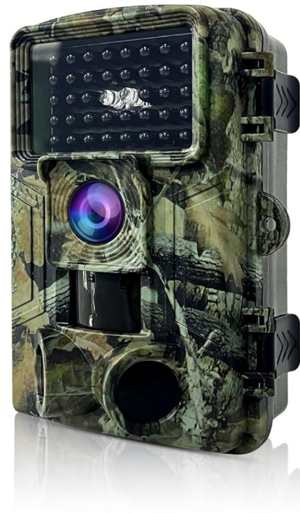
Figure 5: Day and Night Vision Capabilities