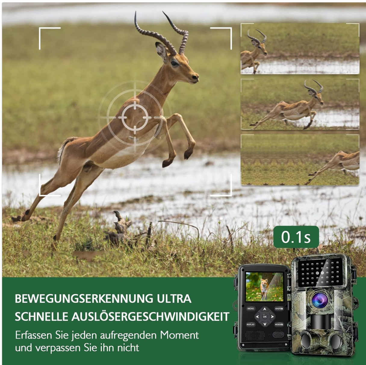
Figure 4: Ultra-Fast Trigger Speed

The camera features a rapid 0.1-second trigger speed, ensuring that fast-moving subjects are captured effectively.