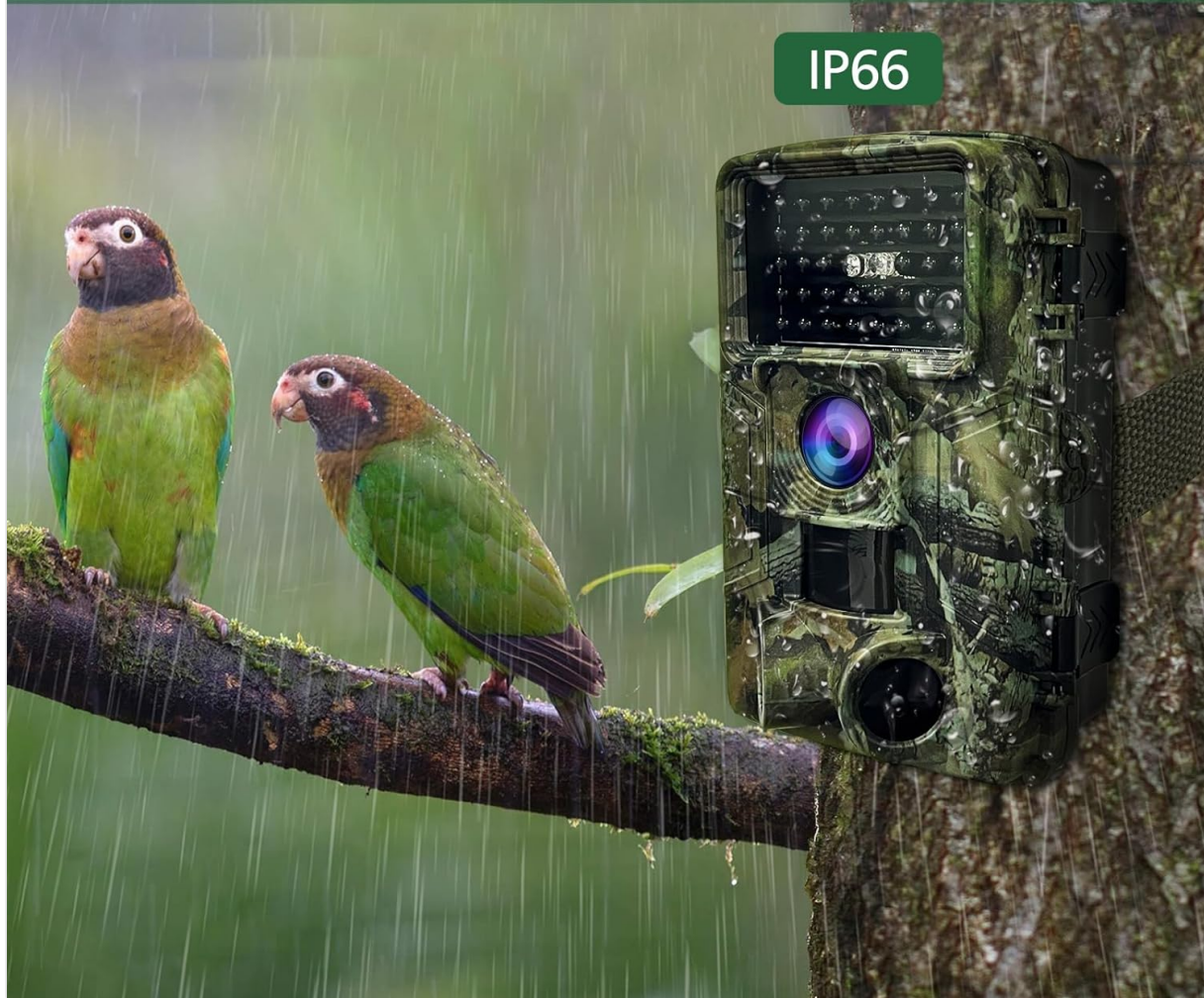
Figure 6: IP66 Waterproof Design

IP66 wasserdicht, funktioniert hervorragend, egal ob es sonnig oder ist regnerisch