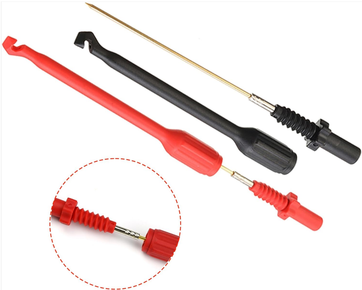
Image: A ZIBOO ZB-T12S probe disassembled, clearly showing the removable piercing needle component and its connection point.