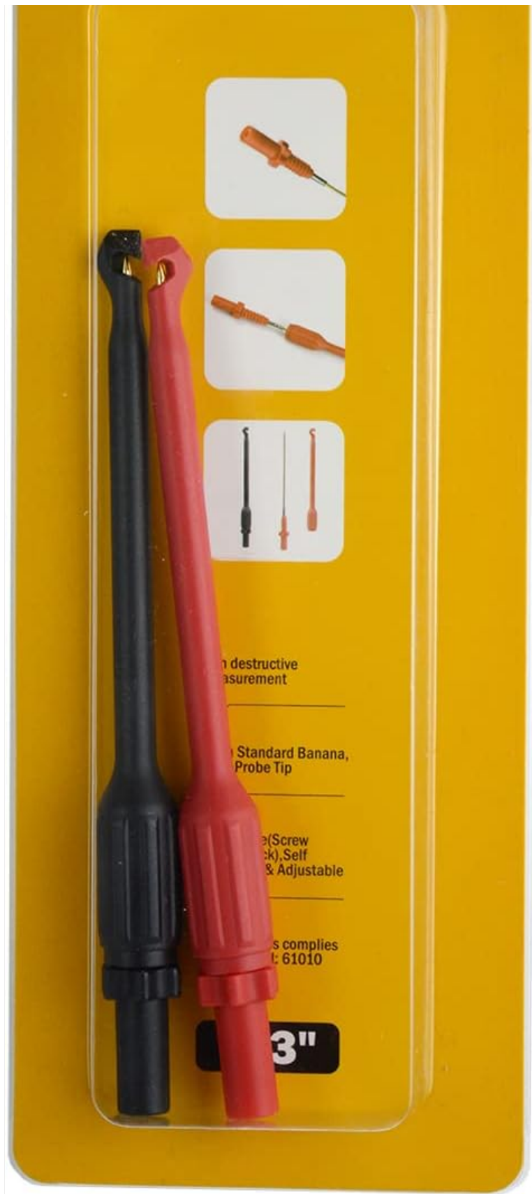
Image: ZIBOO ZB-T12S Automotive Wire Piercing Probe in its retail packaging, showing the red and black probes.