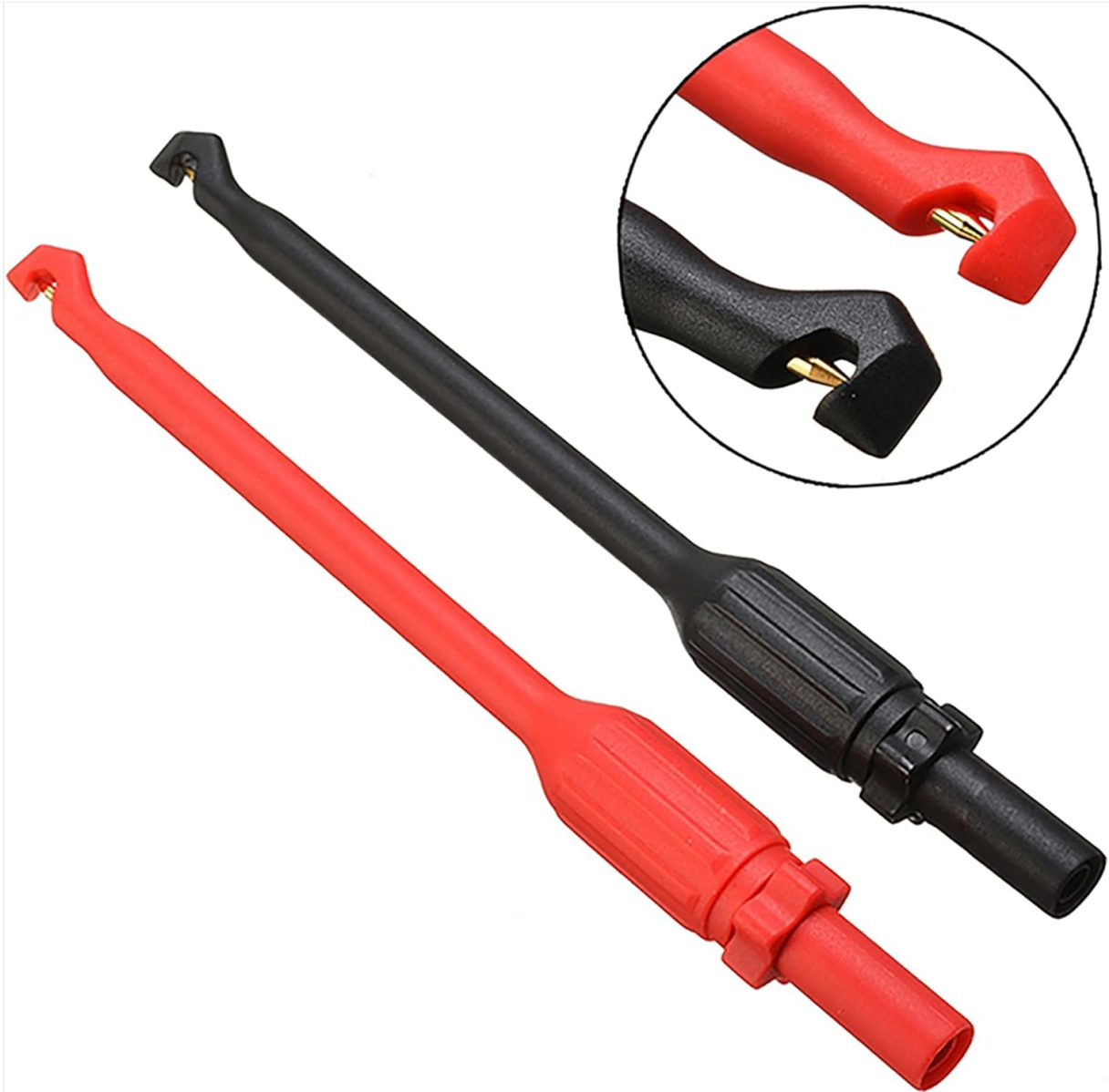
Image: A close-up view of the ZIBOO ZB-T12S probe's base, illustrating how a 4mm banana plug connects to its sheathed receptacle.