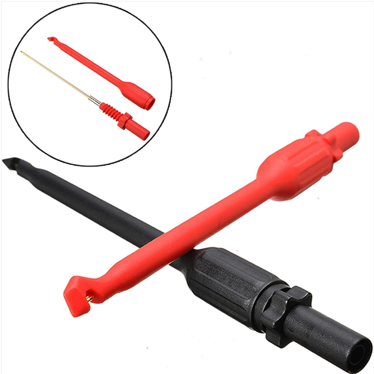
Image: Two ZIBOO ZB-T12S probes, red and black, crossed to highlight the piercing tip mechanism and how it engages with a wire.

puncture hole in the insulation typically self-seals, minimizing damage.