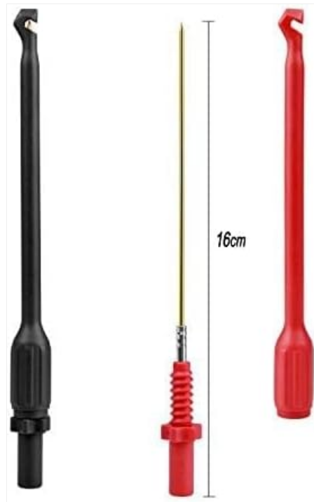
Image: A ZIBOO ZB-T12S probe illustrating its 16cm overall length.