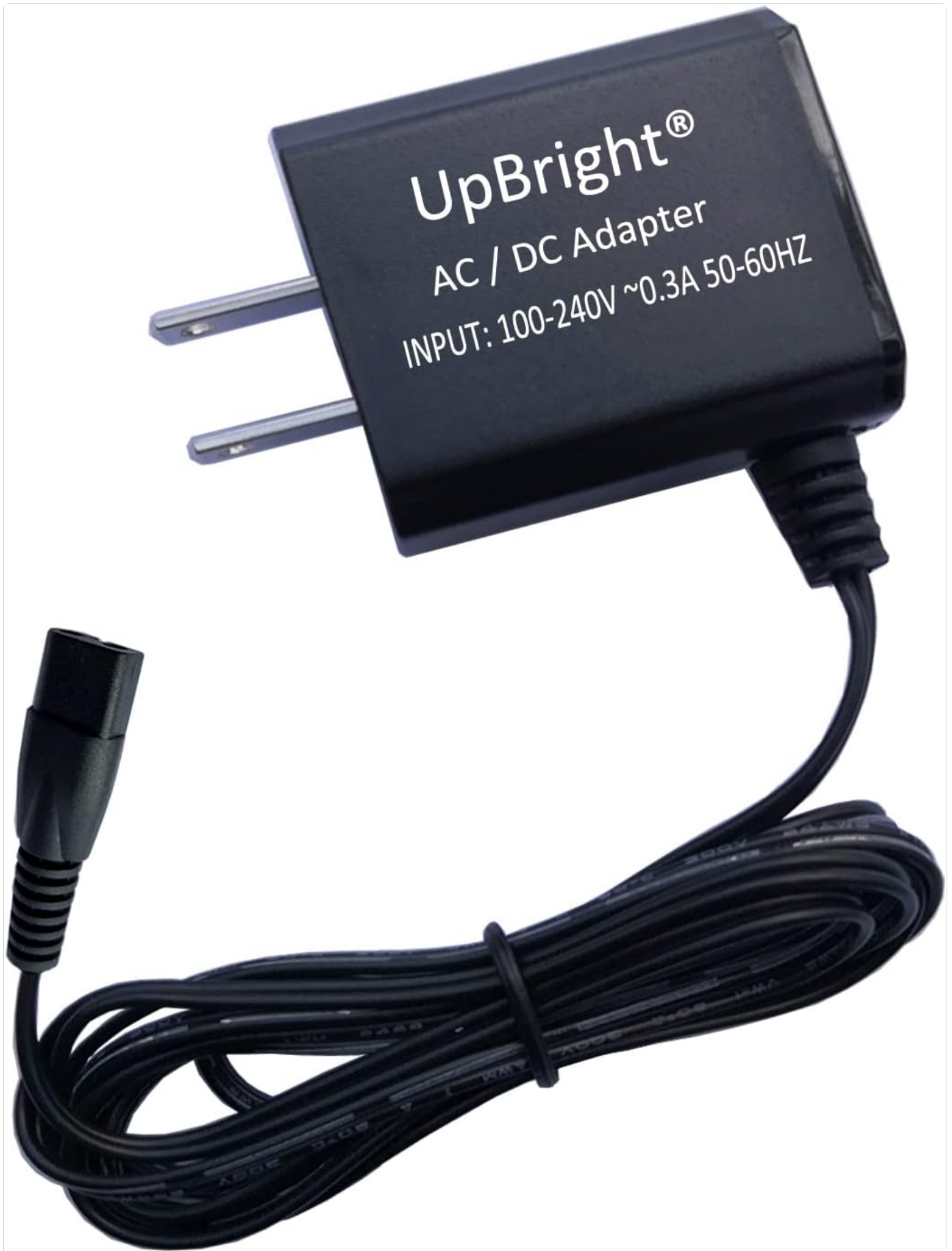
Figure 1.1: Front view of the UpBright 5V 2Pin AC Adapter. This image shows the adapter's main body with the UpBright branding and input specifications, along with the attached power cord ending in a 2-pin connector.