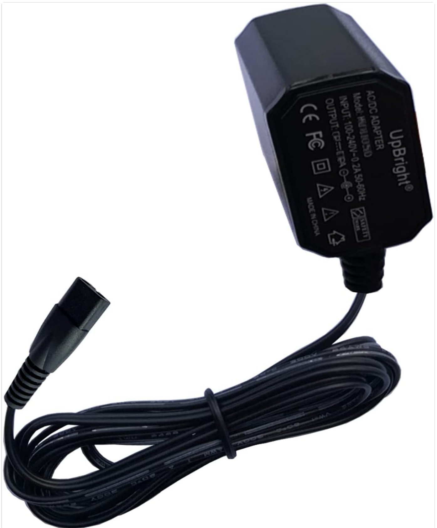
Figure 6.1: Rear view of the UpBright 5V 2Pin AC Adapter, displaying detailed input and output specifications printed on the casing. This image provides a clear view of the technical data for the adapter.