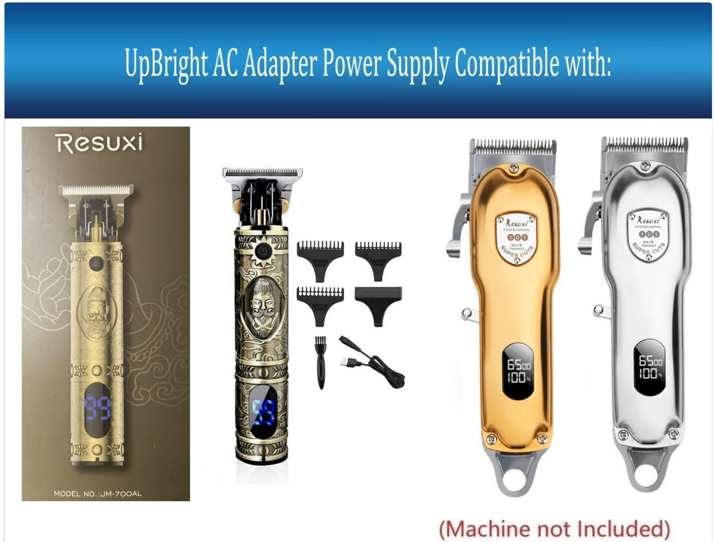
Figure 2.1: Illustration of the UpBright AC Adapter's compatibility with various Resuxi hair clipper models. This image visually confirms the types of devices the adapter is designed to power, showing several clipper models alongside the adapter.