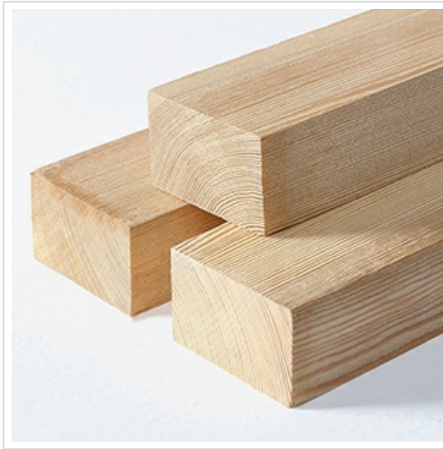
Stack of natural pine wood planks, illustrating the material quality.