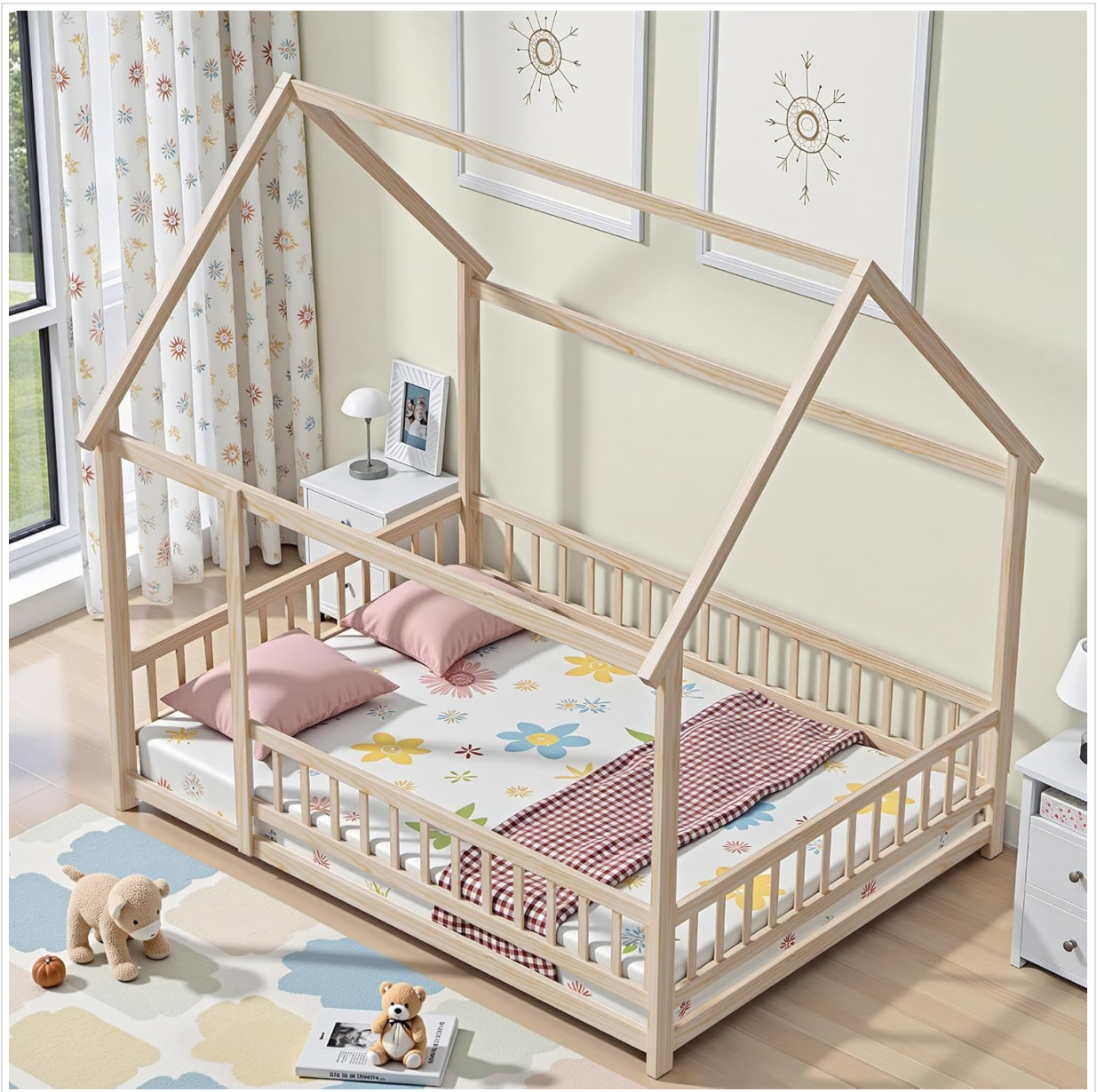
LLS Full Size House Bed with Fence with bedding and pillows, demonstrating its use in a child's room.