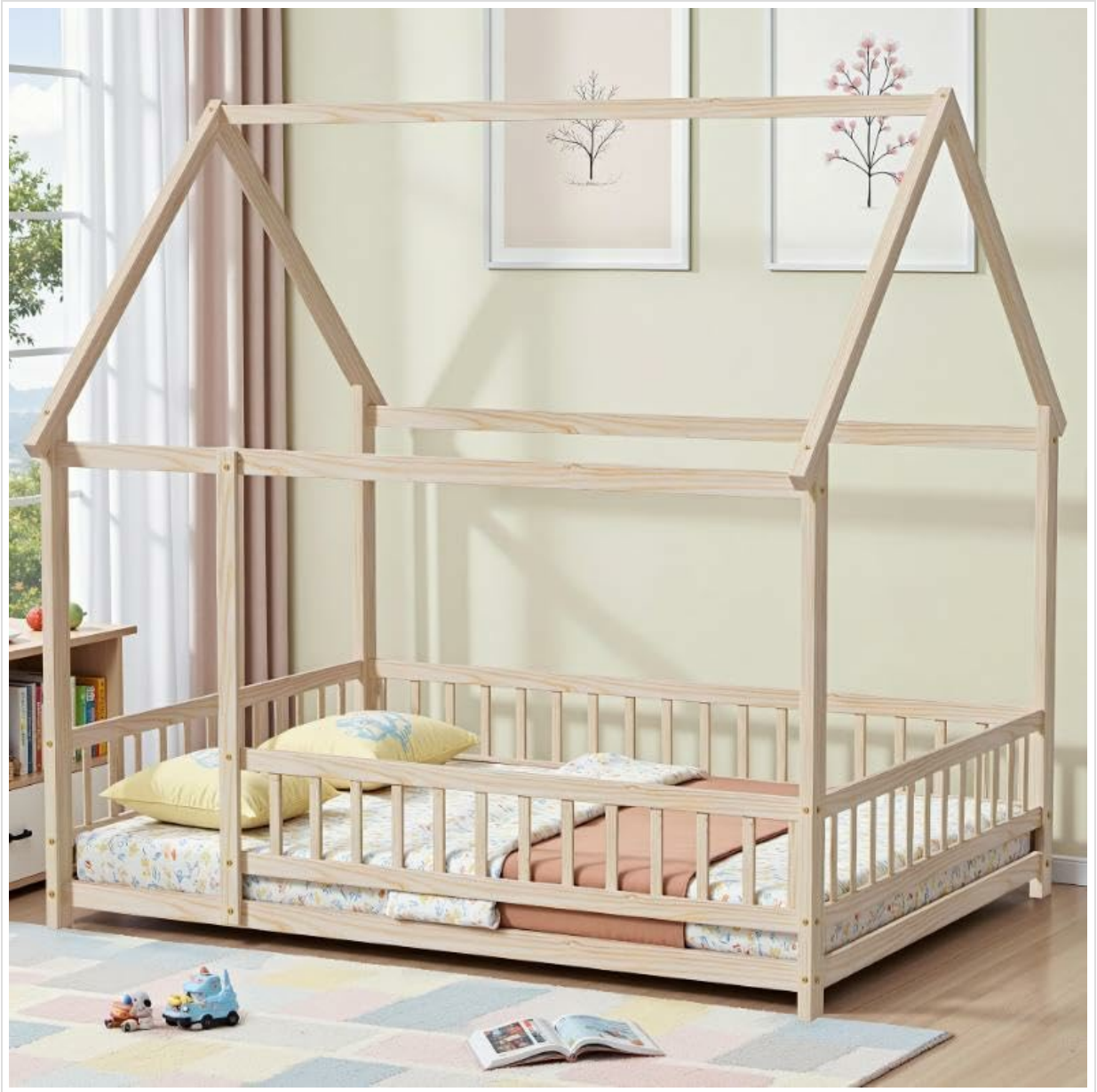
LLS Full Size House Bed with Fence in a natural wood finish.