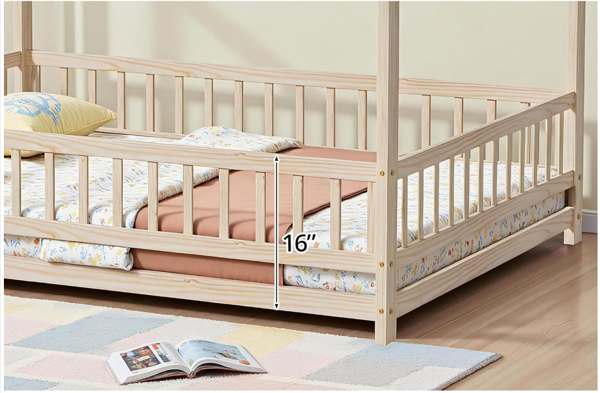
Detailed view of the 16-inch high safety fence of the bed frame.