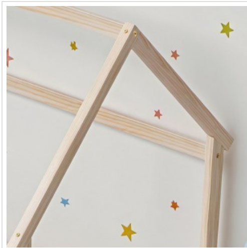
Diagram showing the roof design structure of the bed frame.