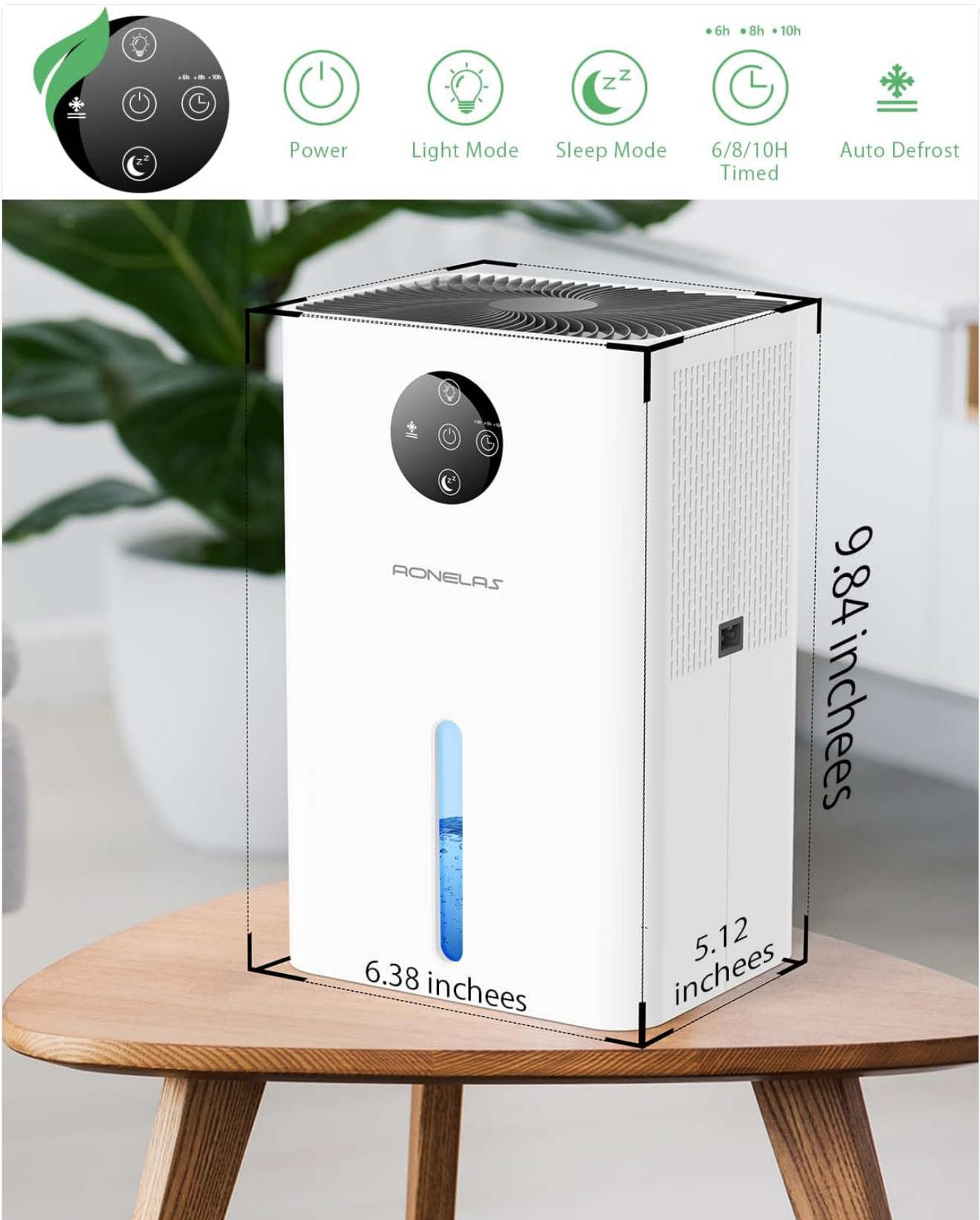
Image showing the AONELAS dehumidifier with its dimensions (5.12, 6.38, 9.84 inches) and control panel icons for Power, Light Mode, Sleep Mode, Timer (6/8/10H), and Auto Defrost.

Familiarize yourself with the main parts of your dehumidifier.