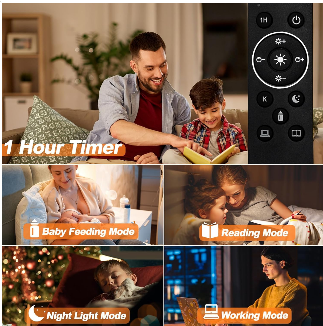
Image: Visual representation of the 1-hour timer and various preset modes (Baby Feeding, Reading, Working, Night Light) available on the Brilvibera remote control.