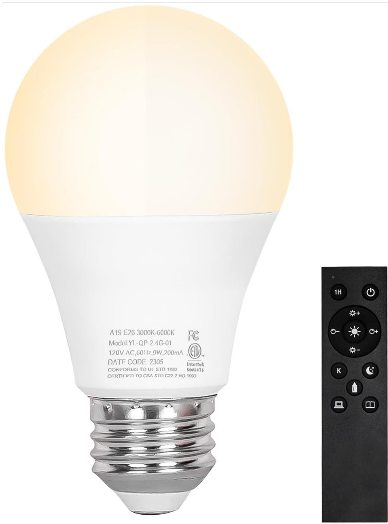
Image: The Brilvibera A19 E26 Dimmable LED Light Bulb shown alongside its dedicated remote control.