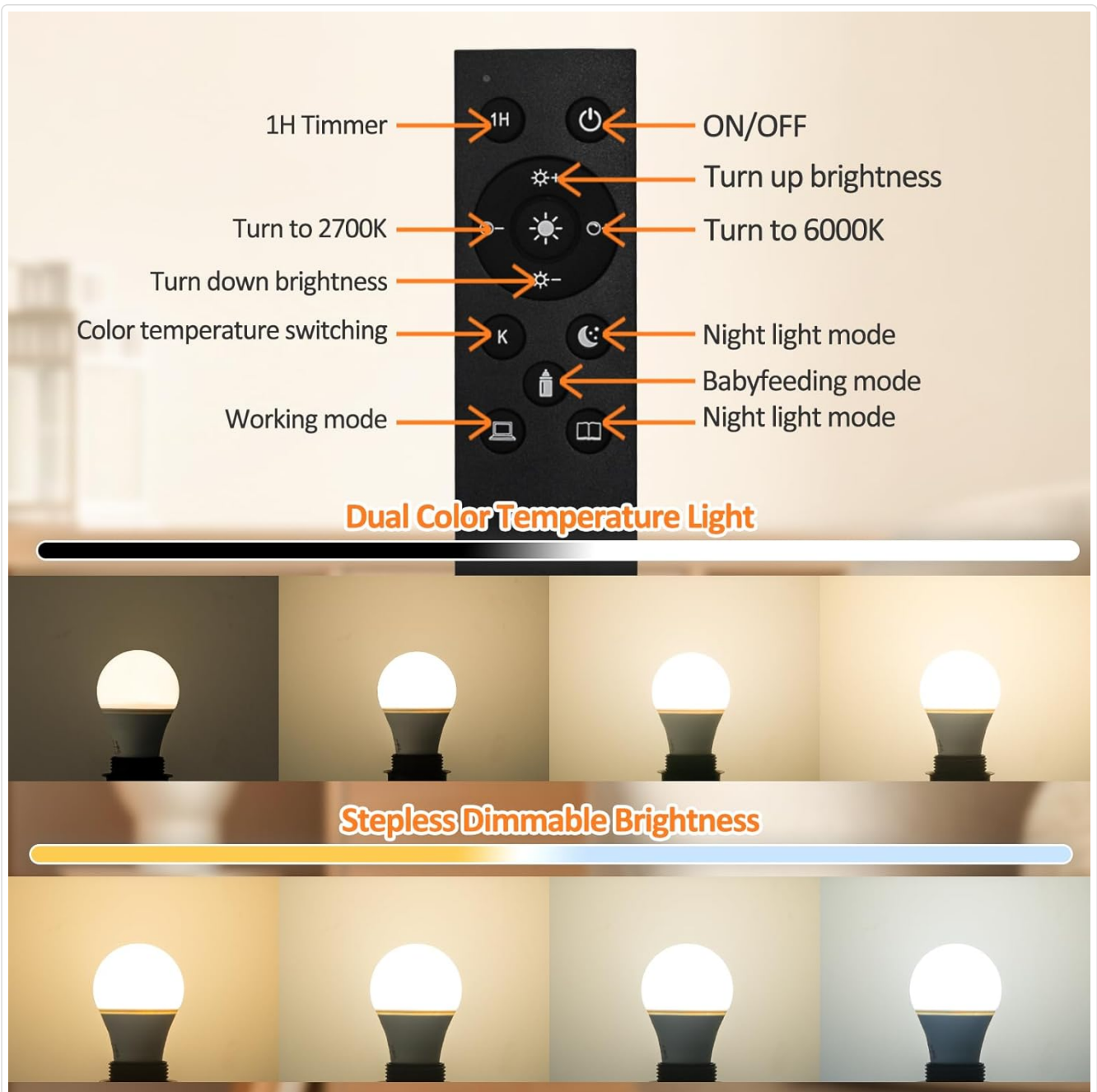
Image: Diagram of the remote control, labeling each button and its corresponding function for the Brilvibera A19 LED bulb.