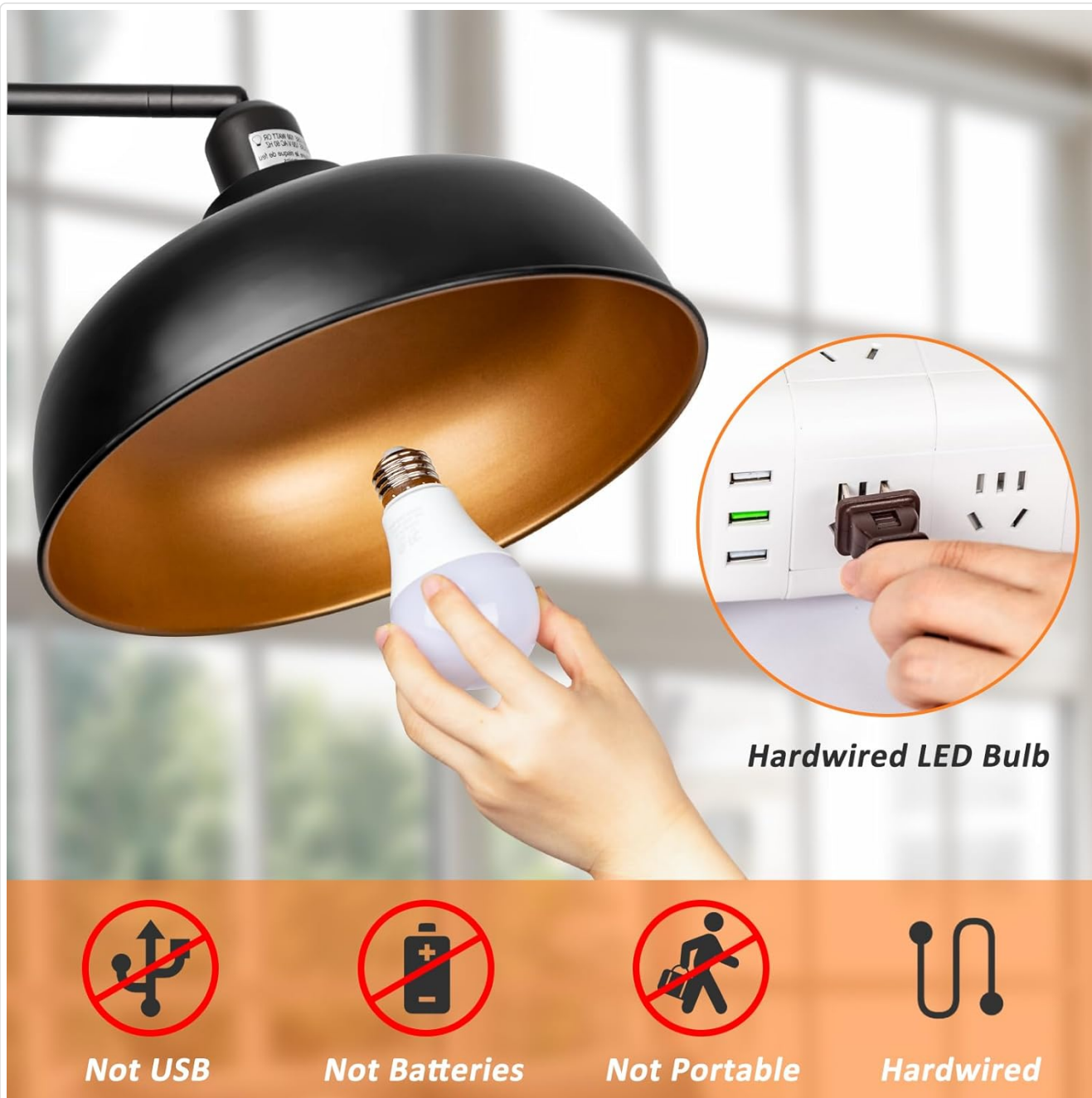
Image: A hand screwing the Brilvibera A19 LED bulb into a lamp fixture, demonstrating the installation process. Note that the bulb is hardwired and not portable.