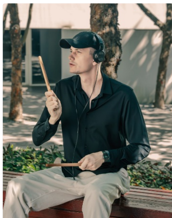
Figure 4.2: The PocketDrum 2 Plus supports MIDI functionality for music production.

The PocketDrum 2 Plus also features a MIDI function . You can connect the adapter via a USB port to your laptop or other device to use it as a MIDI controller for music creation or performance. Refer to the user manual for detailed instructions on using the MIDI function.