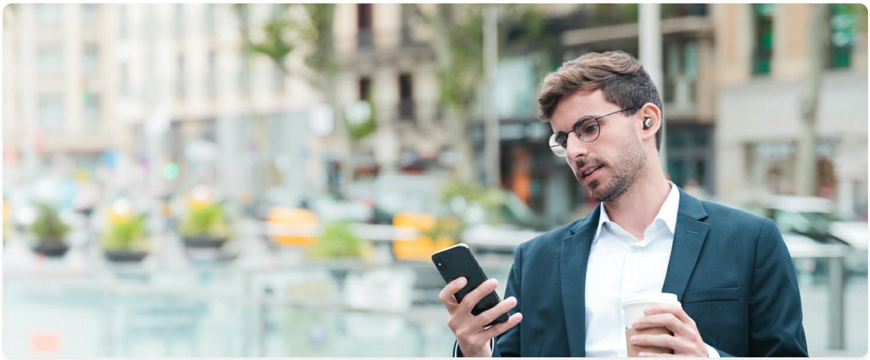
Image: EarFun Free Pro 3 earbuds demonstrating multipoint connection to a smartphone and a laptop.