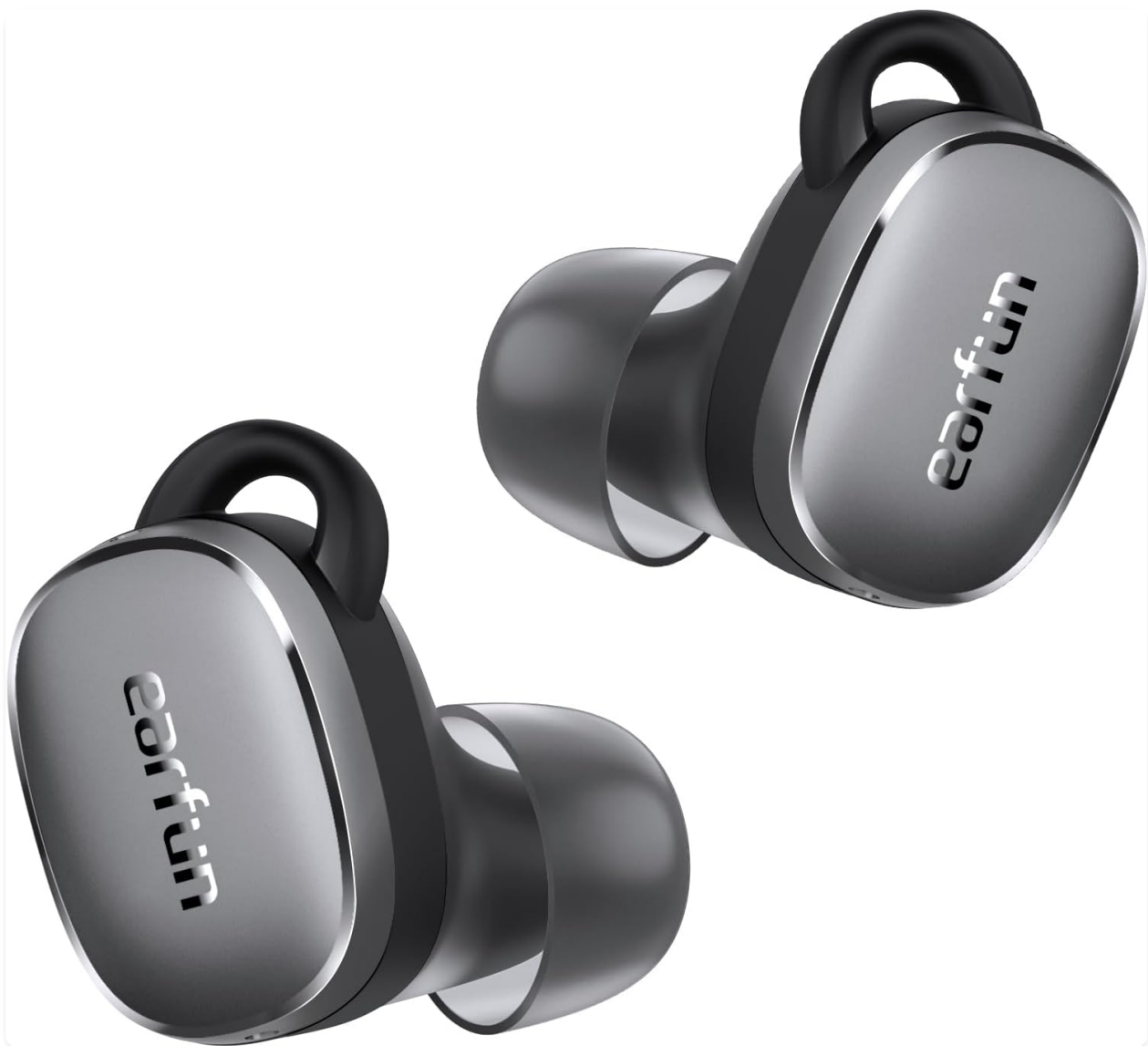
Image: EarFun Free Pro 3 Wireless Earbuds and their charging case.