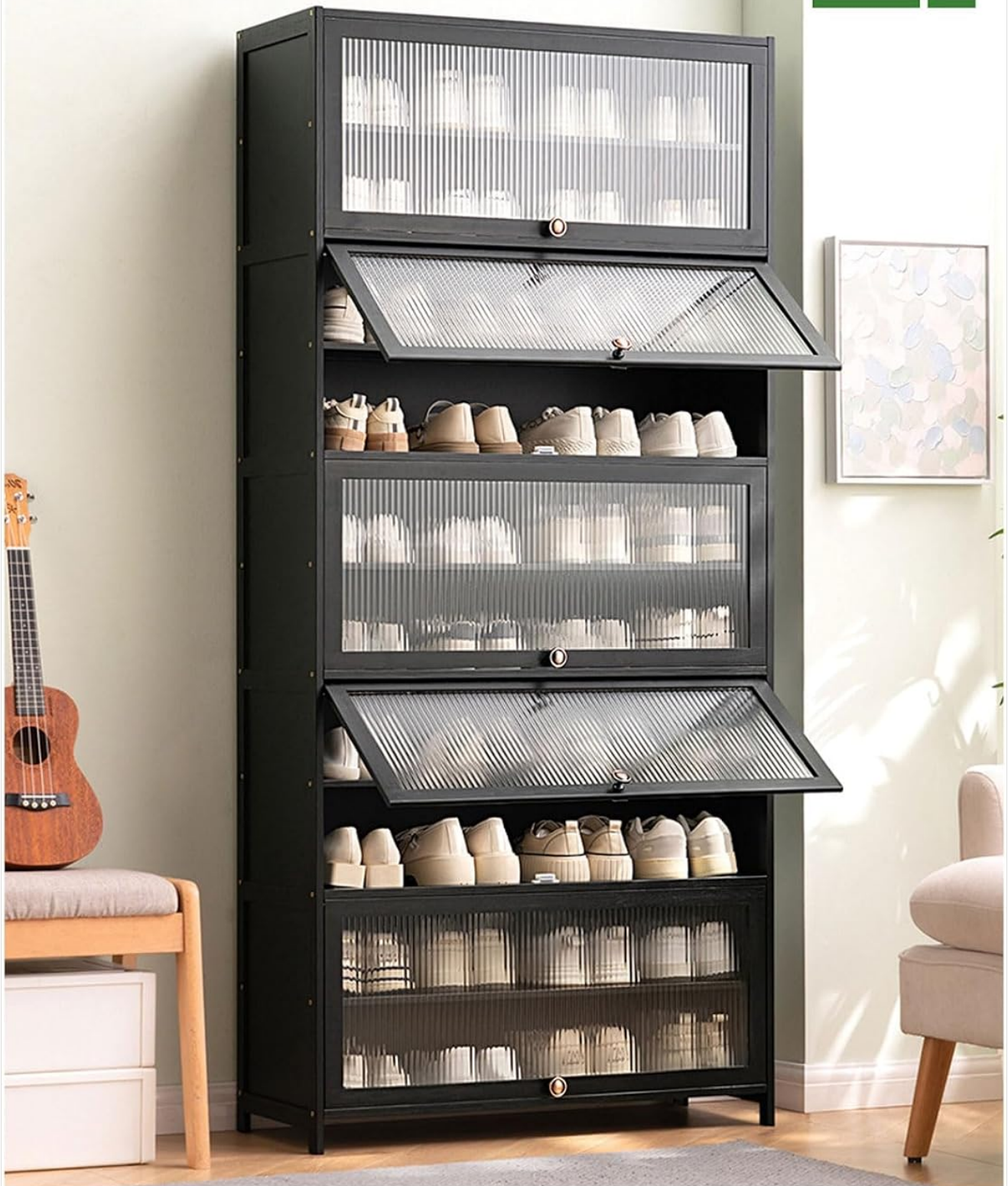
Figure 2.2: Illustration of the intimate large capacity of the multi-layer storage. This image displays a taller version of the cabinet with multiple tiers, demonstrating how the flap doors open for easy access to shoes.

Multi-layer storage, easy to store the family's shoes