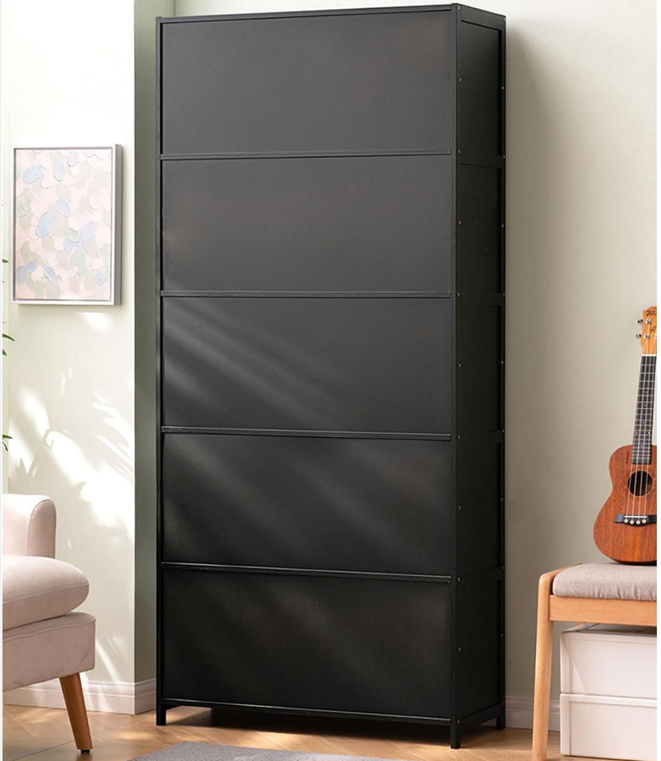
Figure 2.3: Rear view of the shoe cabinet, highlighting its fully sealed and dustproof design. The back panel, side panels, and laminates are made of composite materials for protection.

The back panel, side panels and laminates are all made of composite panels, which are dust-proof and drop-proof