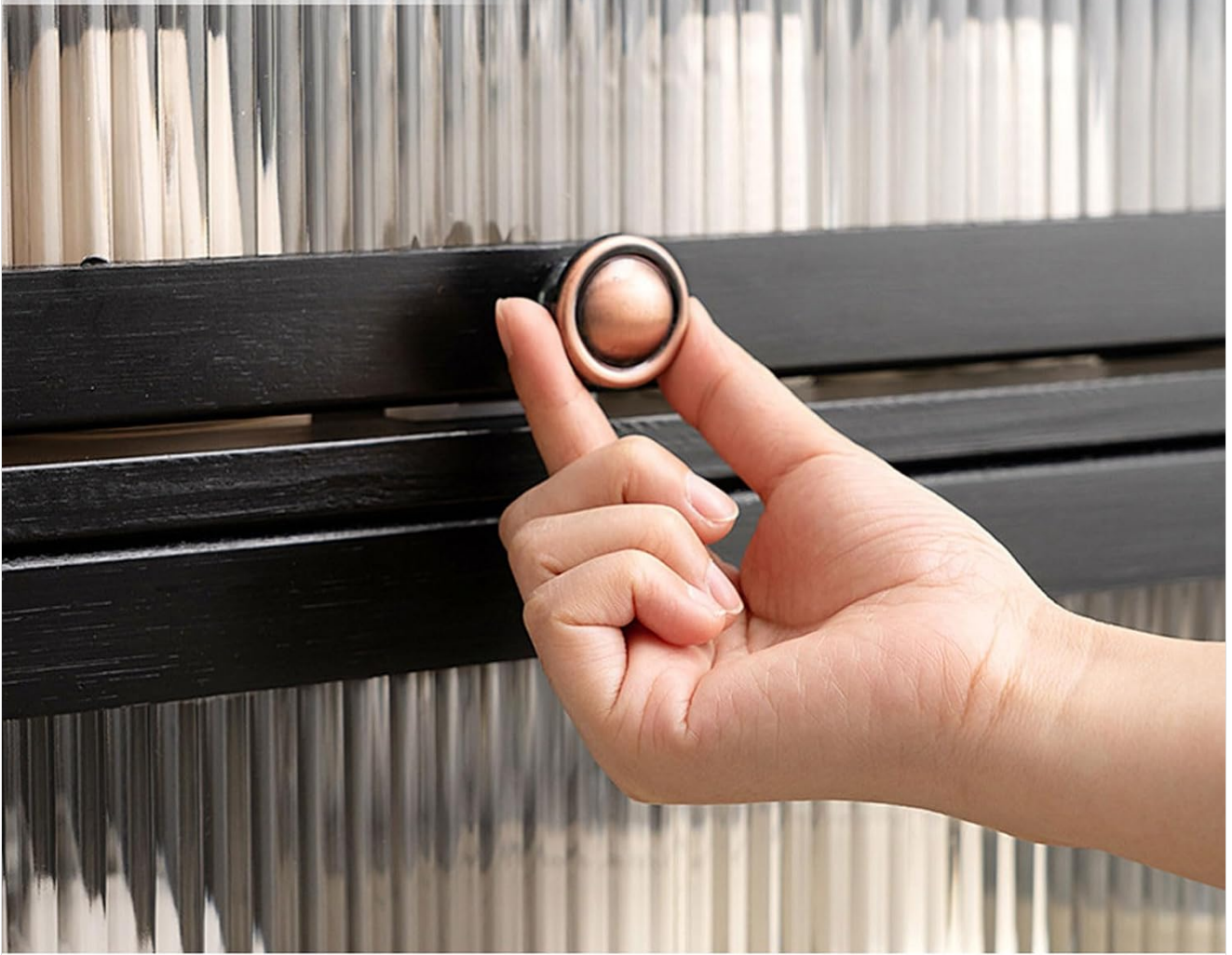
Figure 5.3: Detail of the exquisite, round, and comfortable handle, designed for easy opening.