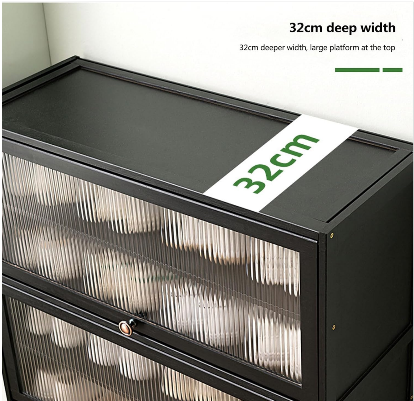
Figure 3.2: Close-up view emphasizing the 32cm deep width of the cabinet, providing ample storage space.