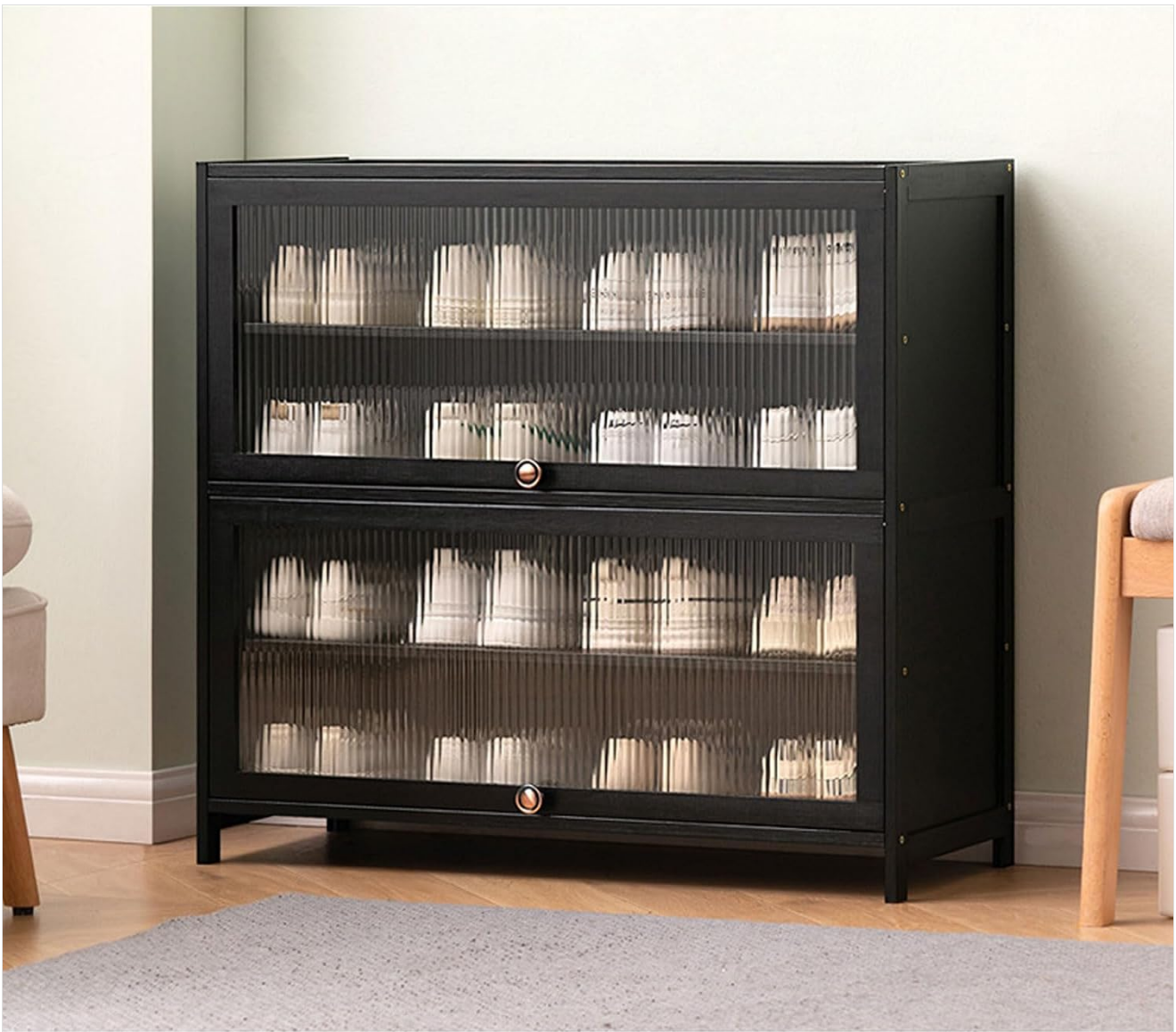
Figure 2.1: Front view of the assembled Black 5-Tier Shoe Cabinet. This image shows the two main sections of the cabinet, each with two transparent Changhong flap doors, filled with shoes.