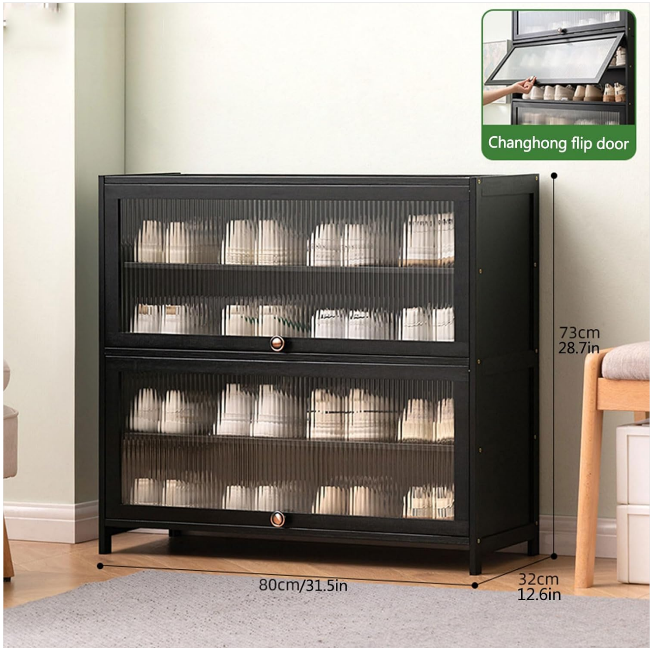
Figure 3.1: Dimensions of the shoe cabinet, showing a length of 80cm (31.5in), width of 32cm (12.6in), and height of 73cm (28.7in).