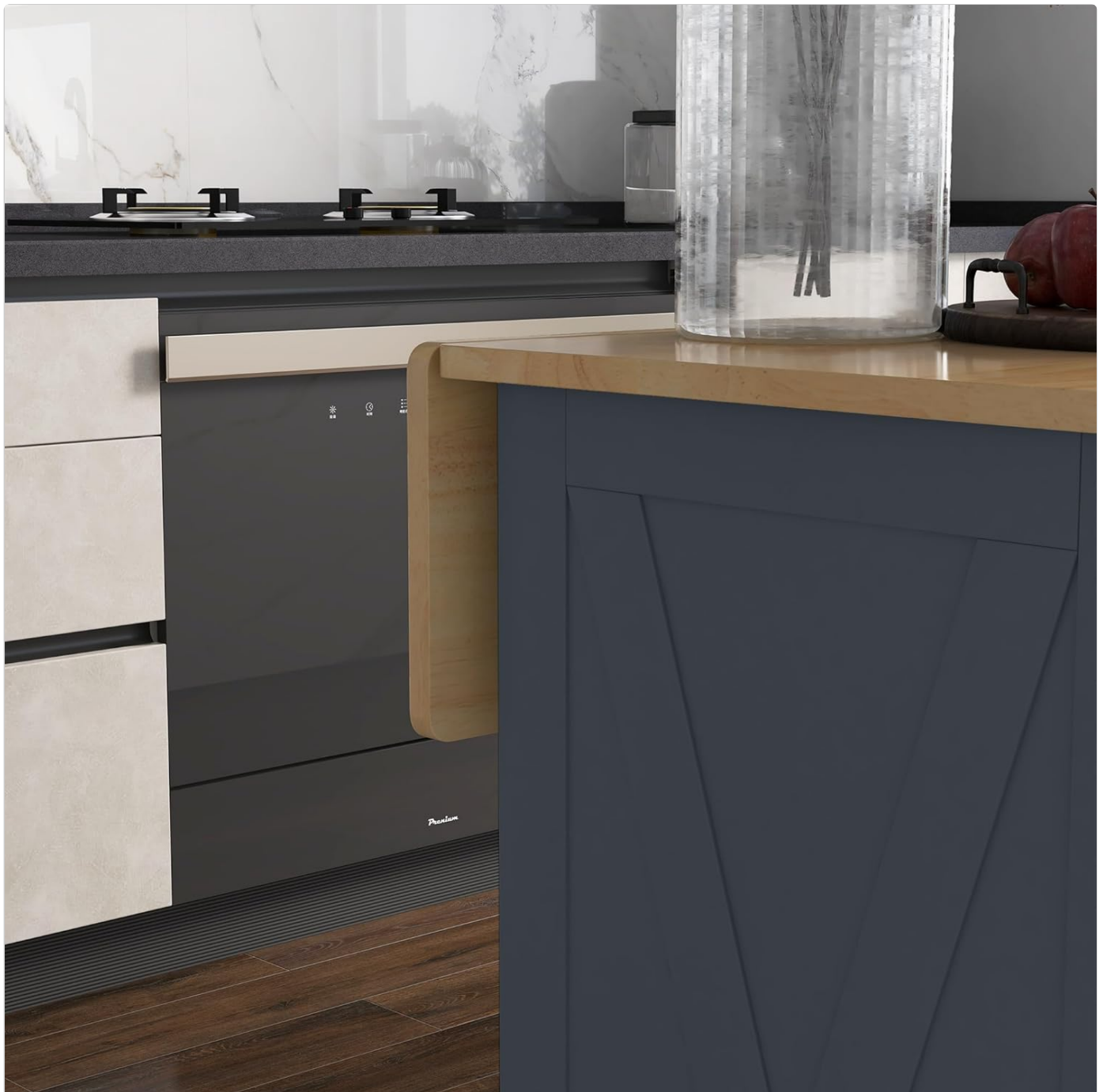
Figure 4: Easy Movement Casters

This image shows one of the hidden rolling casters located at the bottom of the kitchen island, illustrating its design for easy movement and the presence of a locking brake mechanism.