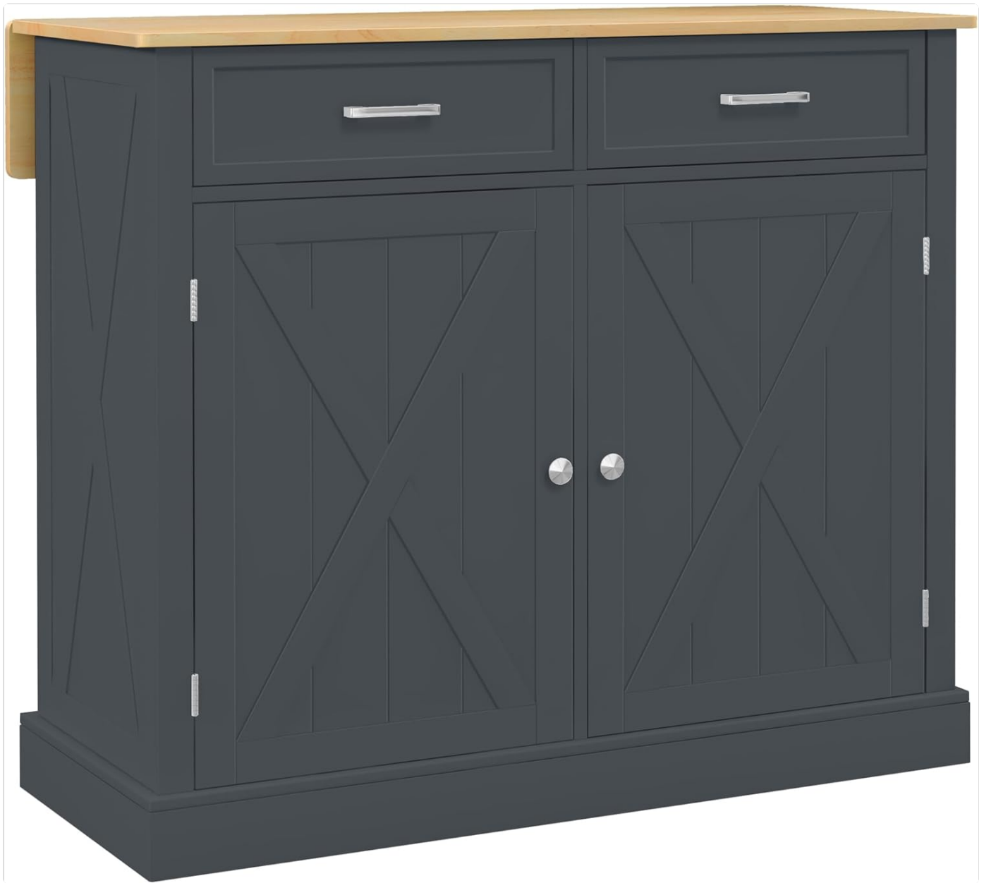
Figure 1: HOMCOM Rolling Kitchen Island, Dark Gray

This image displays the HOMCOM Rolling Kitchen Island in its dark gray finish with a wood-tone countertop. The island features two top drawers and two lower cabinet doors with a barn door style design, and a visible drop leaf on the side.