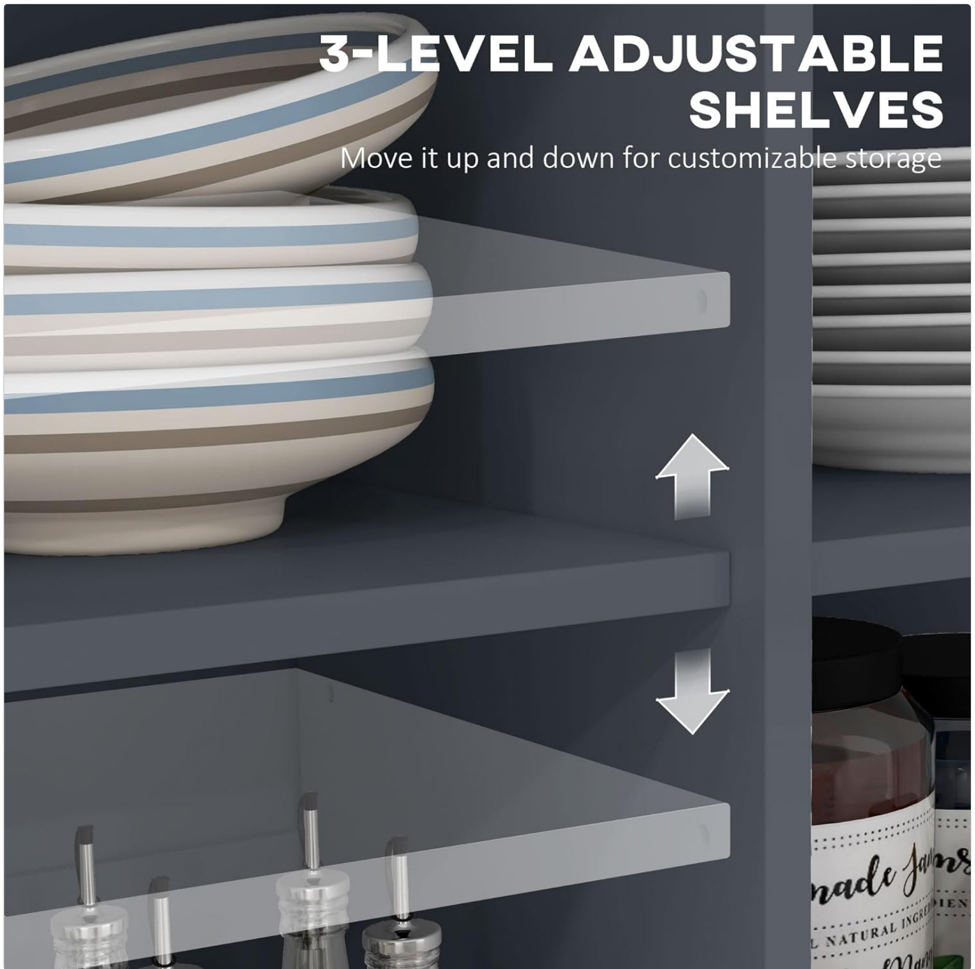
Figure 2: Large Storage Space

This image illustrates the interior storage capacity of the kitchen island, showing the two pull-out drawers and the two-door cabinet opened to reveal adjustable shelves filled with dishes and kitchen items.