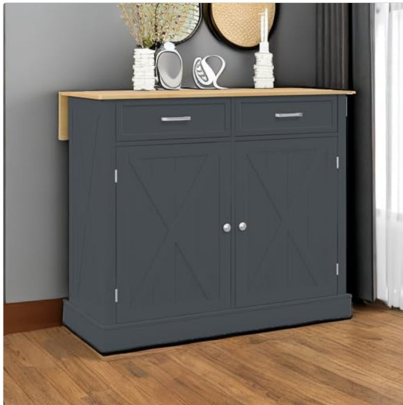
Figure 6: Drop Leaf Mechanism

A detailed view of the drop leaf in its extended position, showing the supporting bracket that holds the leaf level with the main countertop.