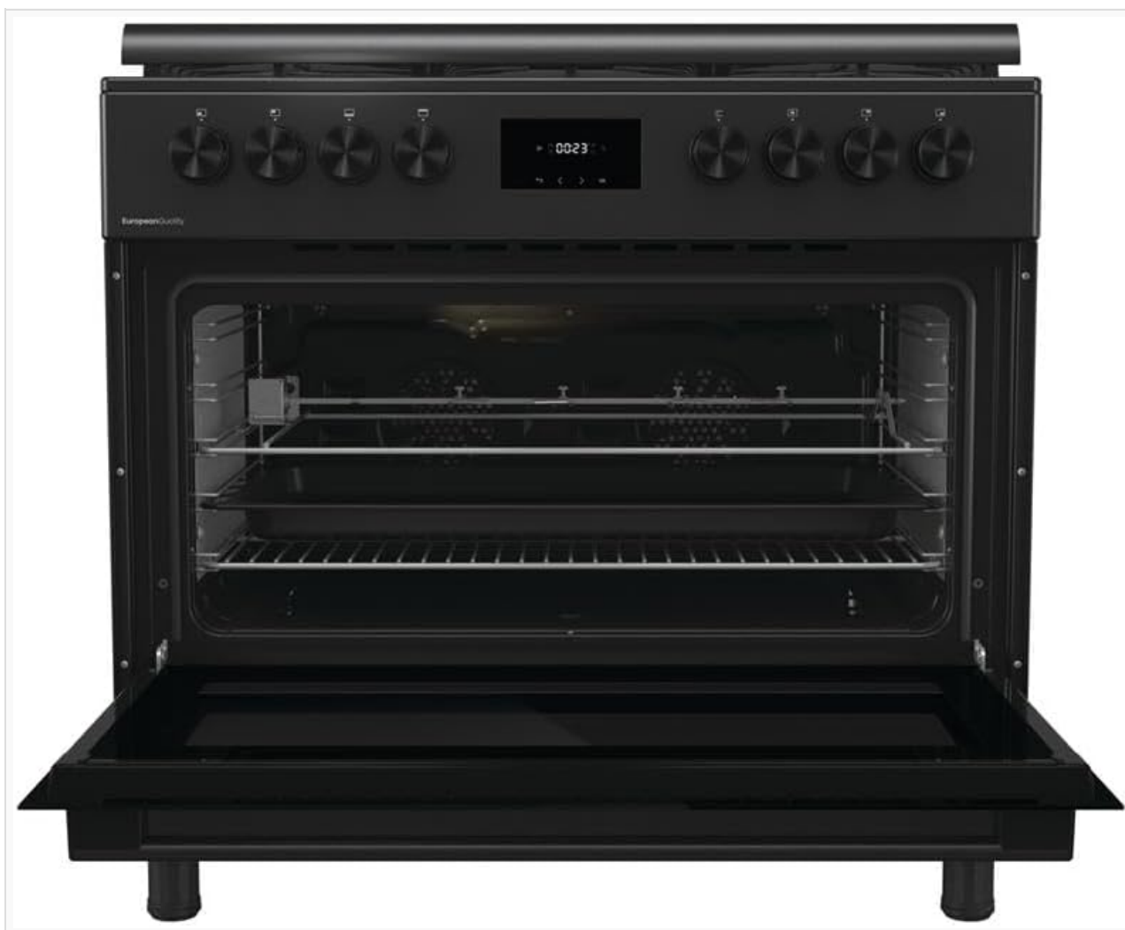
Figure 5.2.1: Oven accessories, including racks and tray, which can be removed for cleaning.