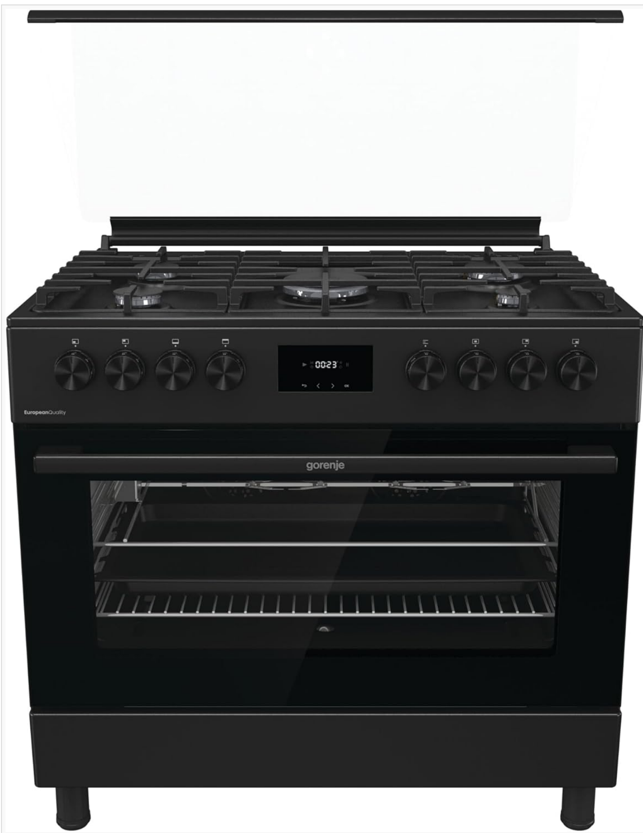
Figure 3.4.1: Front view of the Gorenje GGI9C20B, ready for initial cleaning and setup.