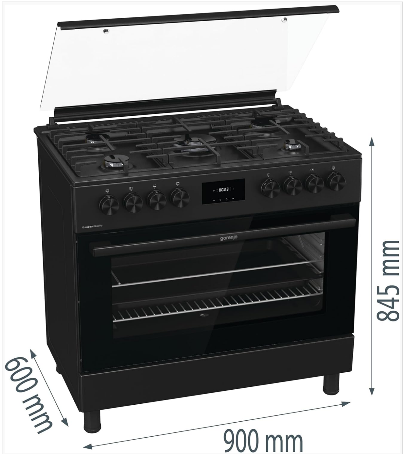
Figure 3.2.1: Gorenje GGI9C20B Gas Cooker with indicated dimensions for installation planning.

Position the cooker on a stable, level surface. Ensure adequate clearance from adjacent walls and cabinets as specified in the installation guide provided with the appliance. The cooker's dimensions are approximately 60 cm (Depth) x 90 cm (Width) x 87 cm (Height).