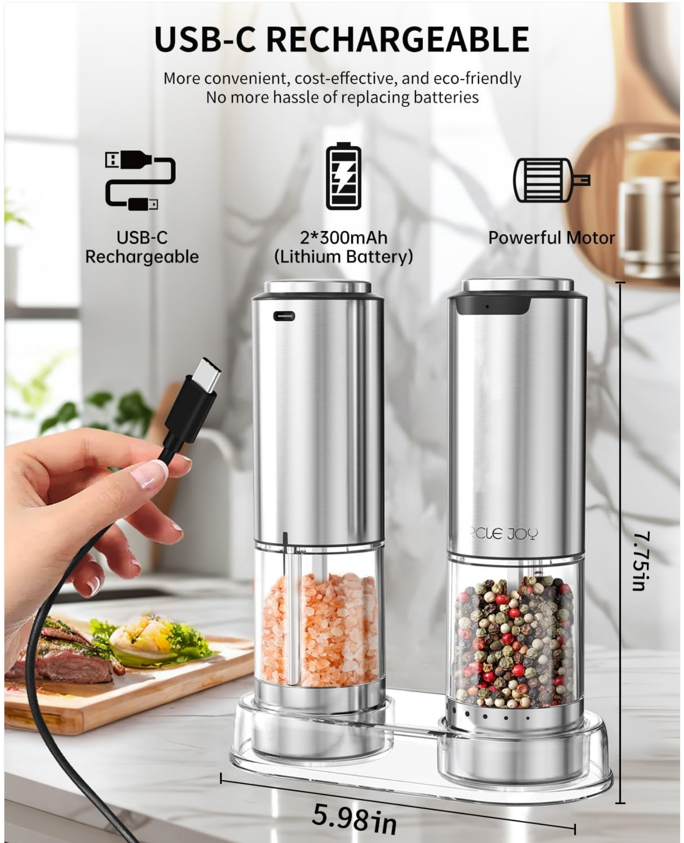
Figure 1: Grinders on charging base, illustrating USB-C charging and dimensions.

Before first use, fully charge both grinders. Place them onto the included charging base and connect the USB-C cable to a suitable power source. The grinders feature internal rechargeable batteries, eliminating the need for disposable batteries.