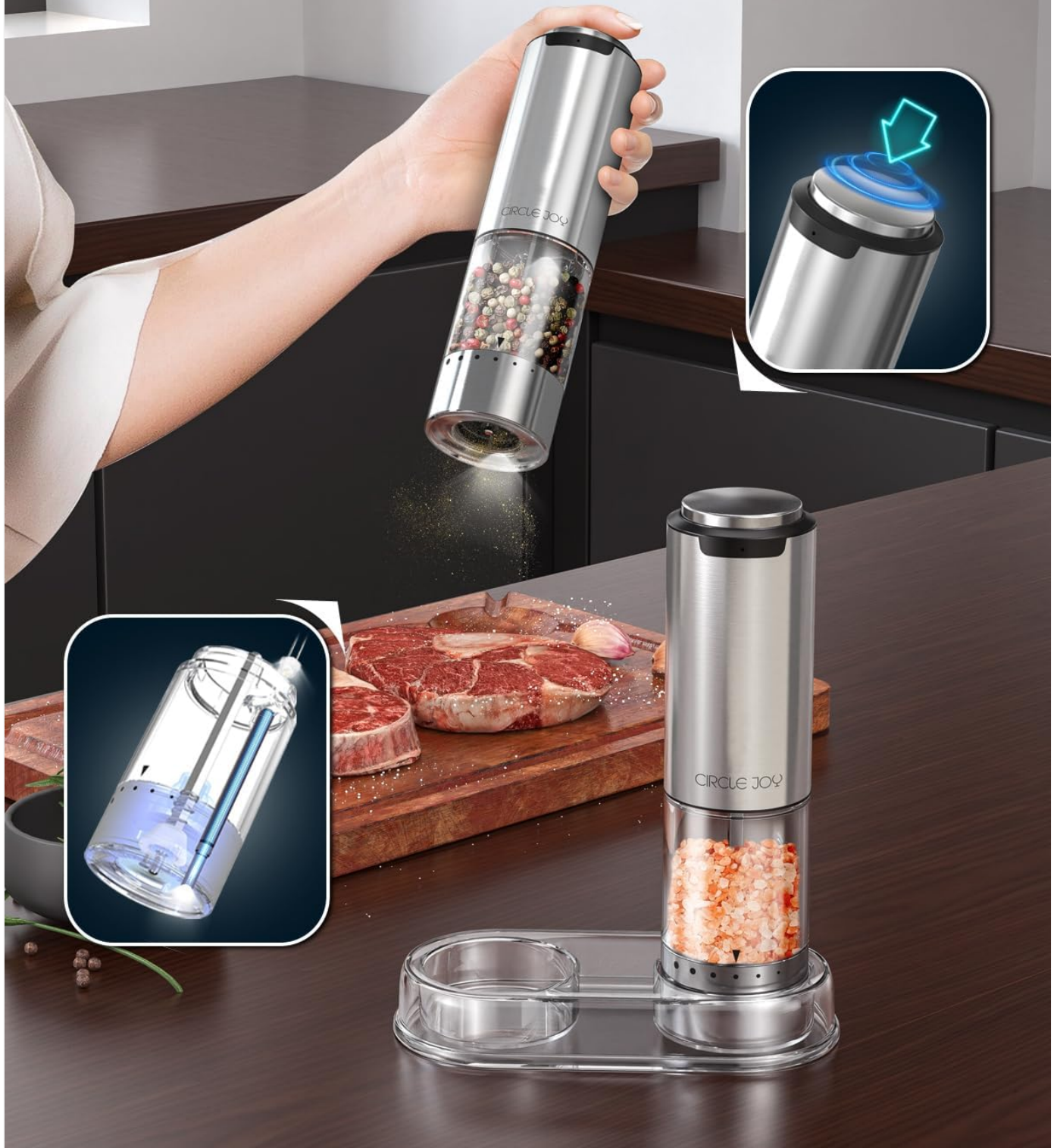
Figure 3: One-button operation and LED light feature.