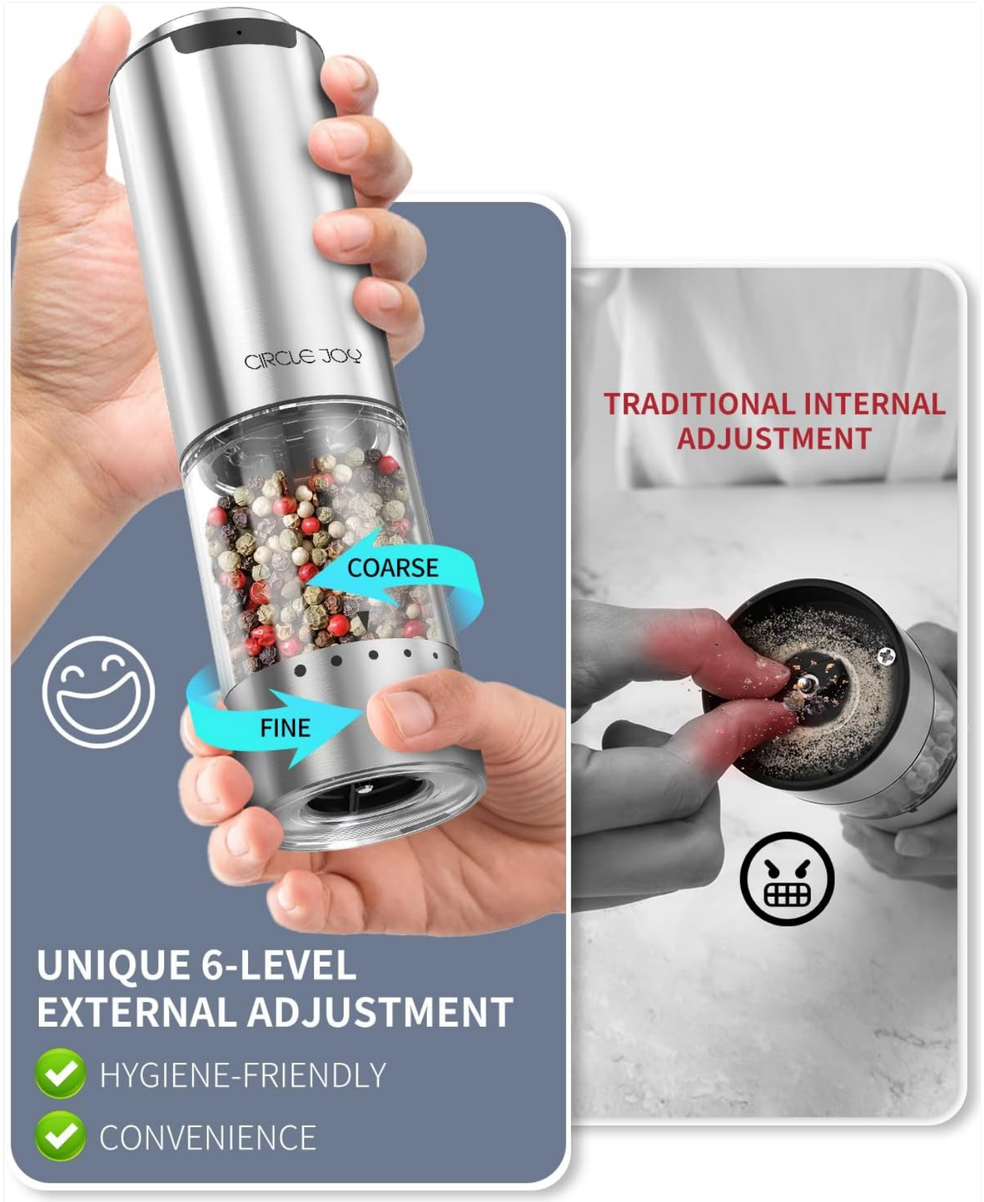
Figure 4: External coarseness adjustment for hygiene and convenience.

towards 'COARSE' will produce a coarser grind. The unique 6-level external adjustment provides precision for various cooking needs.