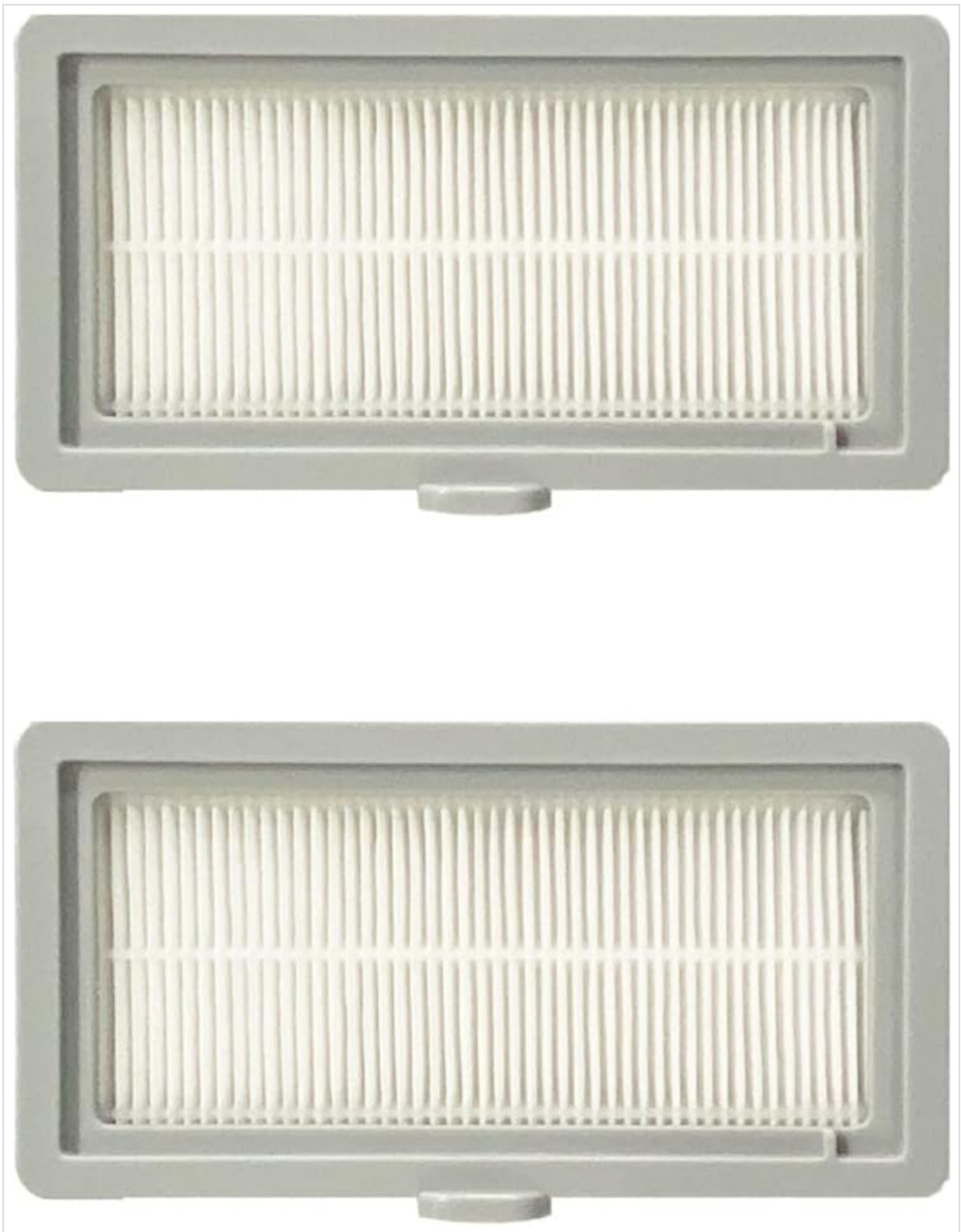
Image: Two new EtlIN Hepa filters, ready for installation. These filters feature a light grey frame and white pleated filtration material.