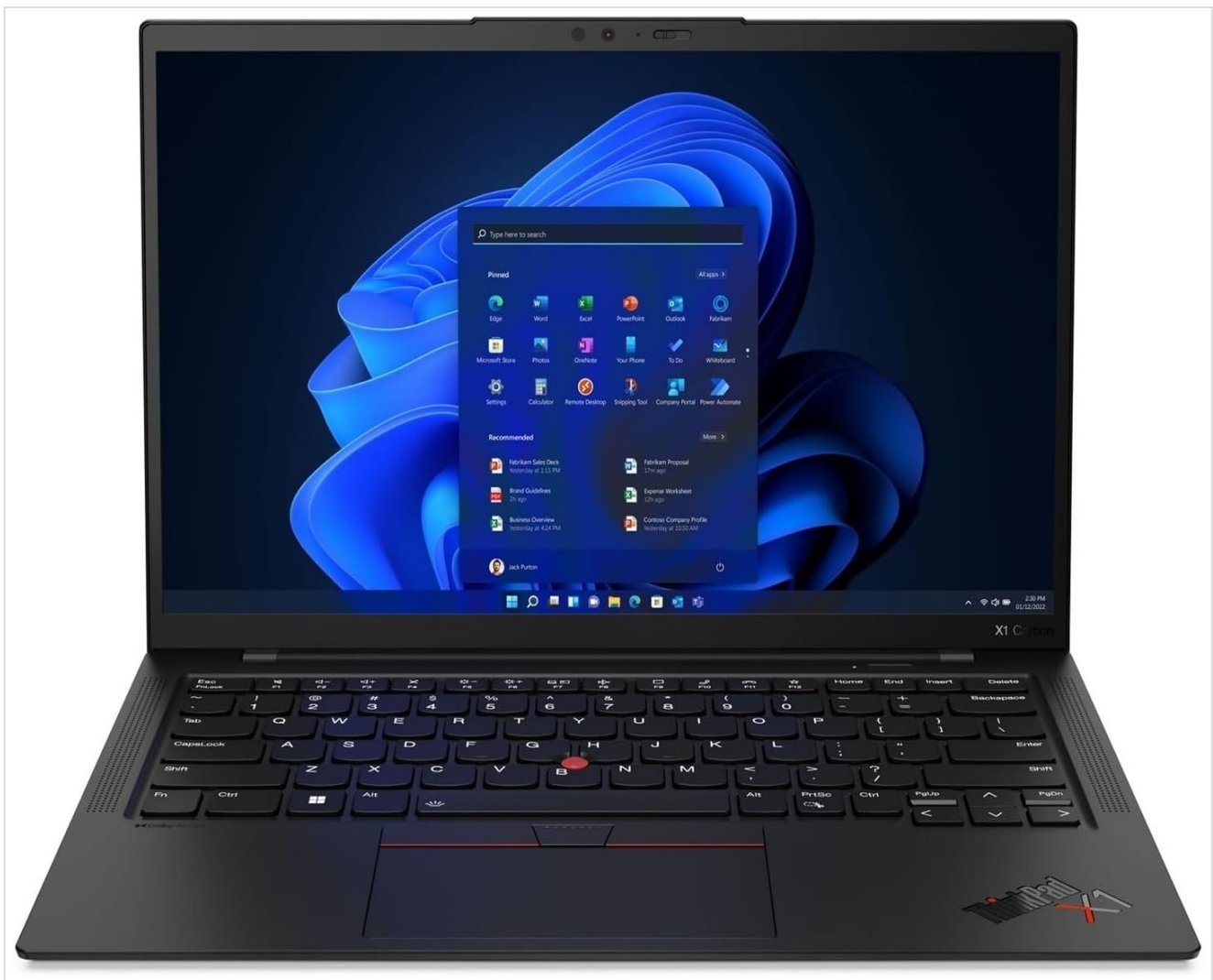
Figure 1: Lenovo ThinkPad X1 Carbon Gen 11 Laptop. This image shows the laptop open, displaying the Windows 11 operating system interface on its screen.