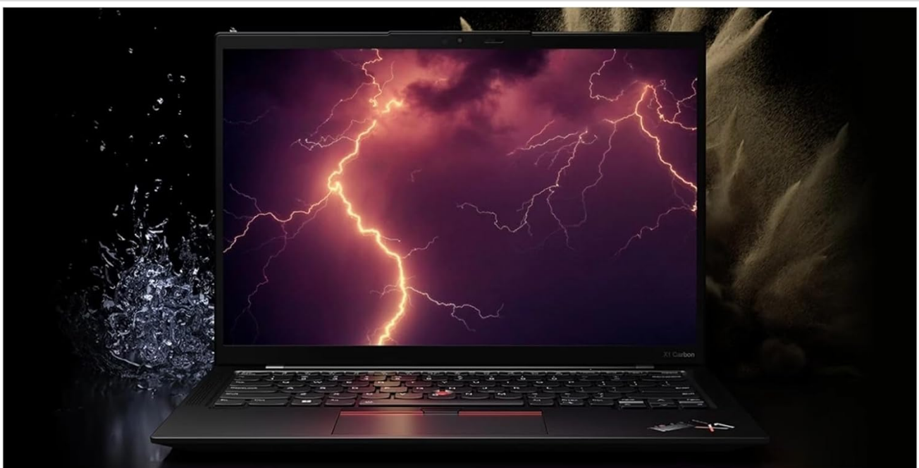
Figure 6: Cooling System. This image highlights the laptop's design, which includes an air intake system under the keys and dual fans for efficient thermal management.

The legendary ThinkPad keyboard is designed for ergonomics and comfort—and part of that comfort means improved airflow. The underside of the keys facilitates air intake when in use. Combined with the dual fan and rear venting, the ThinkPad X1 Carbon Gen 11 notebook delivers improved thermals. So whether you're powering through your day, or your night, or both, the X1 will stay as cool as you are.