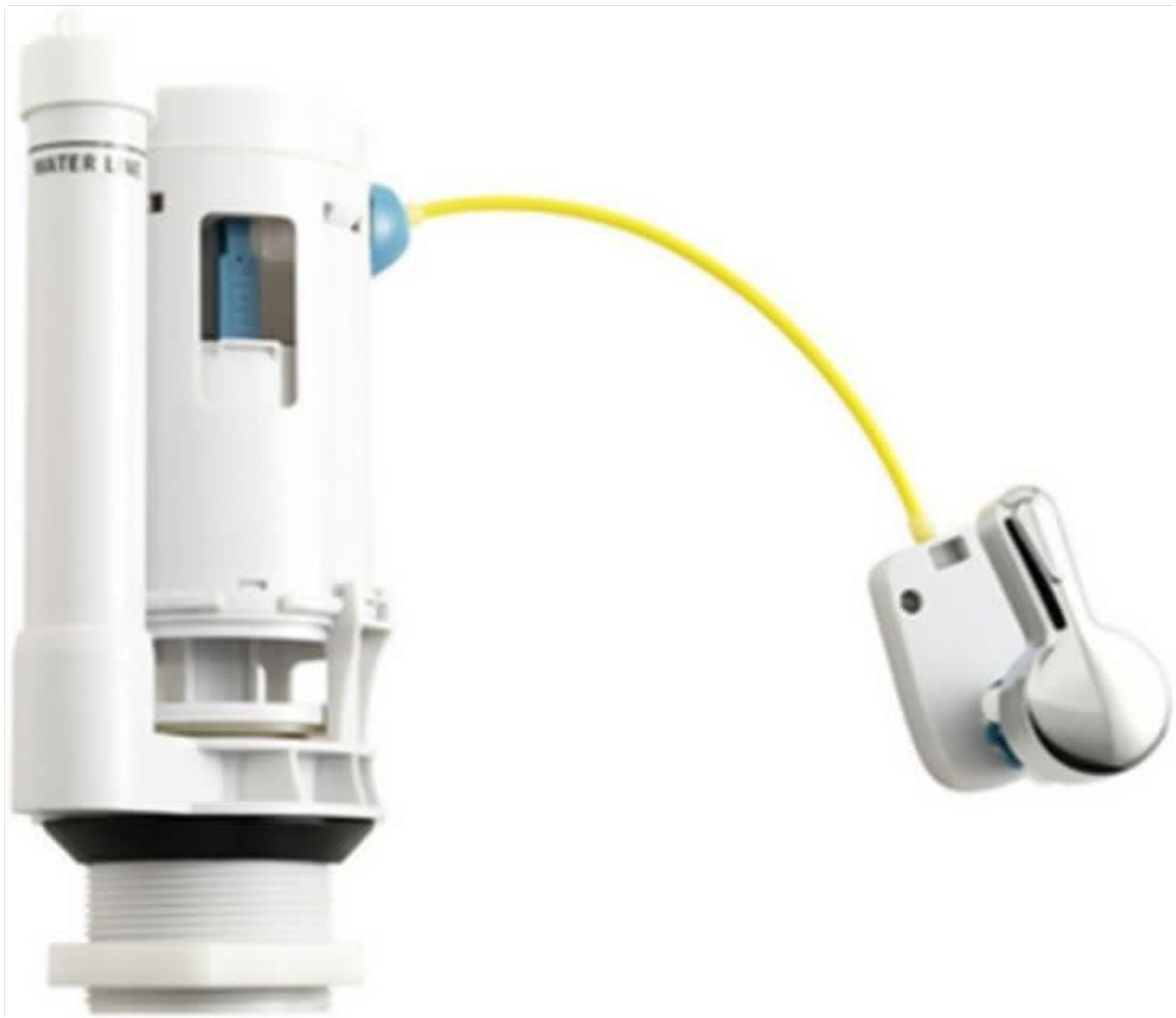
Image 1: The PROFLO PF9312FVPK Dual Flush Valve Assembly with its included trip lever and connecting hose.