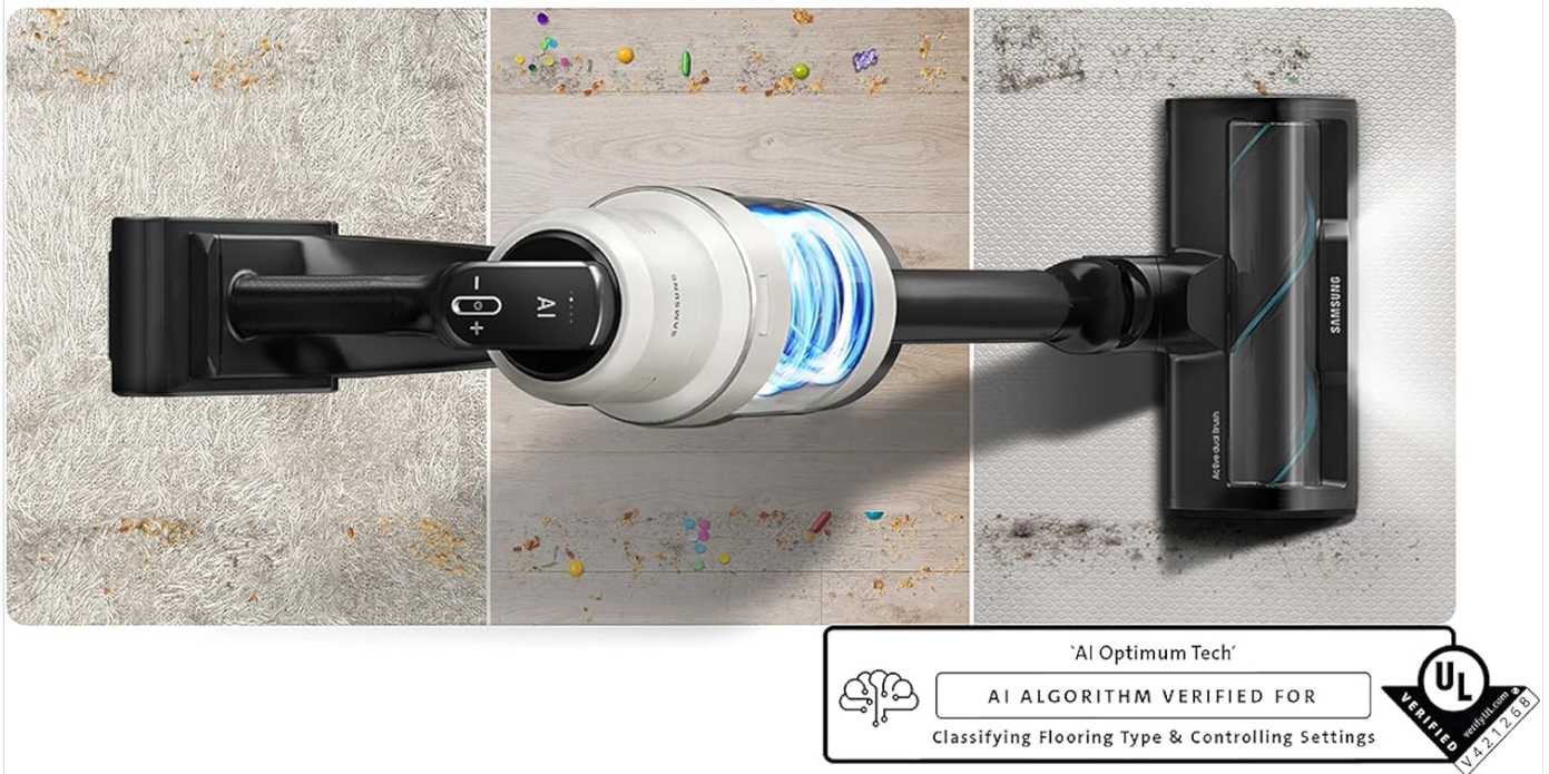
Image: The vacuum's AI Cleaning Mode intelligently detects the floor type (hardwood or carpet) and adjusts suction power automatically for optimal cleaning performance.

AI Cleaning Mode automatically senses floor type and optimizes suction, whether on hardwood or carpet, for efficient cleaning performance that suits any environment. It optimizes battery runtime so you get the most cleaning time between charges.