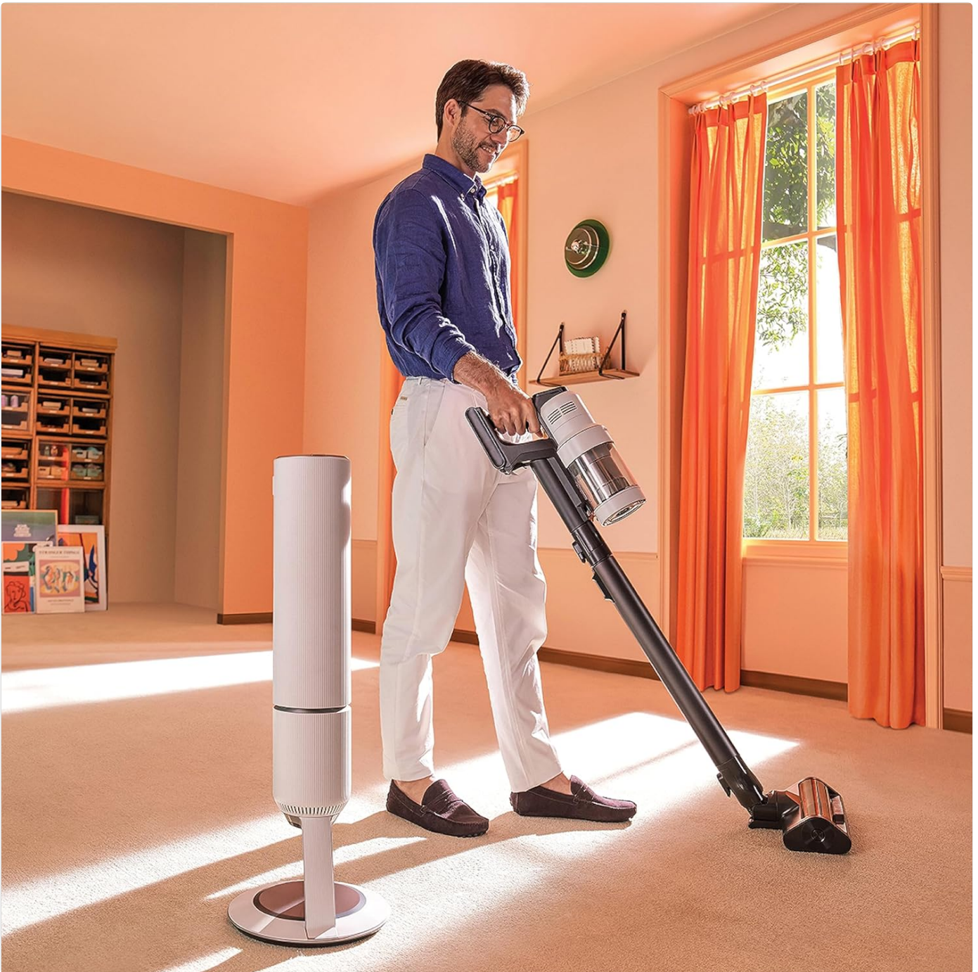
Image: The ergonomic, telescopic design features a 3-position wand, allowing users to adjust the vacuum's height for comfortable cleaning in various areas.