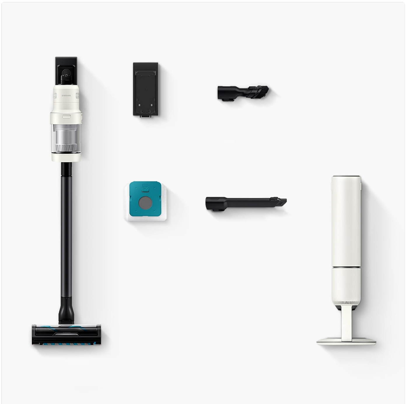
Image: All components of the SAMSUNG BESPOKE Jet AI vacuum cleaner, including the main body, wand, brush head, All-in-One Clean Station, and various accessories.