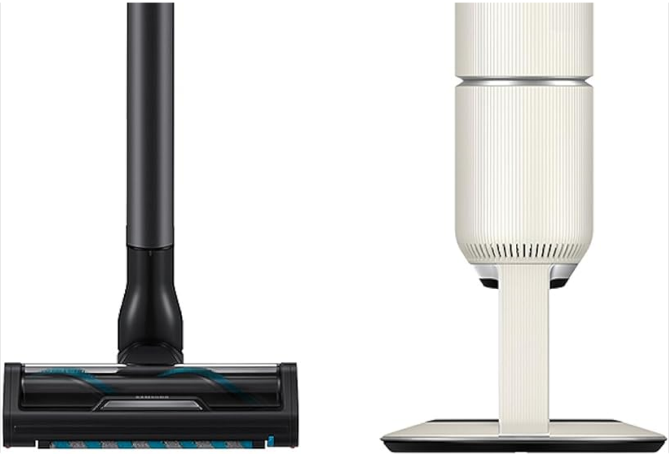
Image: The brushroll can be easily removed with the press of a button, allowing for convenient removal of tangled hair and debris.