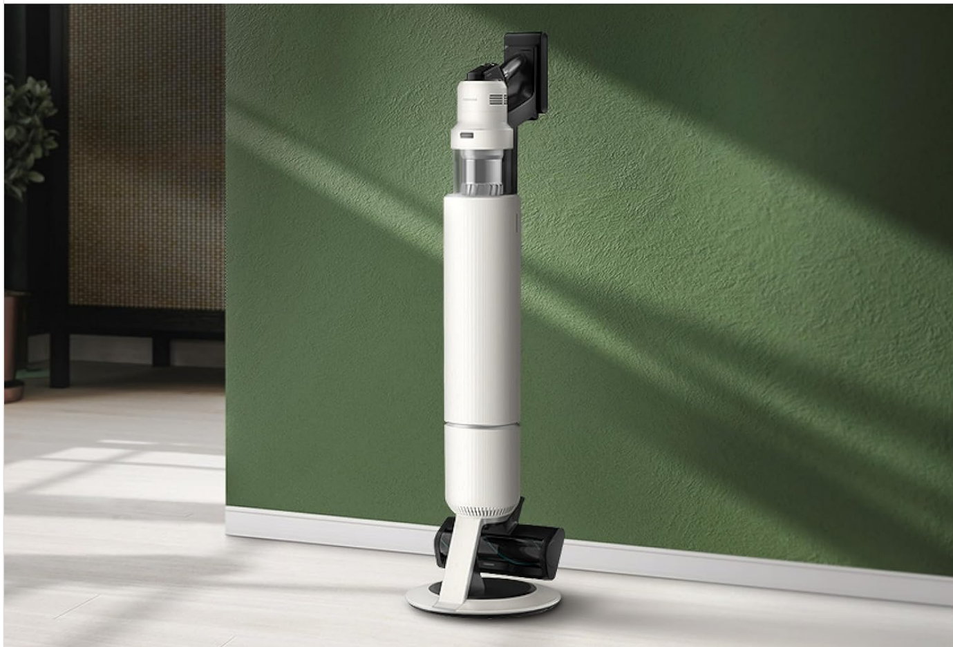
Image: The lightweight cordless design allows for easy maneuvering under sofas and in tight spaces, making whole-home cleaning convenient.

Innovative features, wrapped in a premium finish and color, deliver a vacuum so stunning you'll want to show it off.