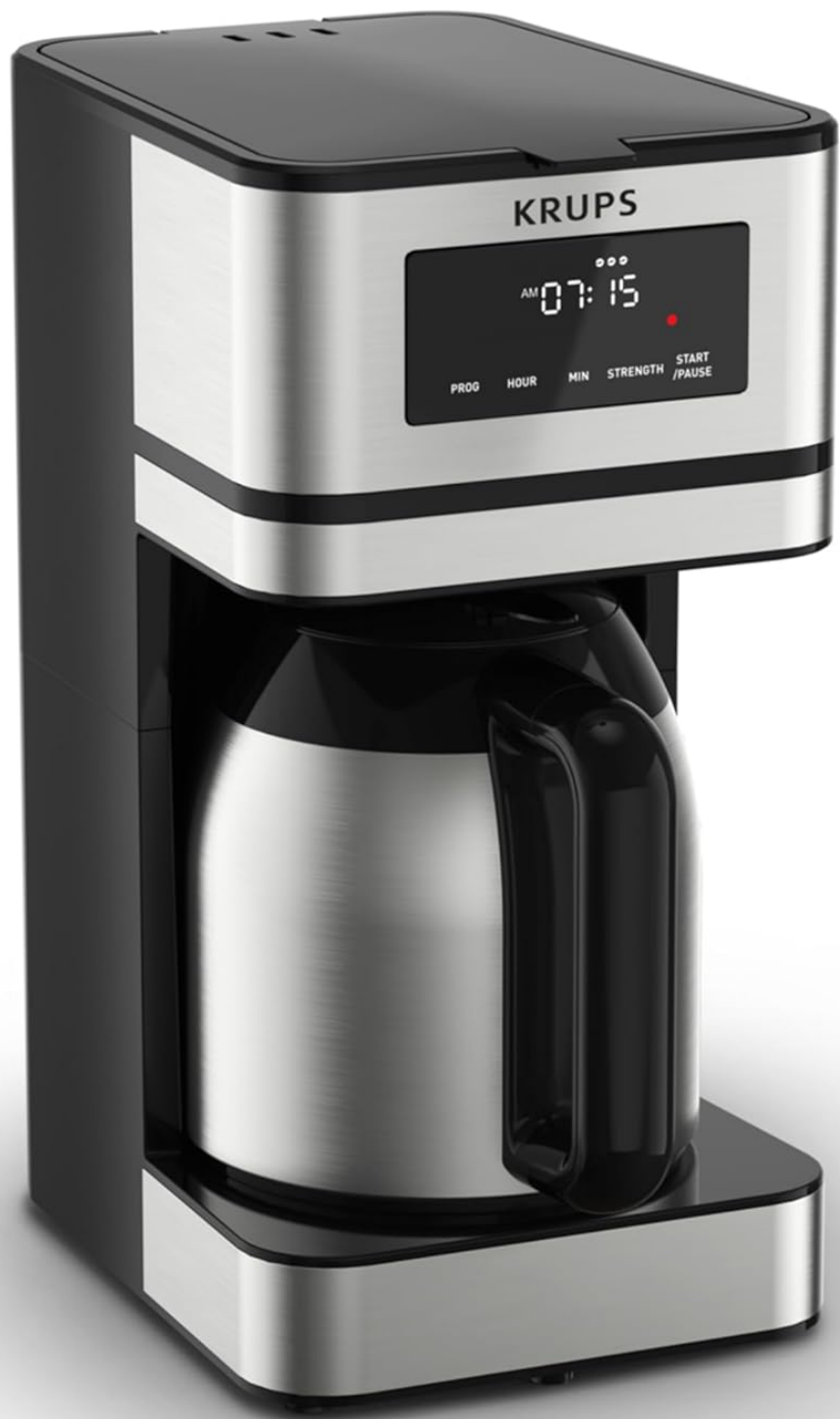
Image: The KRUPS Simply Brew 14-Cup Programmable Coffee Maker, showcasing its sleek design and stainless steel finish.