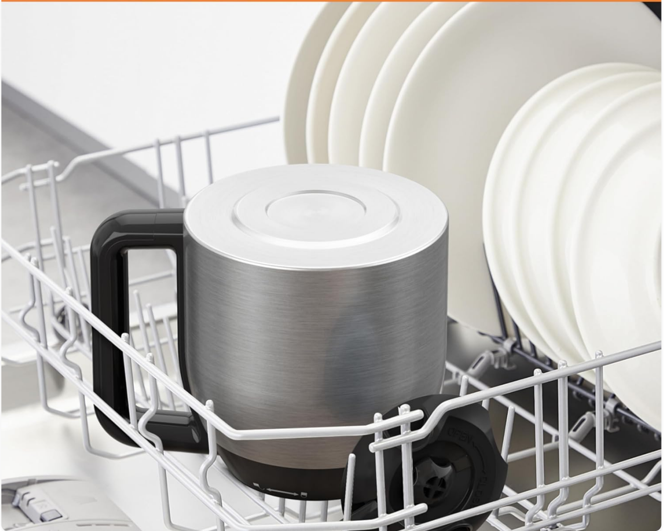
Image: The carafe placed in a dishwasher, illustrating its dishwasher-safe feature for easy cleaning.