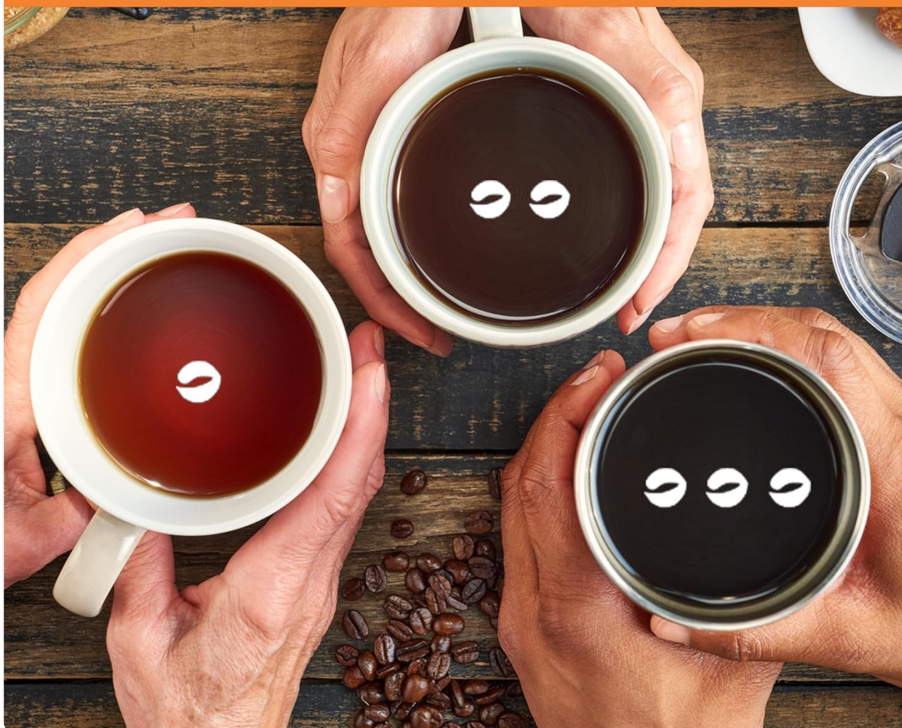
Image: Three cups of coffee representing different brew strengths (mild, medium, bold), illustrating the customization feature.