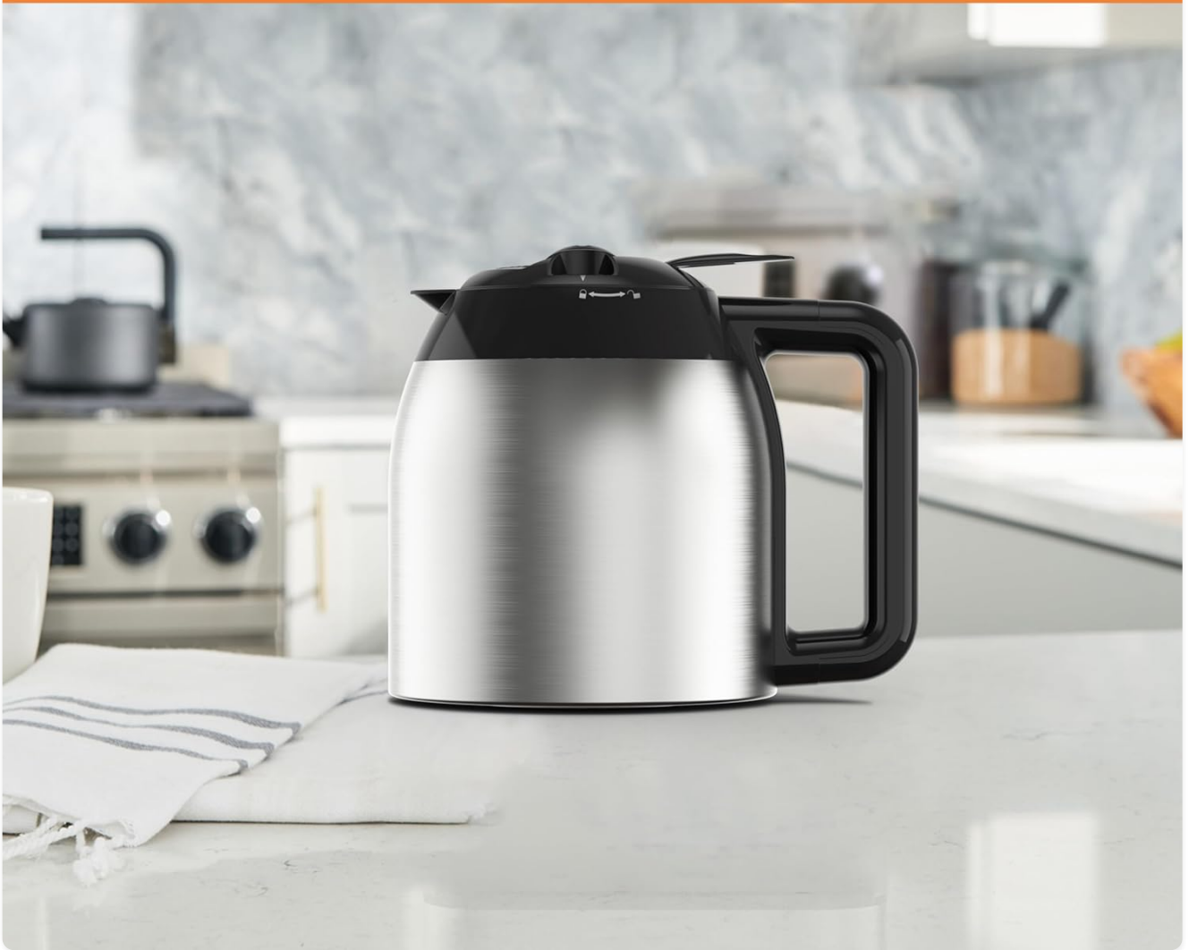
Image: The insulated stainless steel carafe on a kitchen counter, highlighting its ability to keep coffee warm.