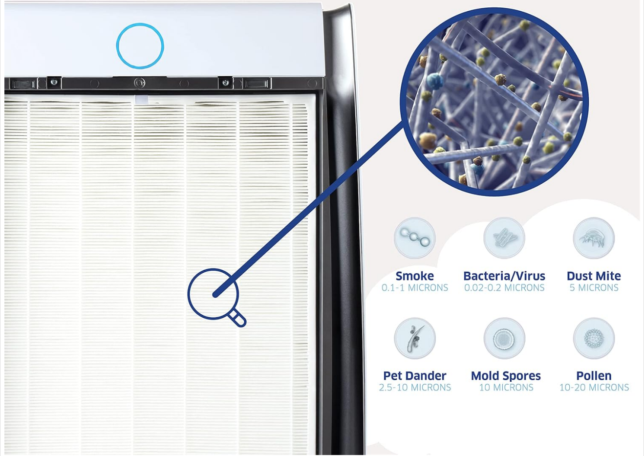
Image: A close-up view of the UltraHEPA filter, highlighting its pleated structure designed for fine particle capture.

Capture ultra-fine, airborne contaminants like dust, pollen, mold spores, smoke, pet hair, and dander, bacteria and viruses