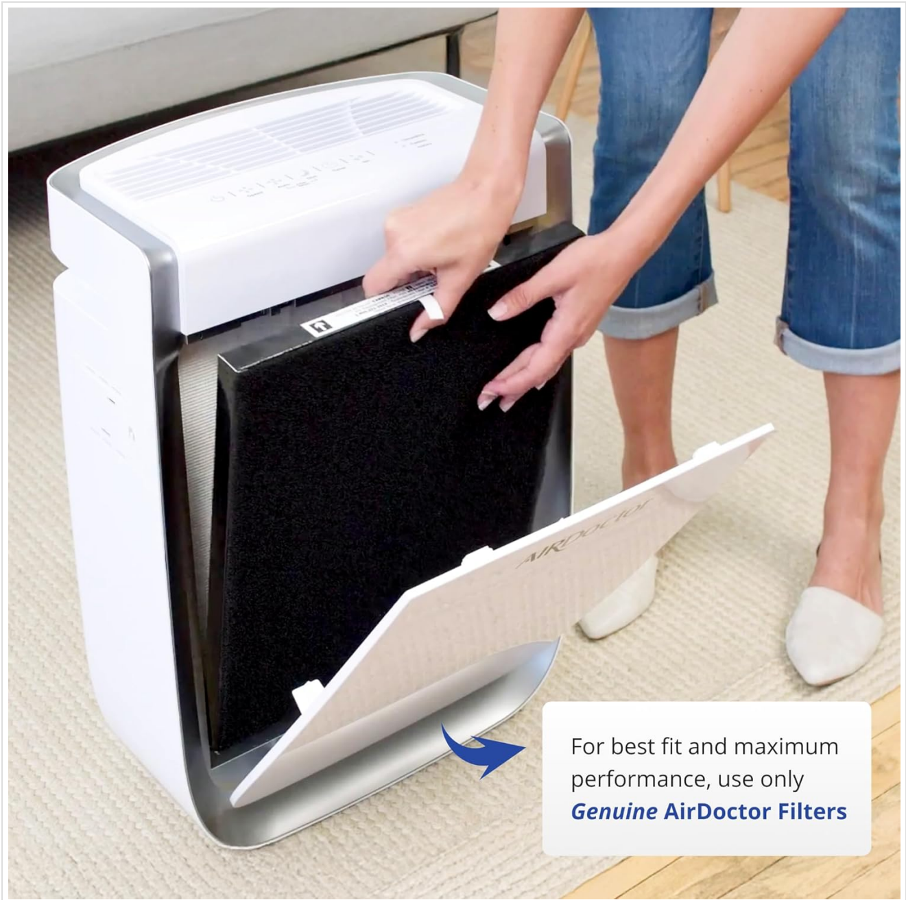
Image: A person installing a new filter into the AIRDOCTOR air purifier. The front cover is open, revealing the filter compartment.