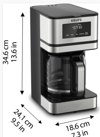
Diagram showing the dimensions of the coffee maker: 34.6 cm (13.6 in) height, 24.1 cm (9.5 in) depth, and 18.6 cm (7.3 in) width.

The carafe and filter basket placed in a dishwasher, highlighting their dishwasher-safe feature.