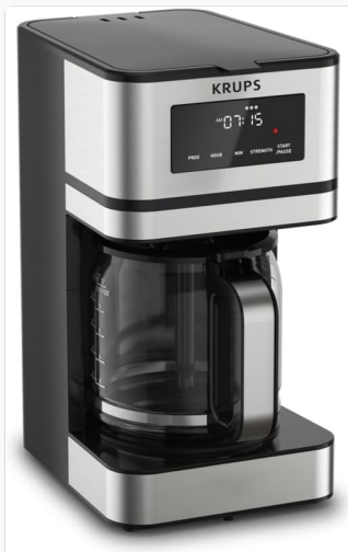
The main KRUPS 14-Cup Programmable Coffee Maker unit.