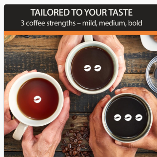
Image illustrating the three coffee strength options (mild, medium, bold) with coffee cups.

Close-up of the digital display, showing the programmable clock set to 07:15 AM.