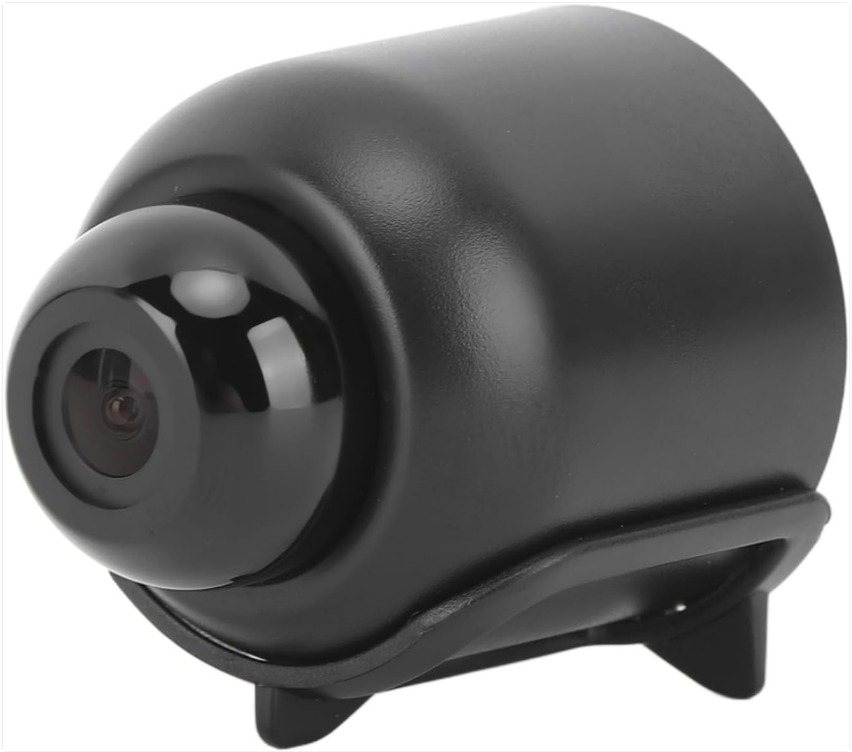
Figure 2: Front view of the Luqeeq 1080P HD Video Camera, showing the lens.