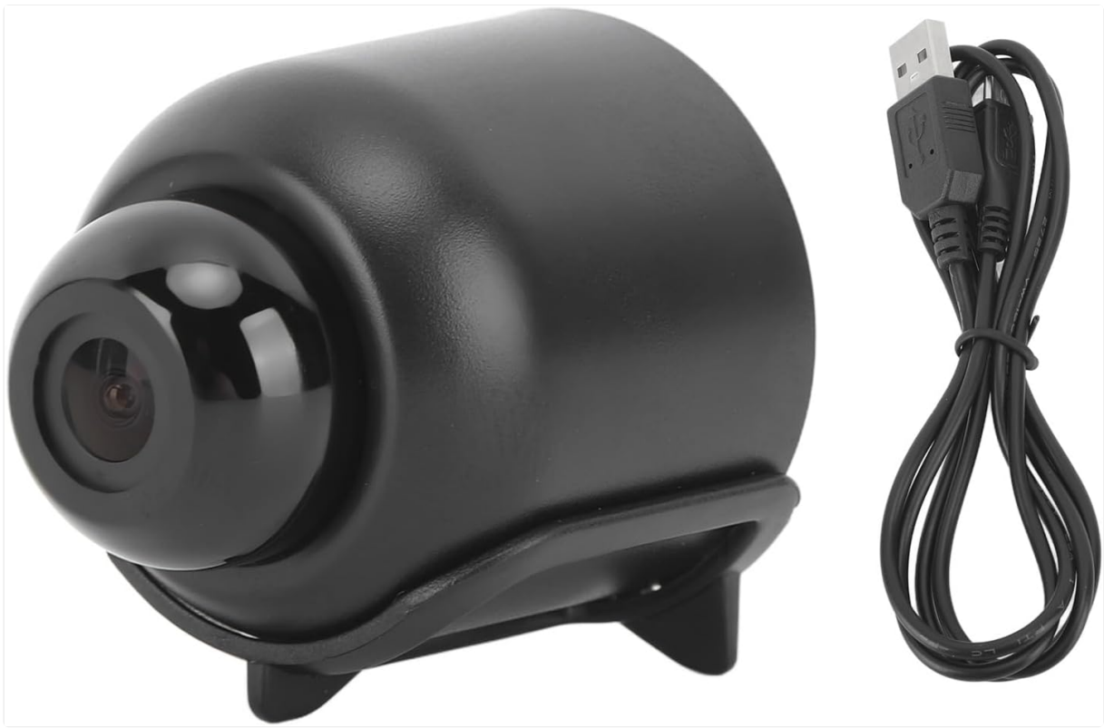
Figure 1: Luqeeq 1080P HD Video Camera and included USB power cable.