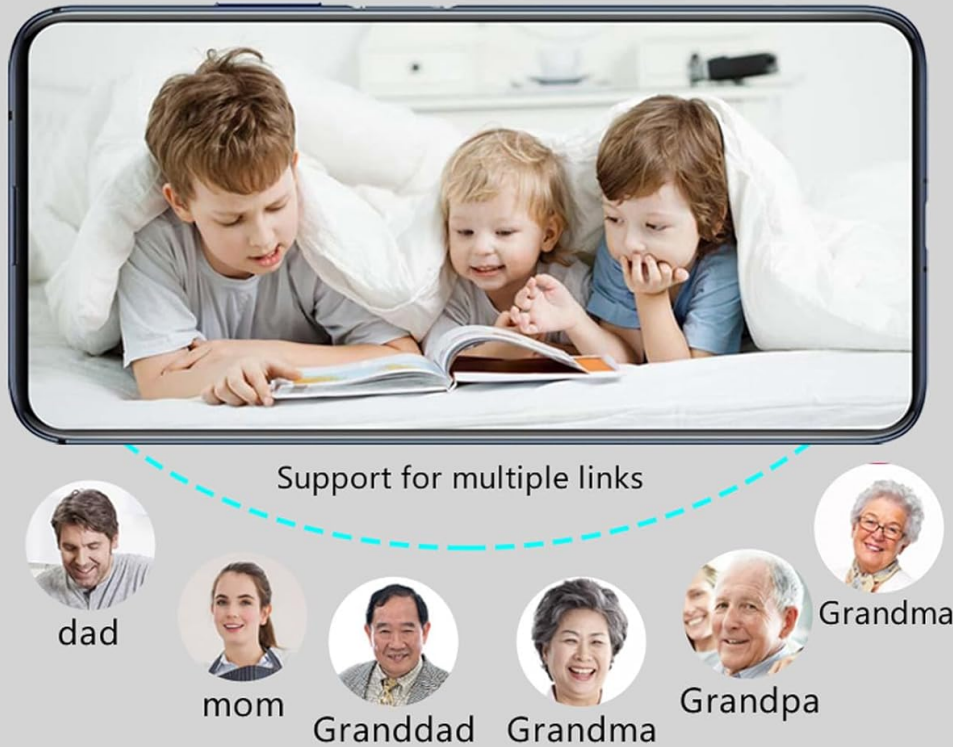
Figure 9: Depicts the user sharing functionality, allowing multiple users to access the camera feed.

The main account can add multiple sub accounts to view videos, and the whole family can add them. Support multiple accounts to watch online at the same time.