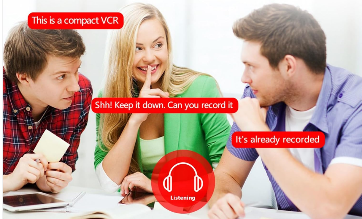
Figure 8: Representation of the camera's clear audio recording function.

The sound restoration degree is real, and the detail sound recording is clear, Help you record important sound evidence