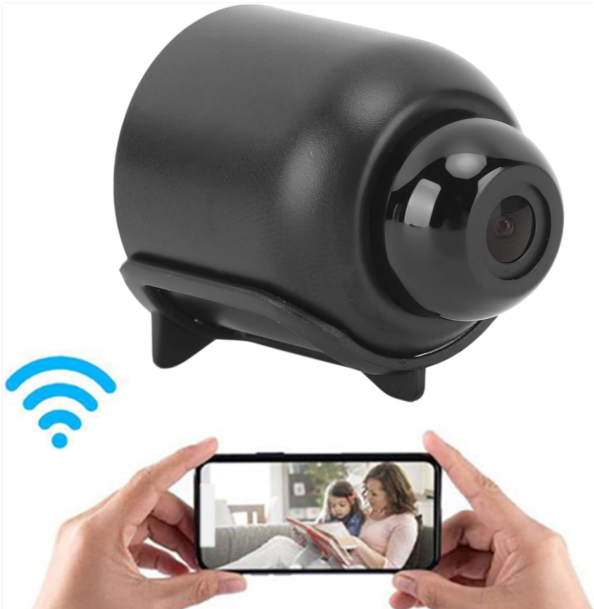
Figure 4: Illustrates the camera's Wi-Fi connectivity and remote viewing on a smartphone.