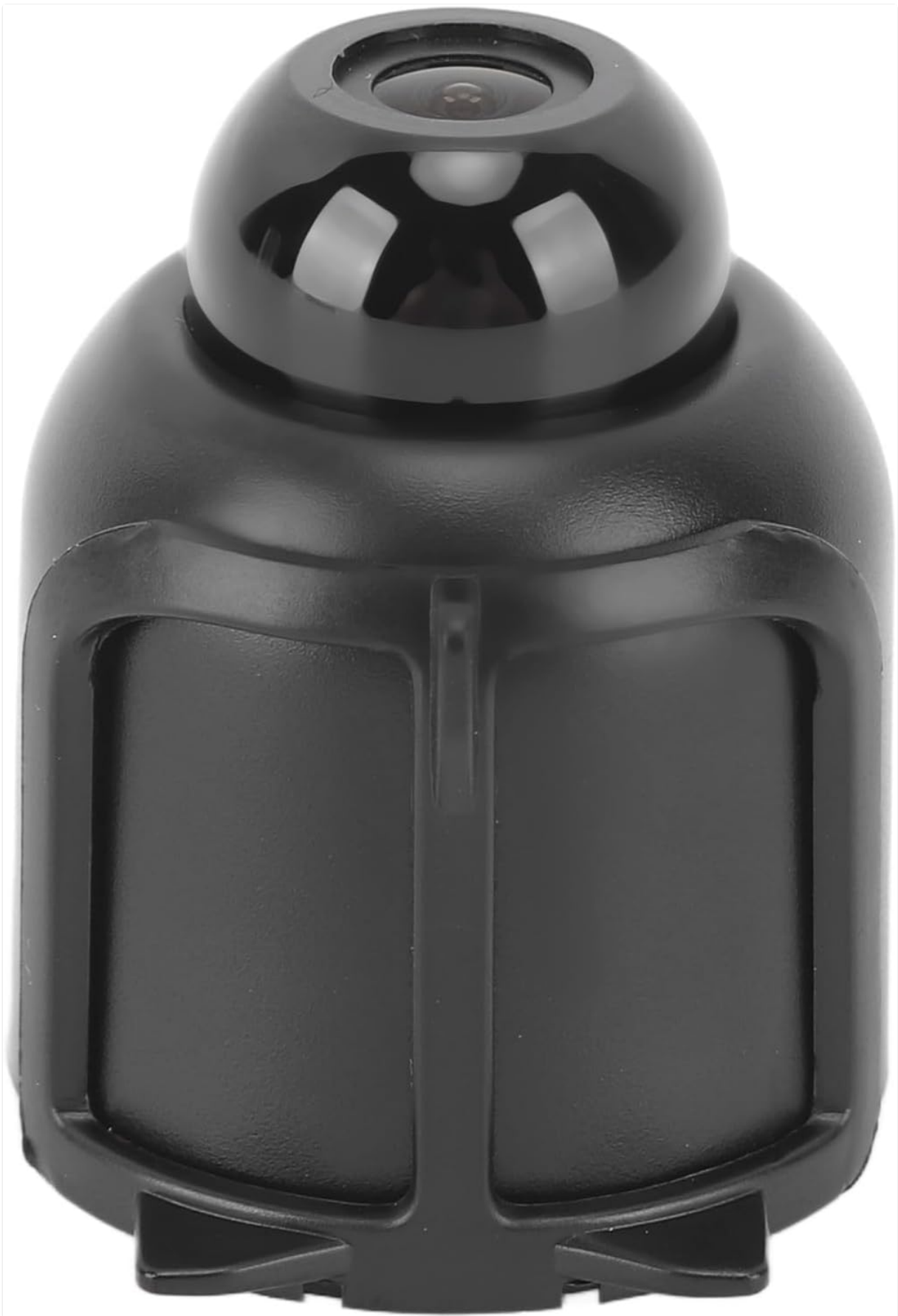
Figure 3: Rear view of the camera, illustrating the mounting bracket.