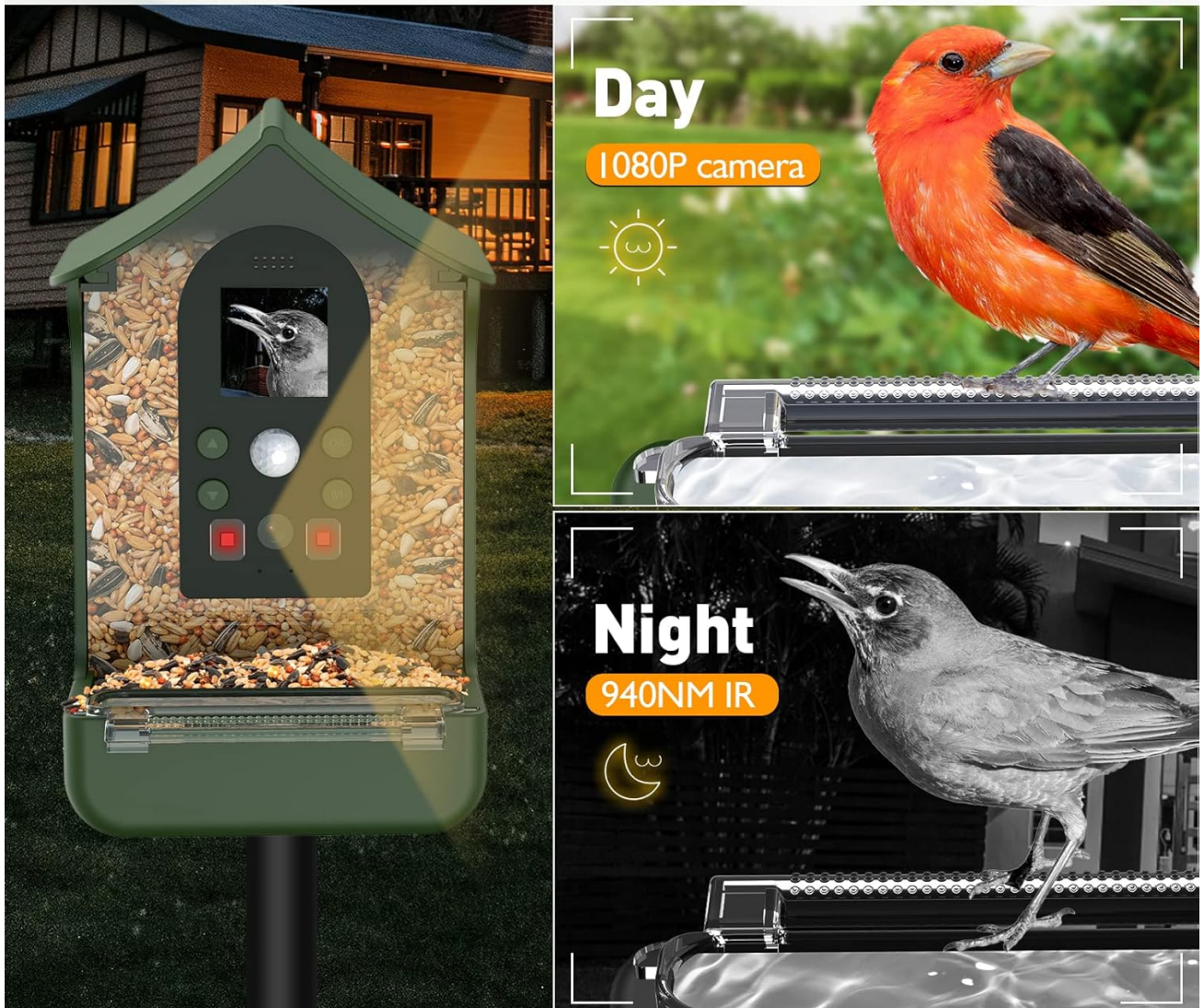
Figure 6: Day and Night vision capabilities.

940nm IR technology allows you to see day and night images of birds inside the memory card