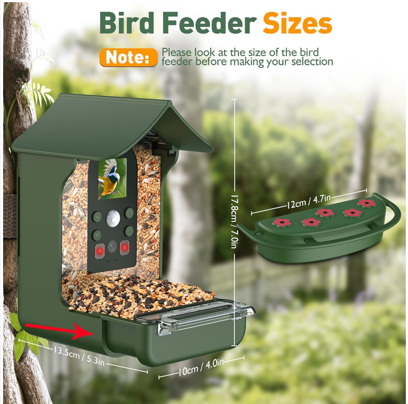
Figure 10: Product dimensions.

Note: Please look at the size of the bird feeder before making your selection