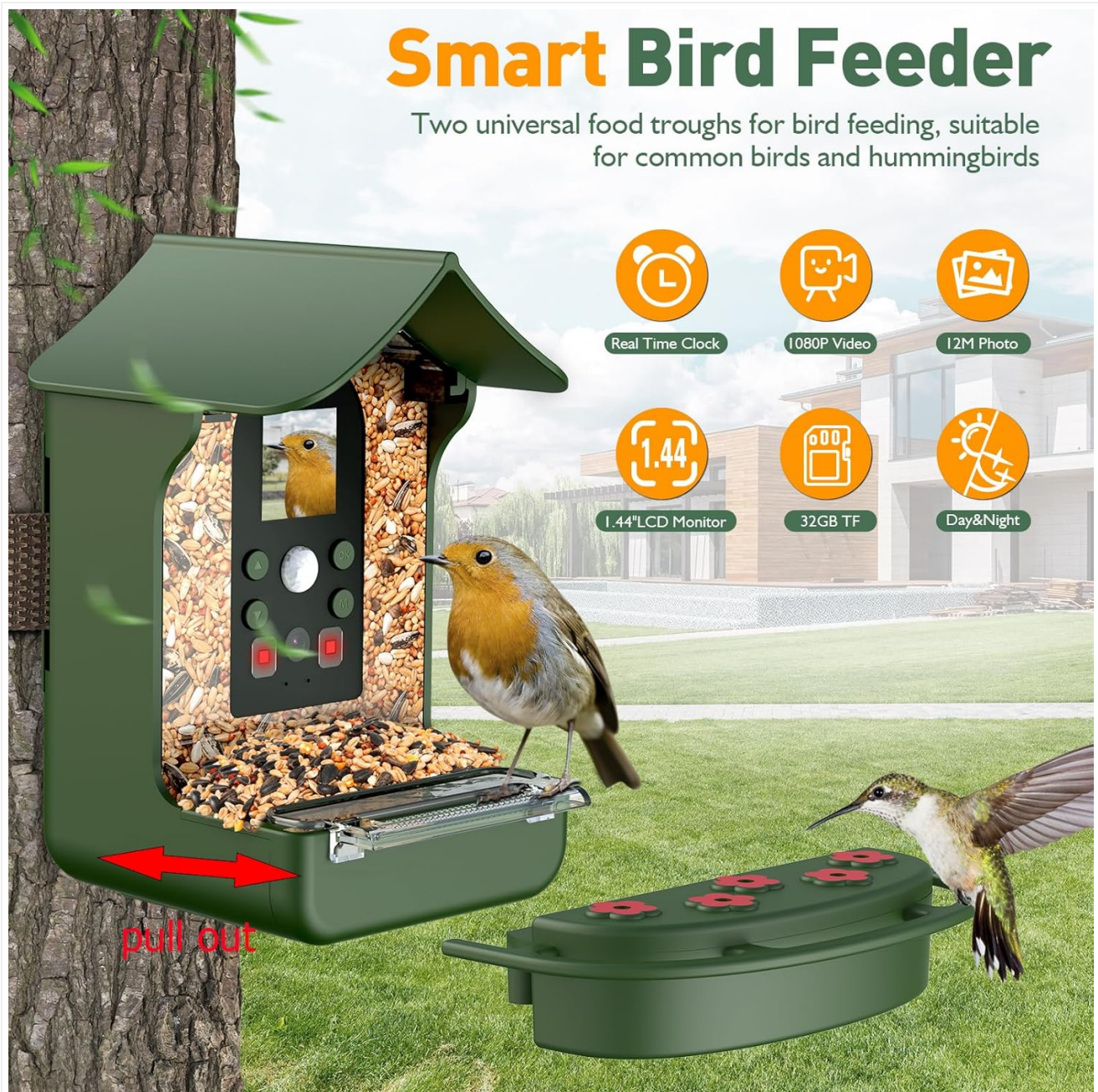
Figure 3: Bird feeder camera installed on a tree, showcasing its main features.

Video 1: Demonstrates two types of installation methods for the bird feeder camera: using straps to attach to a tree and using brackets for a more rigid mount.