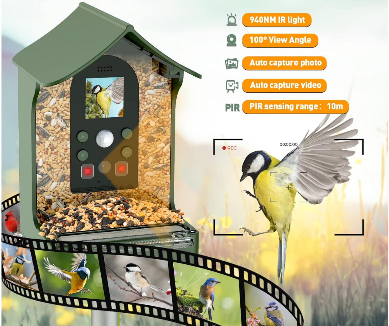
Figure 5: PIR Motion Detection capabilities.

Photos/videos taken automatically will be stored on the memory card