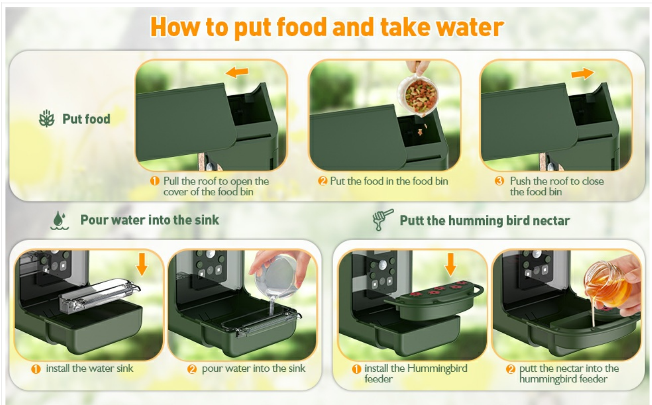
Figure 4: Instructions for filling the bird feeder with food, water, and hummingbird nectar.