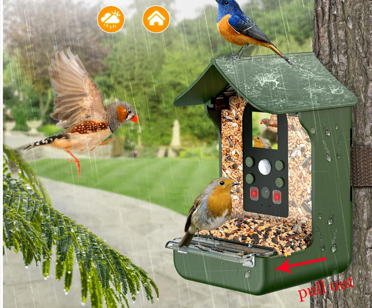
Figure 9: IP65 Waterproof Design for outdoor use.

Use this bird feeder outdoors to protect bird food even when it's raining, so birds can feed at any time