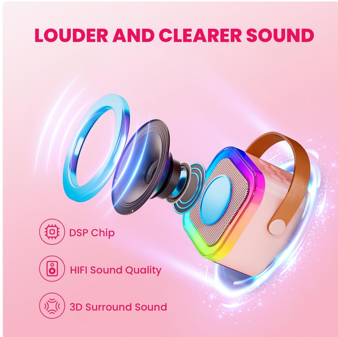
Image: An exploded view diagram illustrating the internal audio components of the karaoke machine, emphasizing its DSP chip, HiFi sound quality, and 3D surround sound capabilities.

The IROO Mini Karaoke Machine is a compact and portable audio system designed for entertainment. It features a main speaker unit with integrated controls and colorful LED lights, along with two wireless microphones for duet singing.