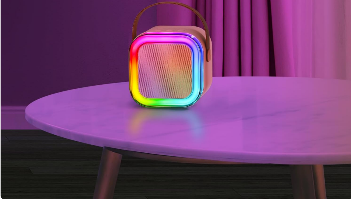
Image: The IROO Mini Karaoke Machine illuminated with vibrant, dancing LED lights, creating a colorful atmosphere in a room.

Controllable Dancing Lights ON/OFF Freely