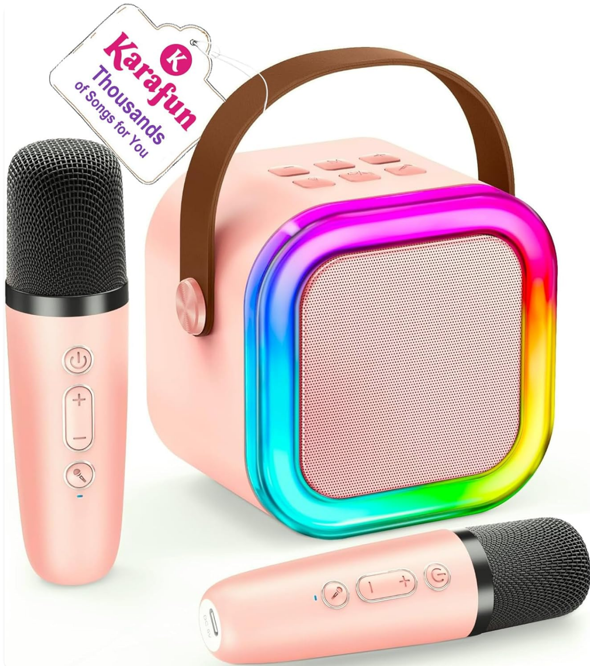
Image: The IROO Mini Karaoke Machine in pink, accompanied by two matching wireless microphones. A tag indicating "Karafun Thousands of Songs for You" is attached to the machine's handle.