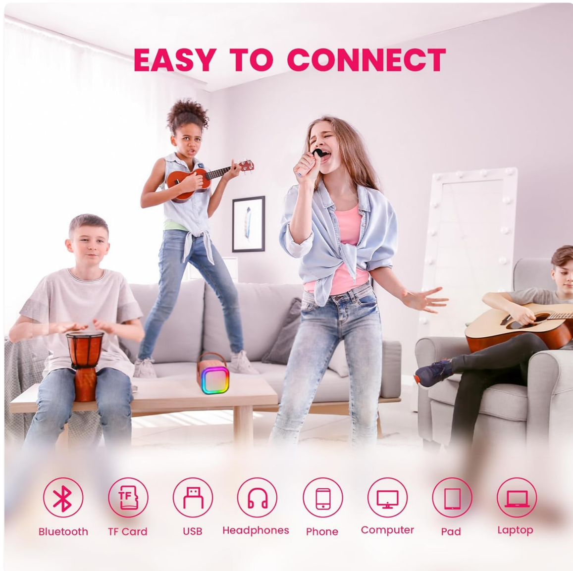
Image: A group of children enjoying the karaoke machine, illustrating its versatility with multiple connection options such as Bluetooth, TF Card, USB, and compatibility with phones, computers, pads, and laptops.