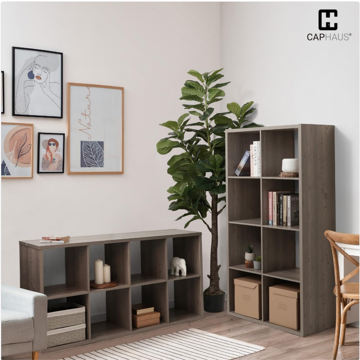
The CAPHAUS 8-Cube Storage Organizer Shelf used in a child's play area, storing toys and books.