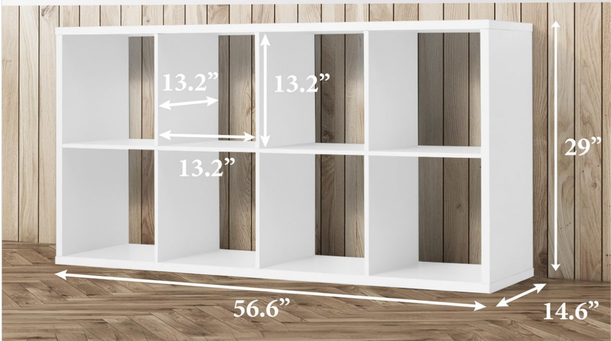
Detailed diagram showing the dimensions of the CAPHAUS 8-Cube Storage Organizer Shelf, including overall width, depth, height, and individual cube dimensions.