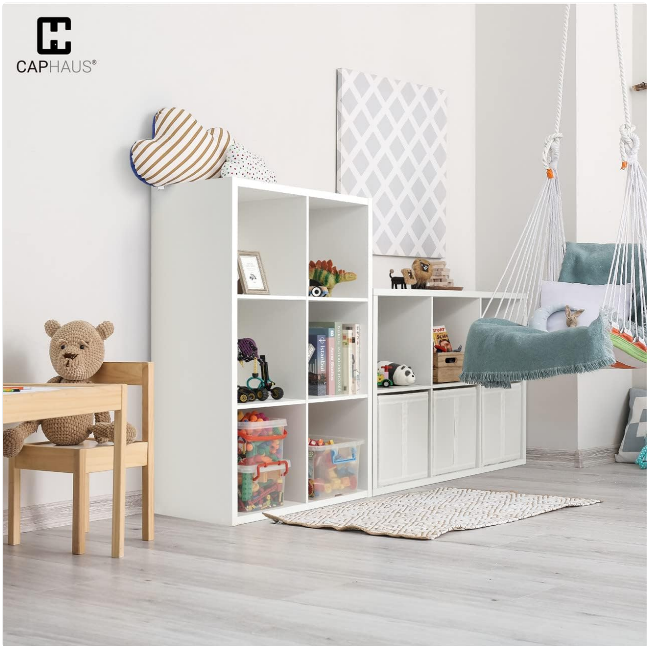
The CAPHAUS 8-Cube Storage Organizer Shelf filled with books and decorative items, demonstrating its storage capacity.

The unit can also serve as a room divider in larger spaces, creating distinct functional areas.