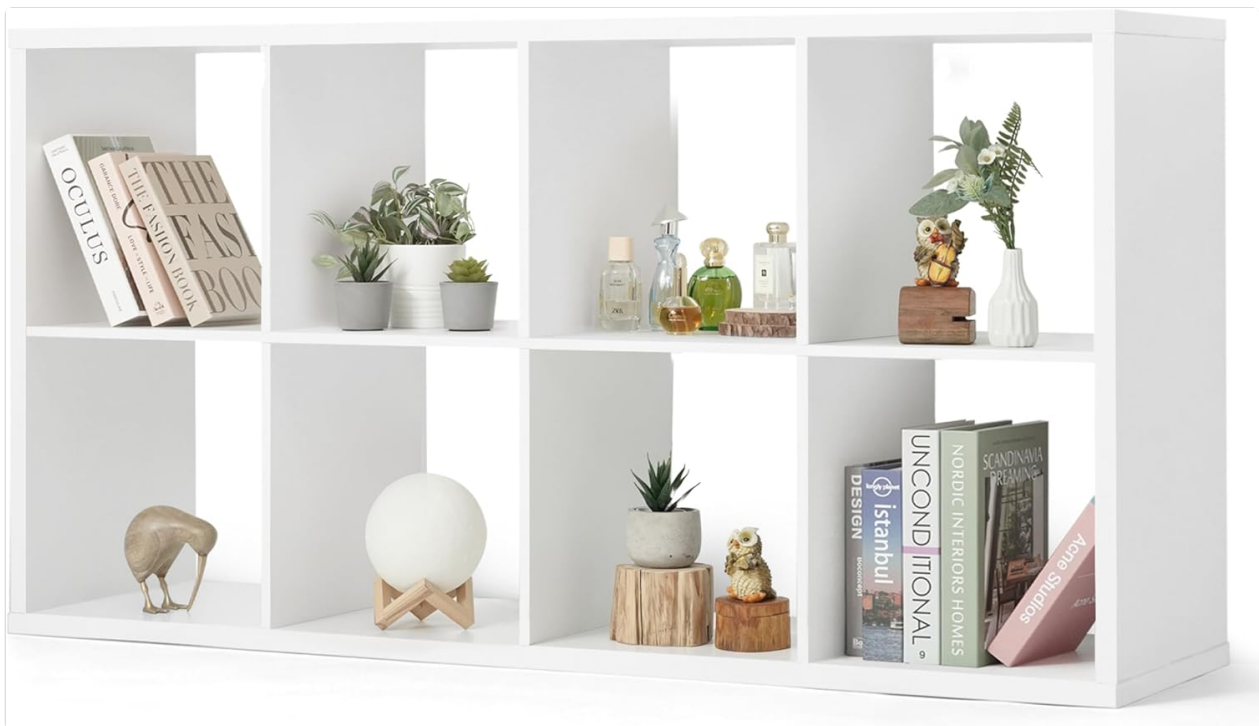
The CAPHAUS 8-Cube Storage Organizer Shelf in a living room setting, showcasing its versatile use.