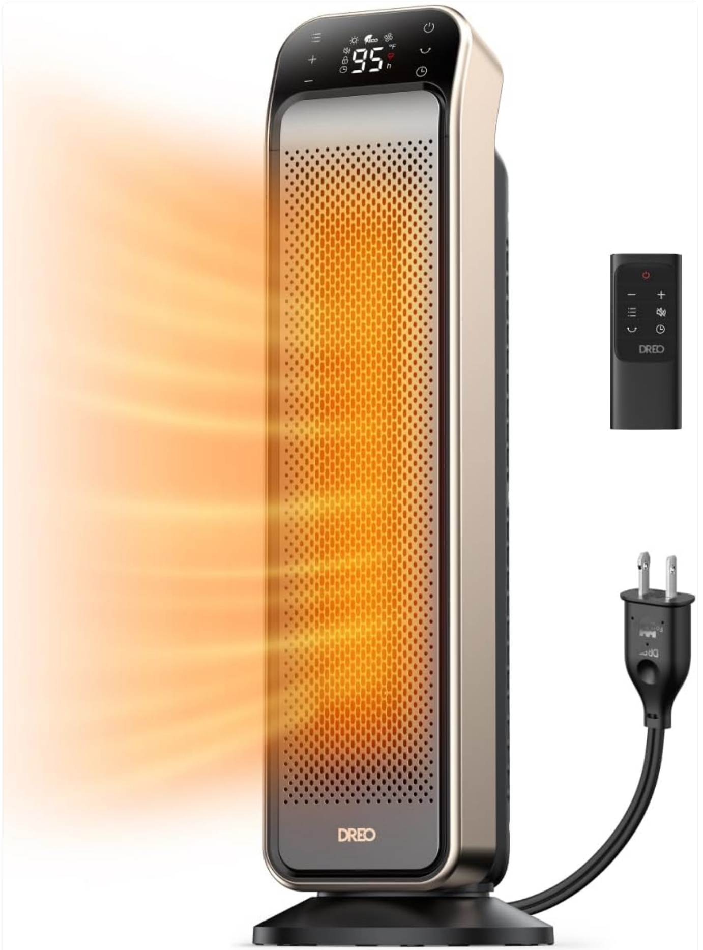
The Dreo Space Heater, showcasing its sleek design, remote control, and anti-burn plug. Heat is visibly emitted from the front grille.

The heater can be operated using the touch control panel on the unit or the included remote control. Ensure the remote control has a working battery (1 Lithium Metal battery included).