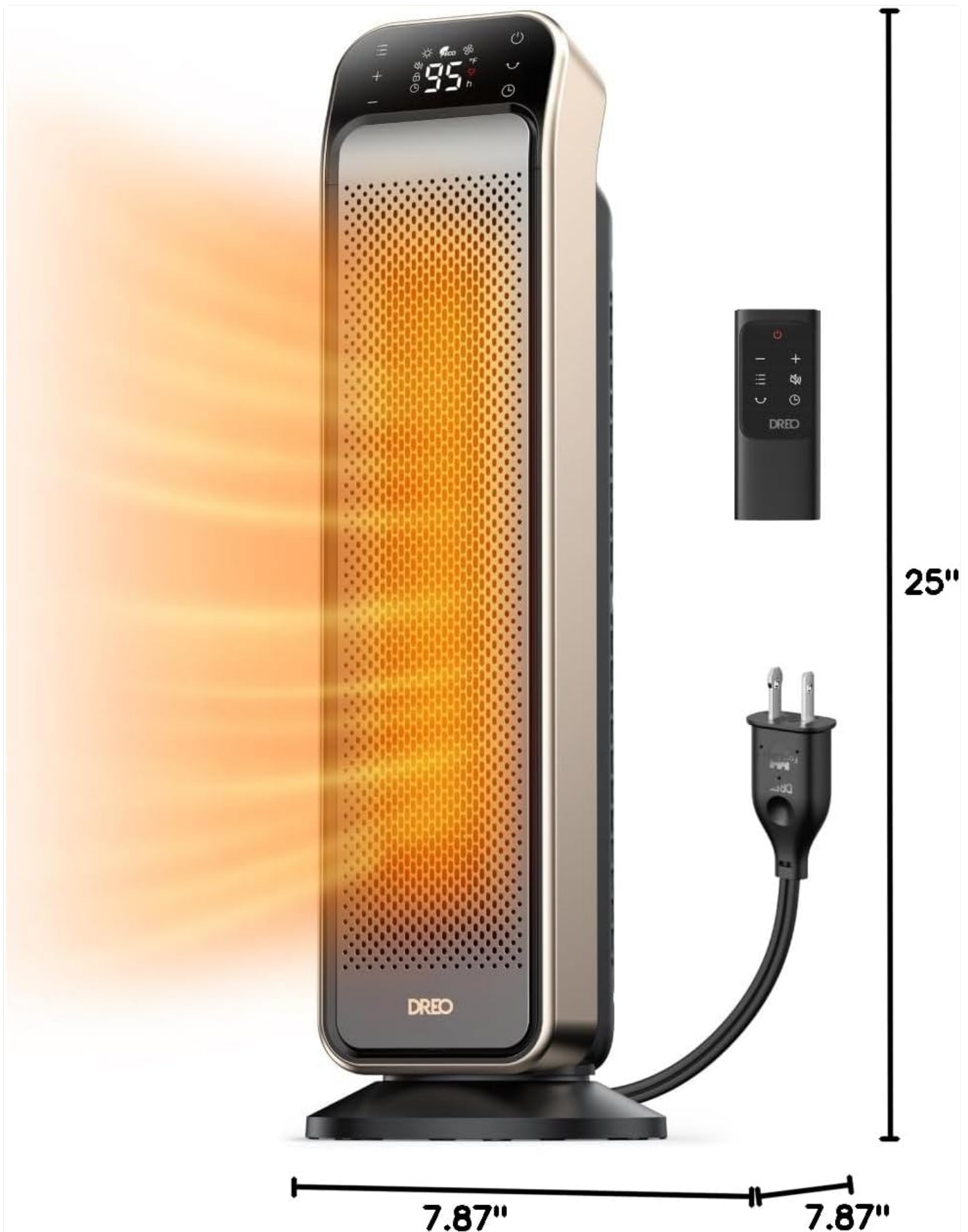
Diagram showing the physical dimensions of the Dreco Space Heater, measuring 25 inches in height and 7.87 inches in both depth and width.