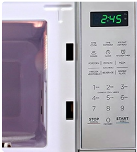
Figure 8: Product dimensions for the Total Chef 0.7 Cu Ft Microwave Oven.