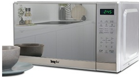
Figure 4: Pre-set function icons.