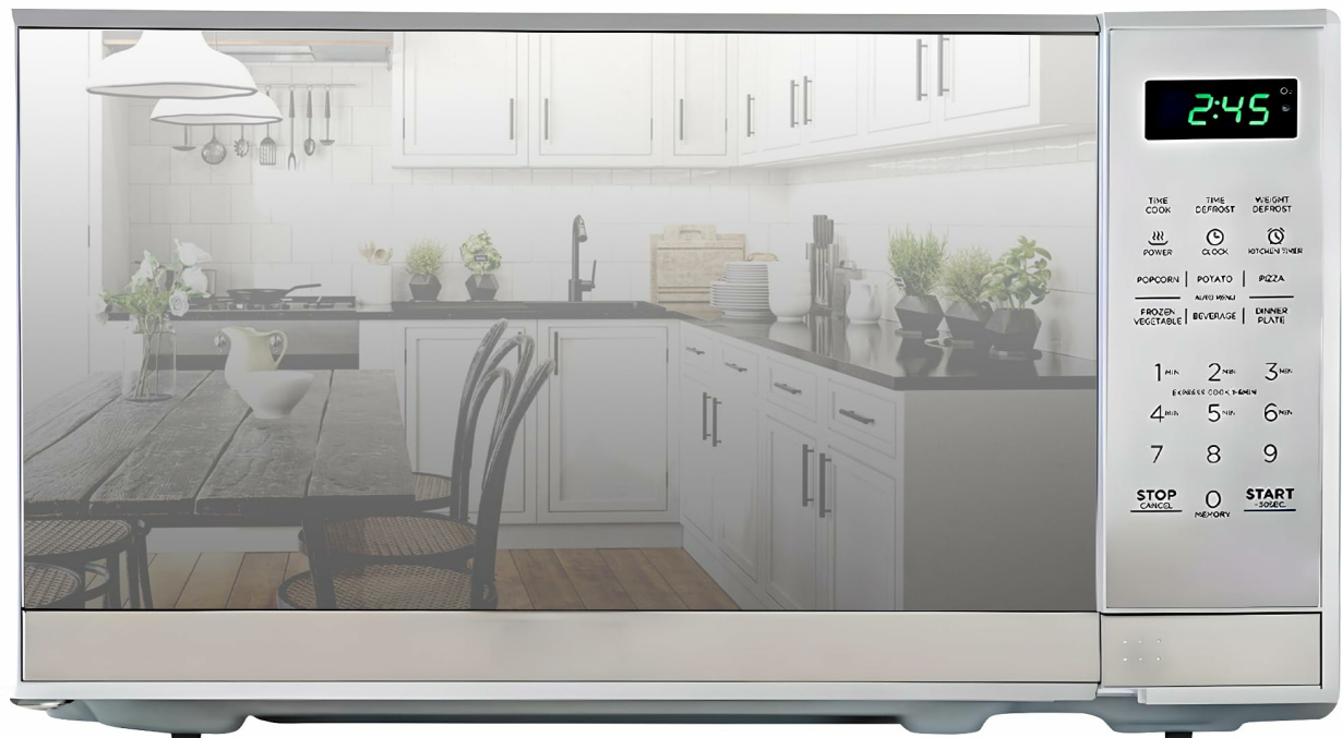
Figure 1: Total Chef 0.7 Cu Ft Microwave Oven on a kitchen countertop.