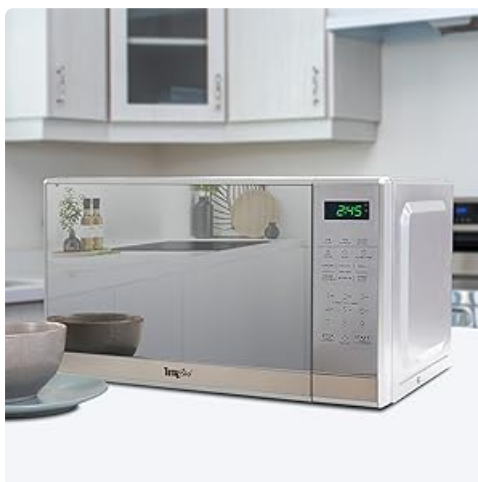
Figure 7: Easy-to-clean interior and removable turntable.

Regularly clean the interior of the microwave with a mild detergent and a soft cloth. Avoid abrasive cleaners or scouring pads. The glass turntable and roller ring are removable and dishwasher-safe for easy cleaning.