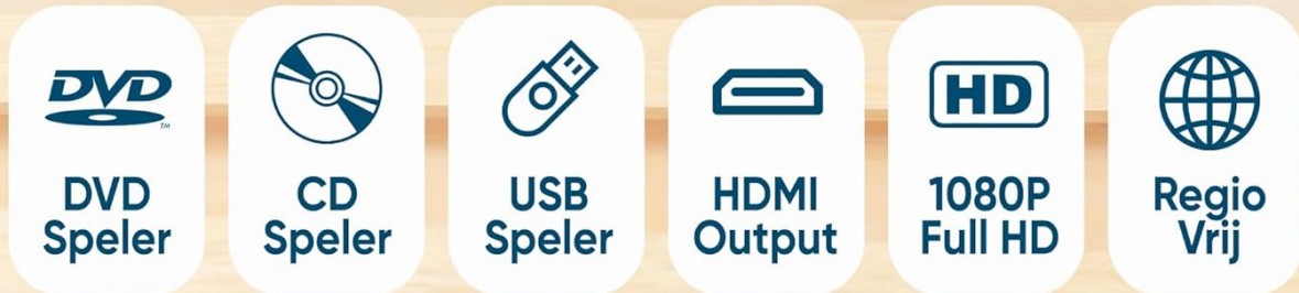
Figure 2.2: Overview of the Strex SP270's capabilities, including DVD, CD, and USB playback, HDMI output, 1080P Full HD support, and region-free functionality.