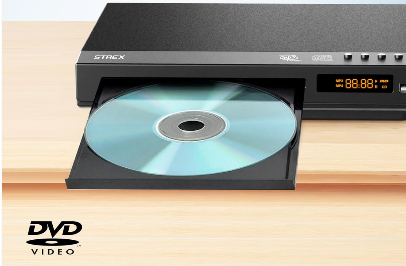
Figure 5.1: Inserting a disc into the Strex SP270 DVD Player's disc tray.