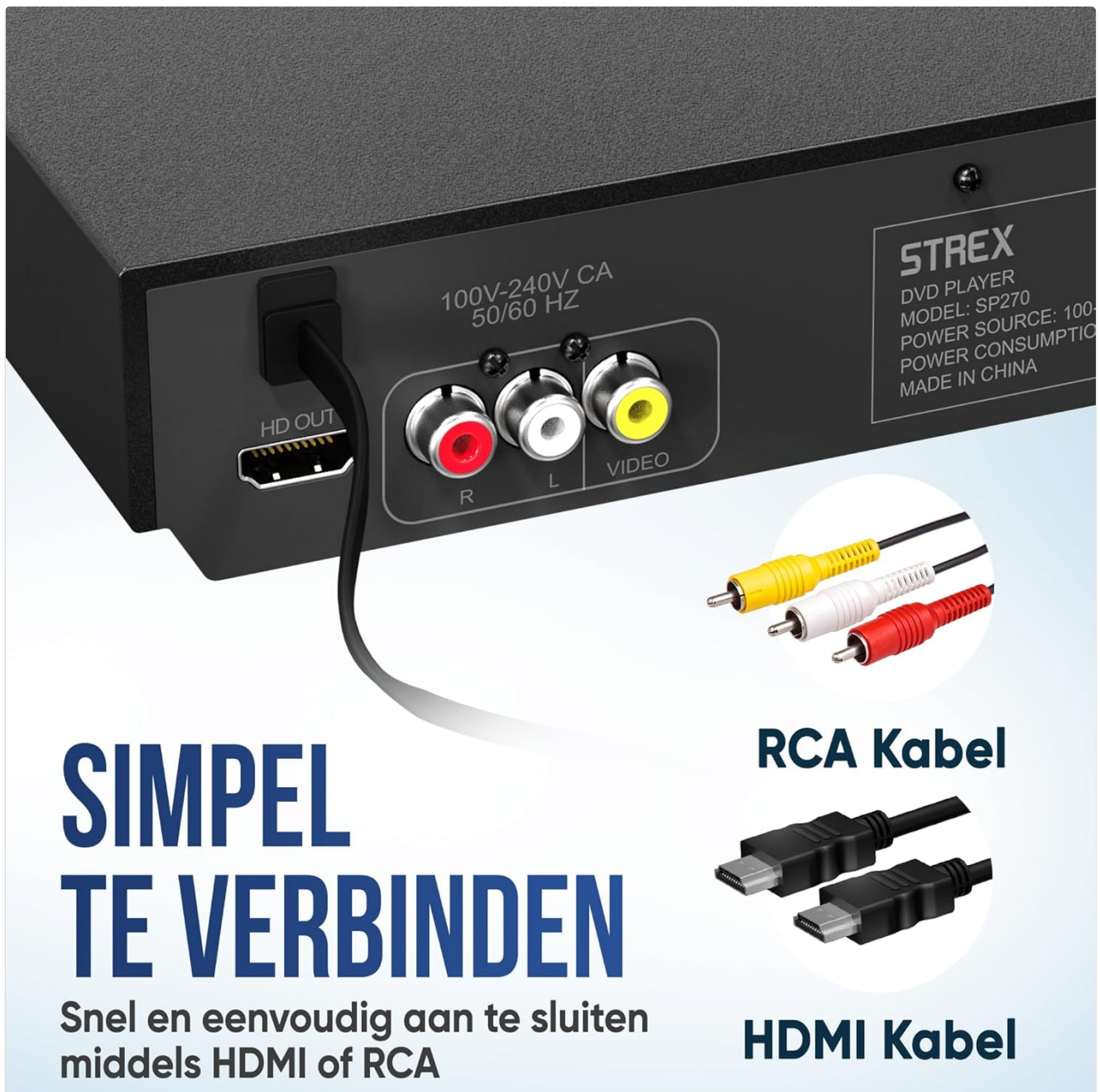
Figure 4.1: Rear view of the Strex SP270 DVD Player, illustrating the HDMI and RCA connection points and their respective cables.