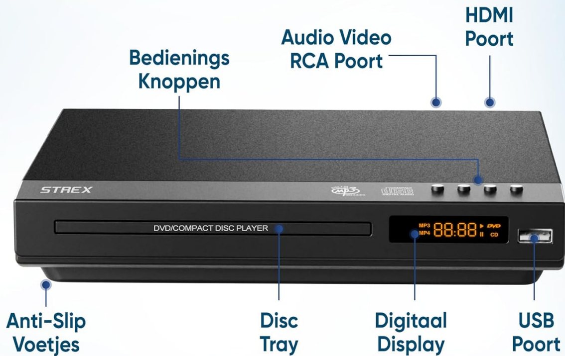
Figure 2.3: Front and side view of the Strex SP270 DVD Player, highlighting its various components and ports for easy identification.