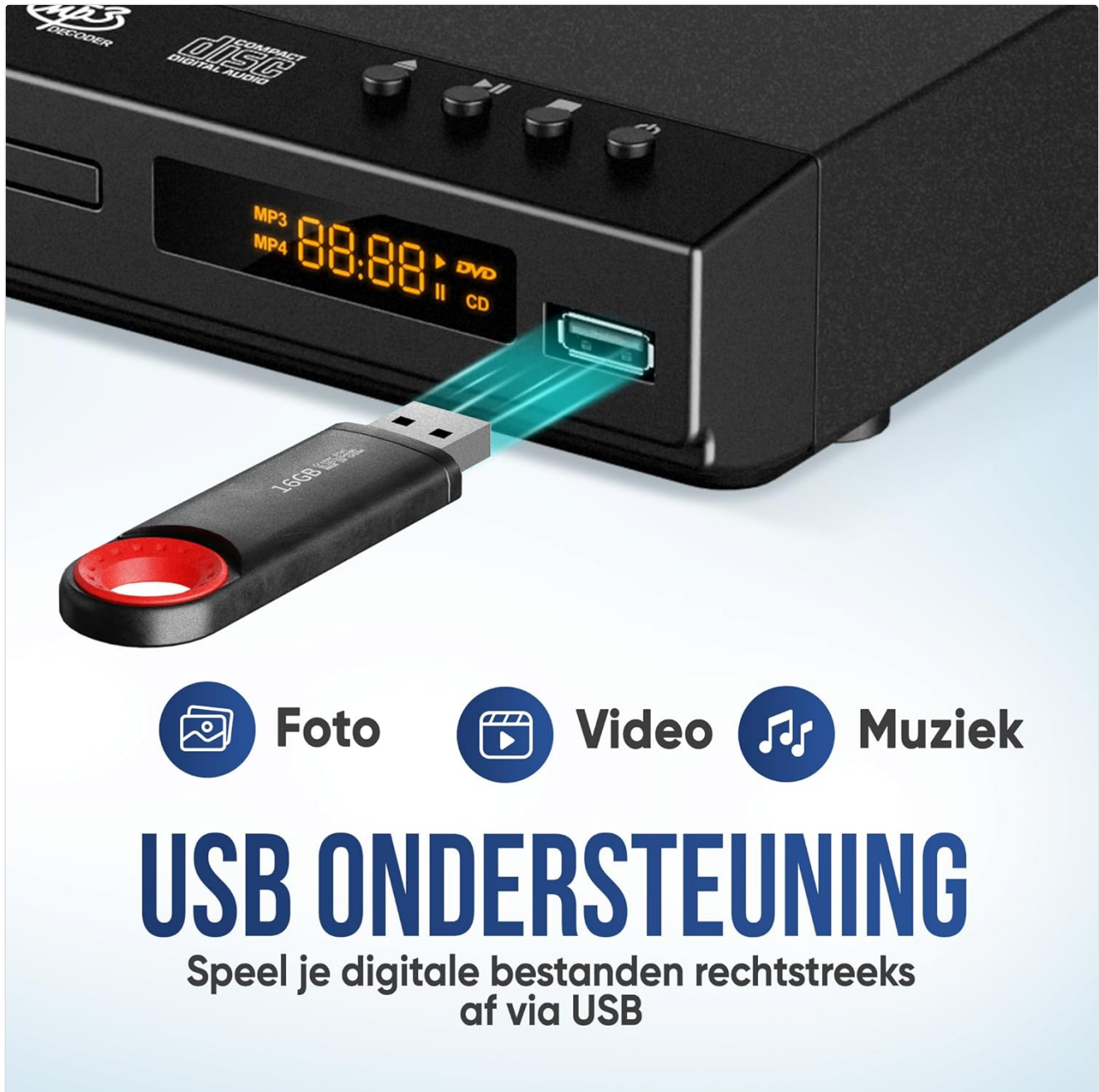
Figure 5.2: The USB port on the Strex SP270 DVD Player, ready for a USB flash drive.

Note: The USB port supports flash drives up to 128GB. Ensure your USB drive is formatted to a compatible file system (e.g., FAT32).