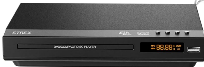
● DVD Speler