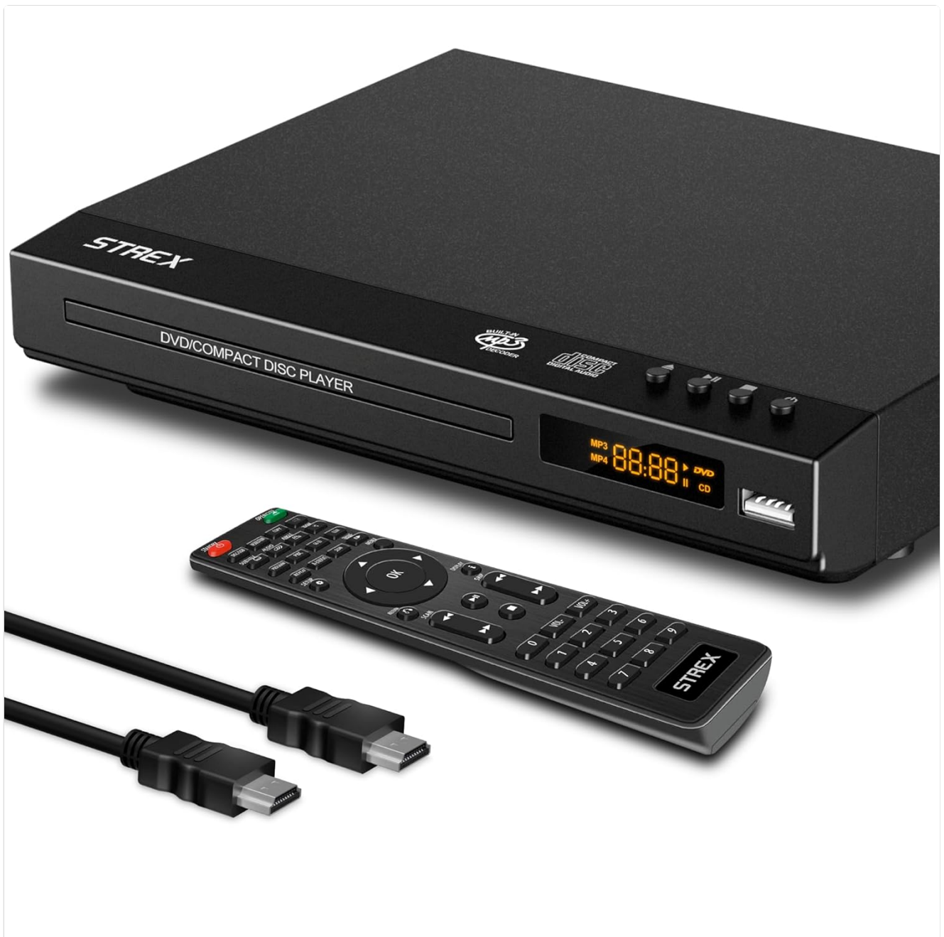
Figure 2.1: The Strex SP270 DVD Player, showing the unit, included remote control, and HDMI cables.