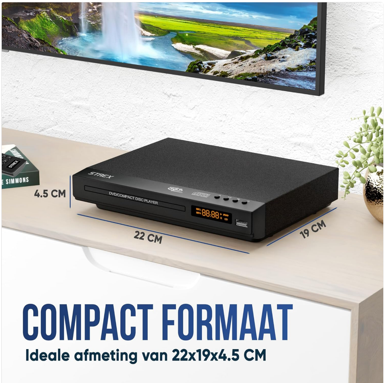
Figure 9.1: Dimensions of the Strex SP270 DVD Player.