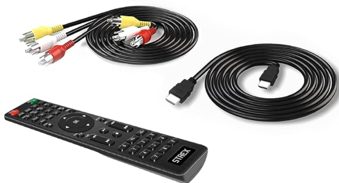
● Afstandsbediening, HDMI/RCA kabel ● Handleiding