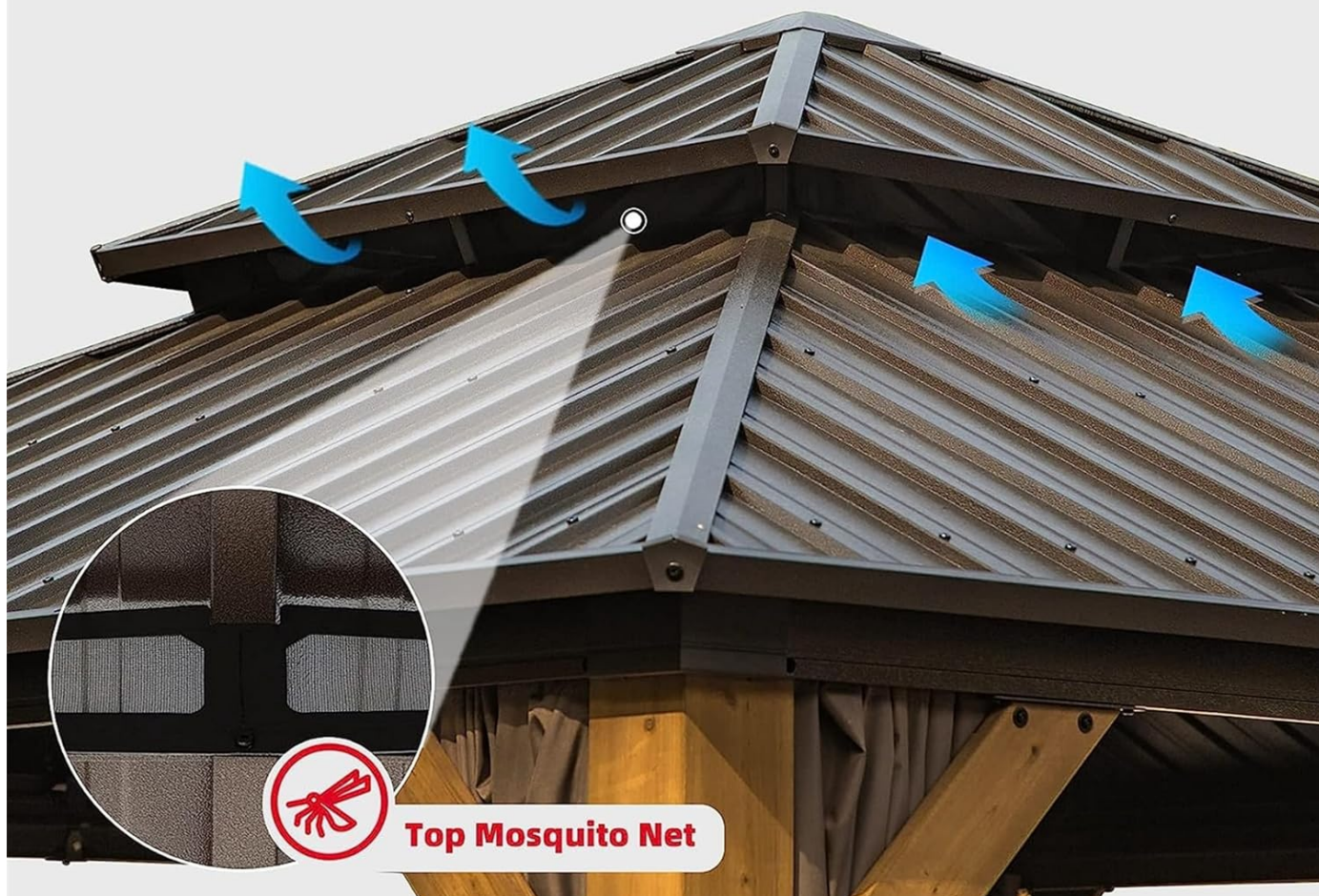
Figure 1: Hardtop Double Roof Design with ventilation features and mosquito net detail.

Tight Solid Structure Provide comfortable space