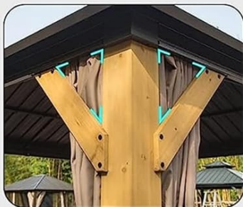
Strong Tripod Structure