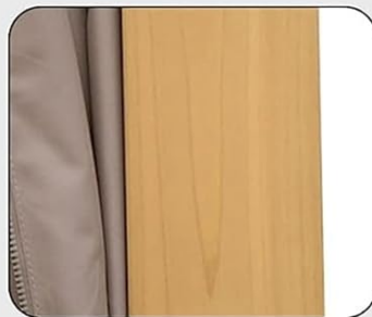
Premium Spruce Wood