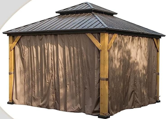
Figure 3: Gazebo with inner netting and outer privacy curtains.