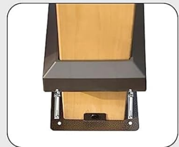
Anchoring Panels with Cover