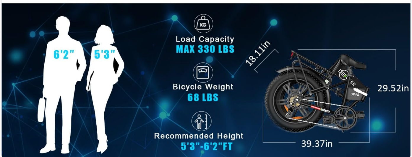
Figure 7: Product Dimensions and Rider Specifications