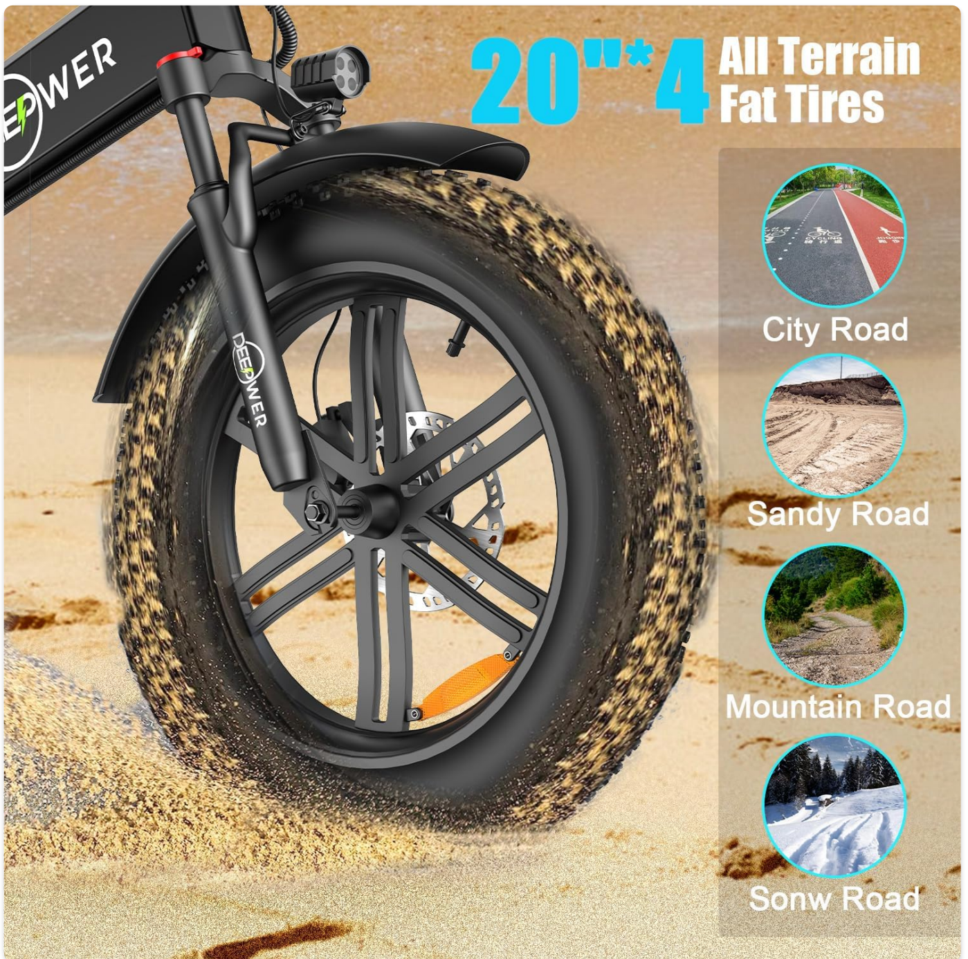
Figure 6: 20" x 4 All Terrain Fat Tires