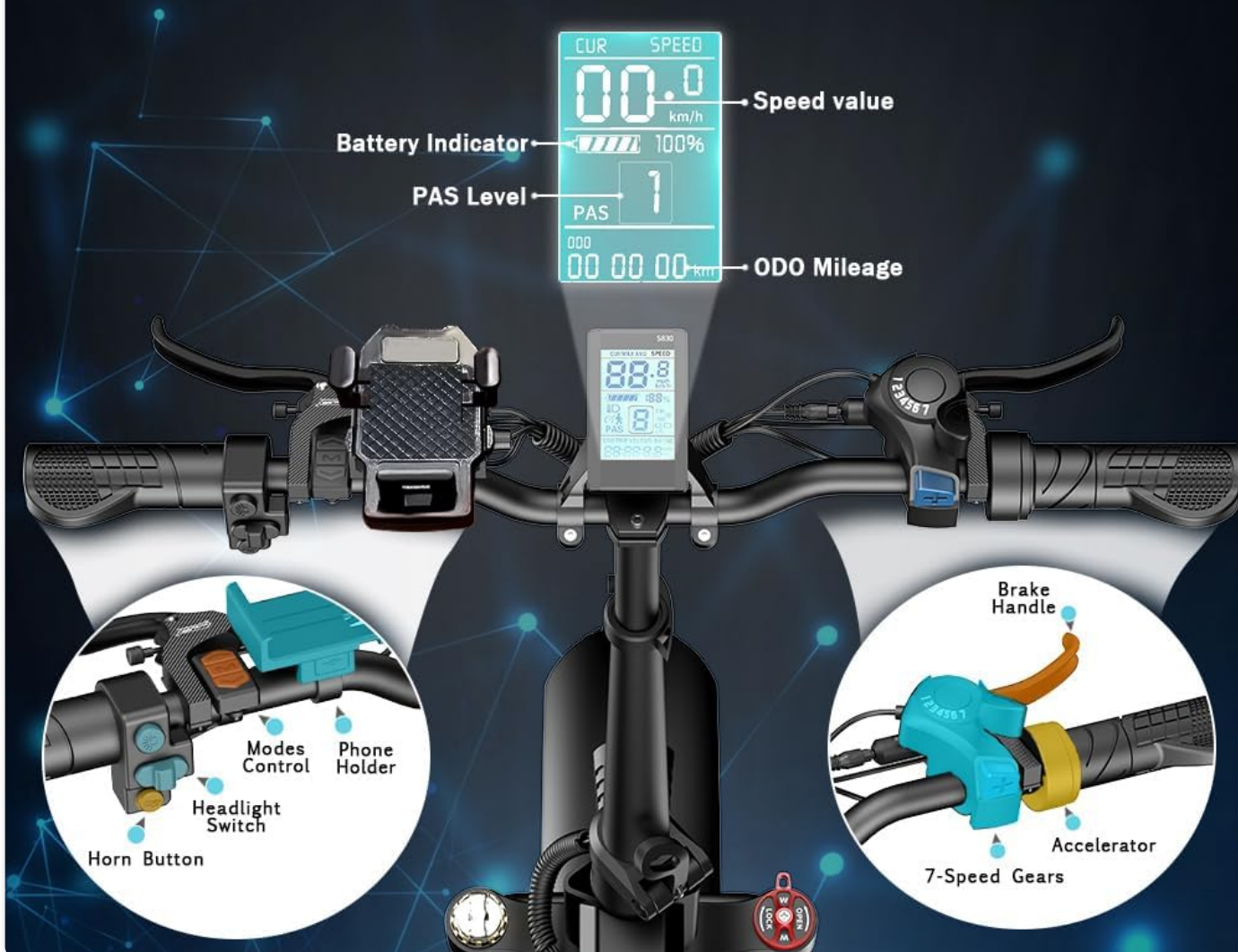
Figure 5: Digital LCD Display