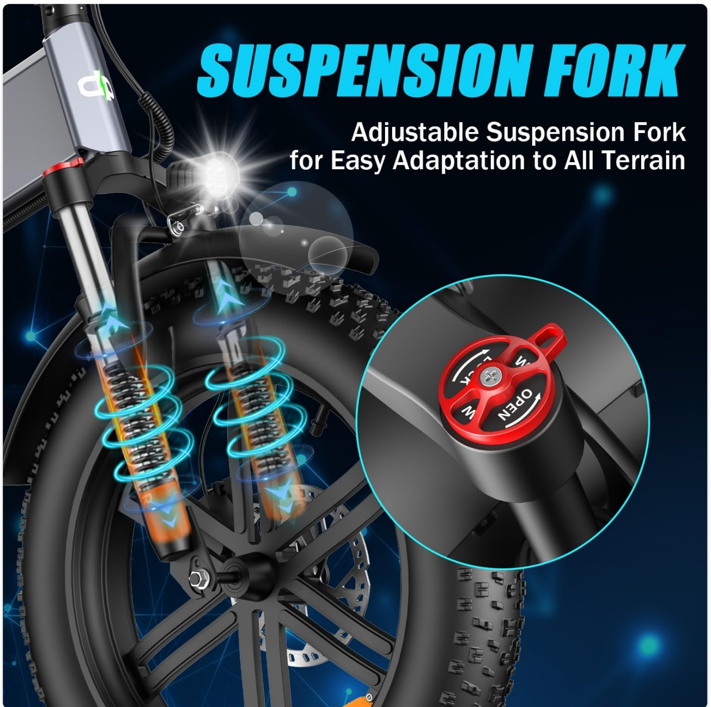
Figure 2: Front Suspension Fork