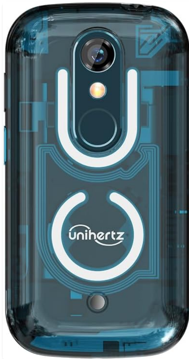
Figure 3.5: Back view of the device with LED lights.