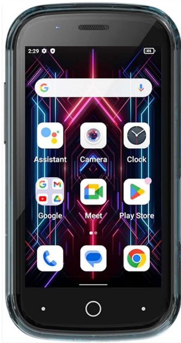
Figure 3.4: Front view of the device displaying the home screen.