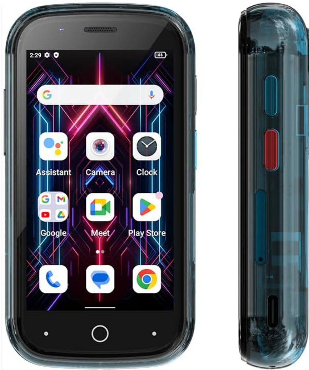
Figure 3.2: Front and side view of the device.