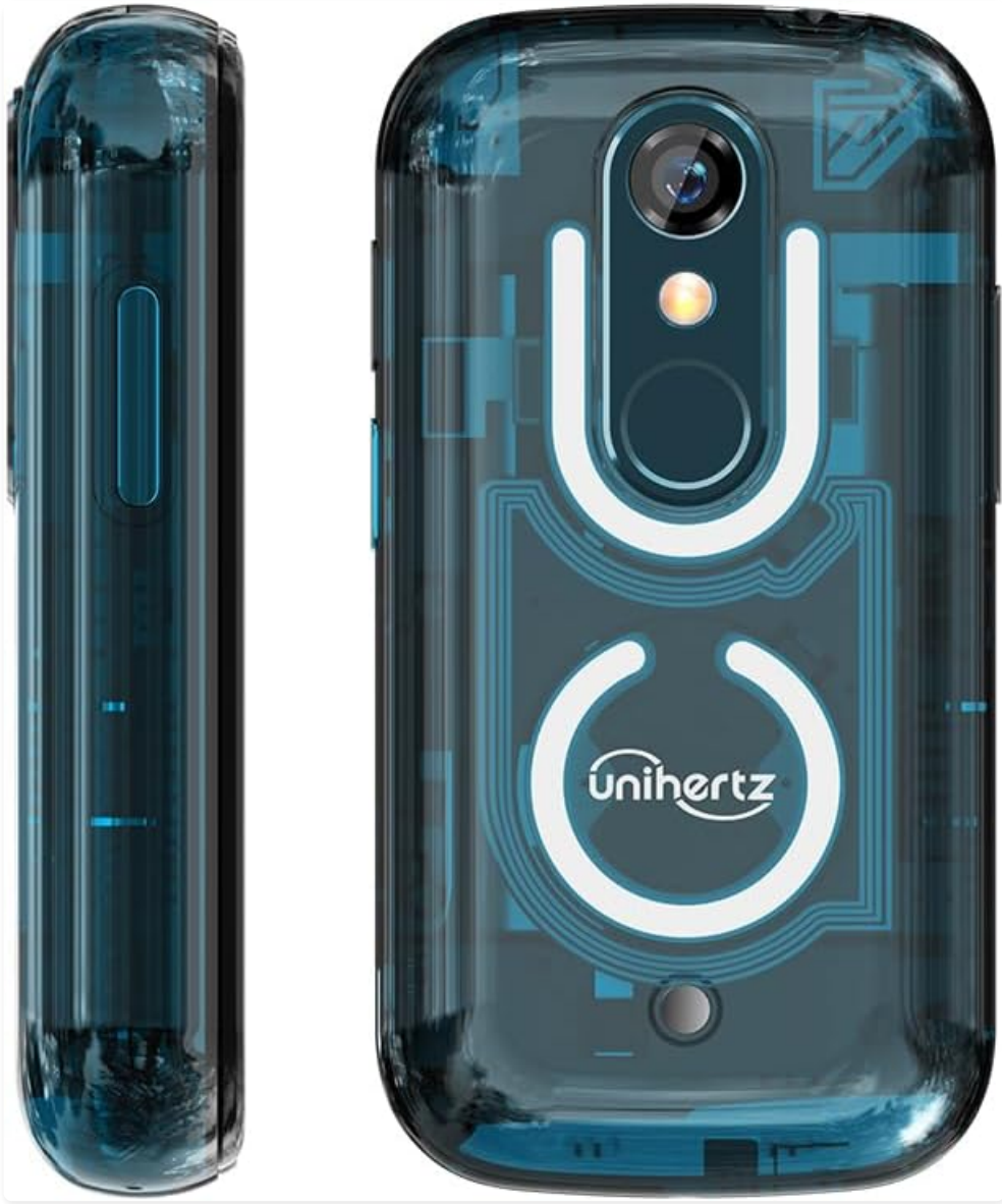
Figure 3.3: Side and back view of the device.