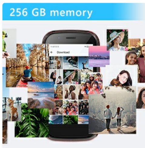
Figure 5.2: Explore more features of the Jelly Star.