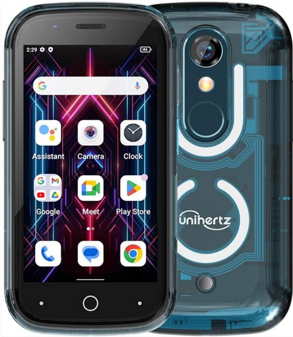
Figure 3.1: Front and back view of the Unihertz Jelly Star.