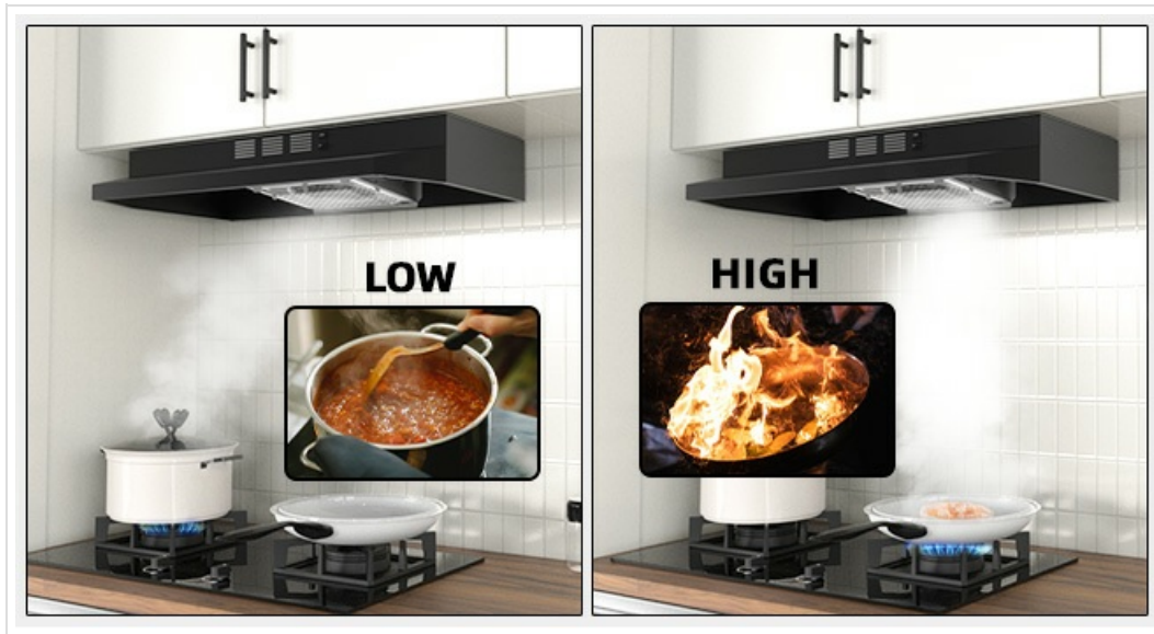
Figure 5.2: Visual comparison of the range hood's performance at low and high fan speeds, effectively clearing smoke and odors.