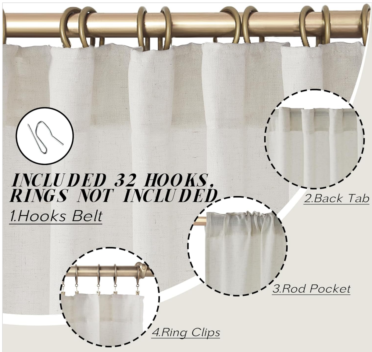
Figure 1: Illustration of the four available curtain hanging methods.