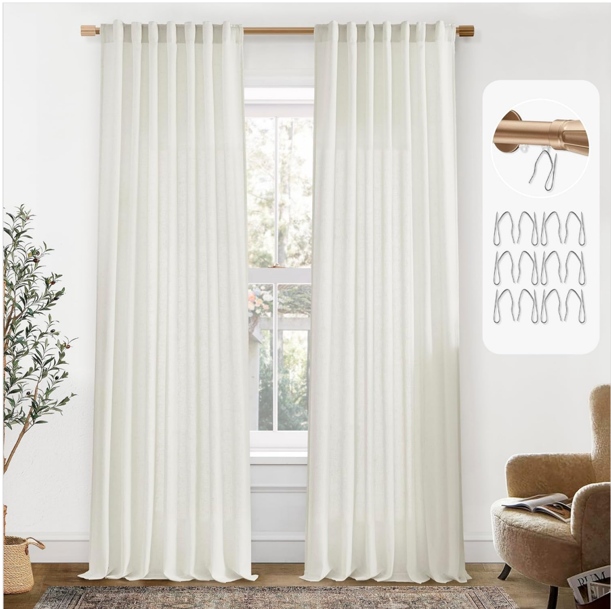
Figure 2: Curtains demonstrating the back tab hanging style and the included hooks.