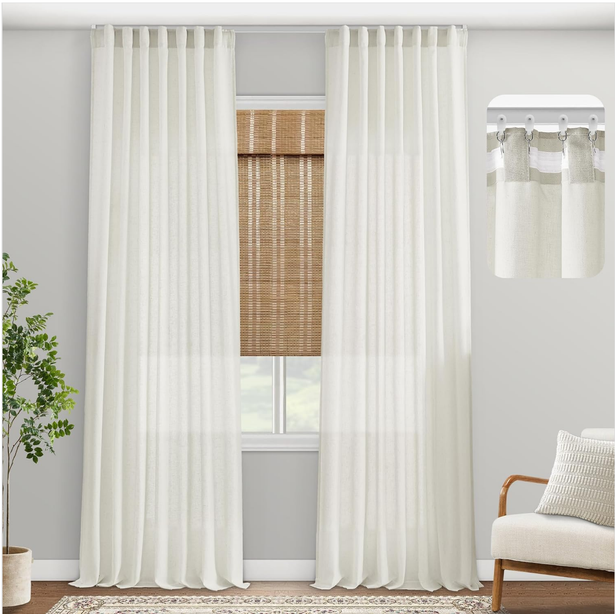
Figure 4: PANELSBURG curtains providing light filtering and privacy in a room setting.