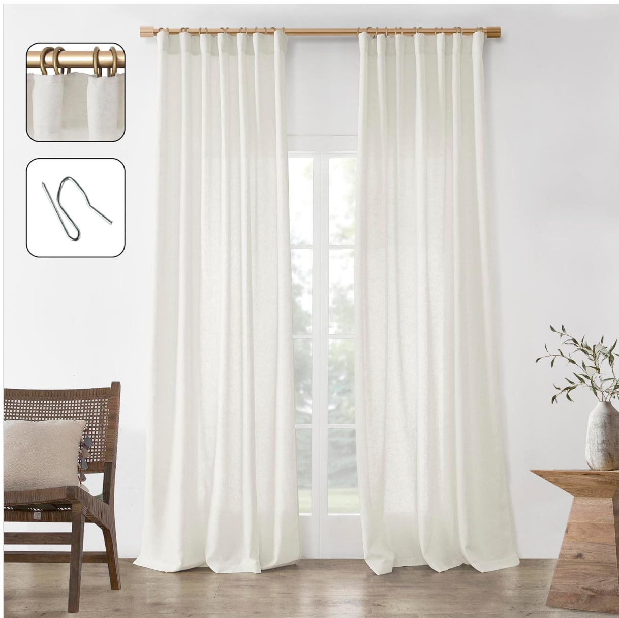
Figure 3: Curtains hung using hooks and rings for a pleated look.