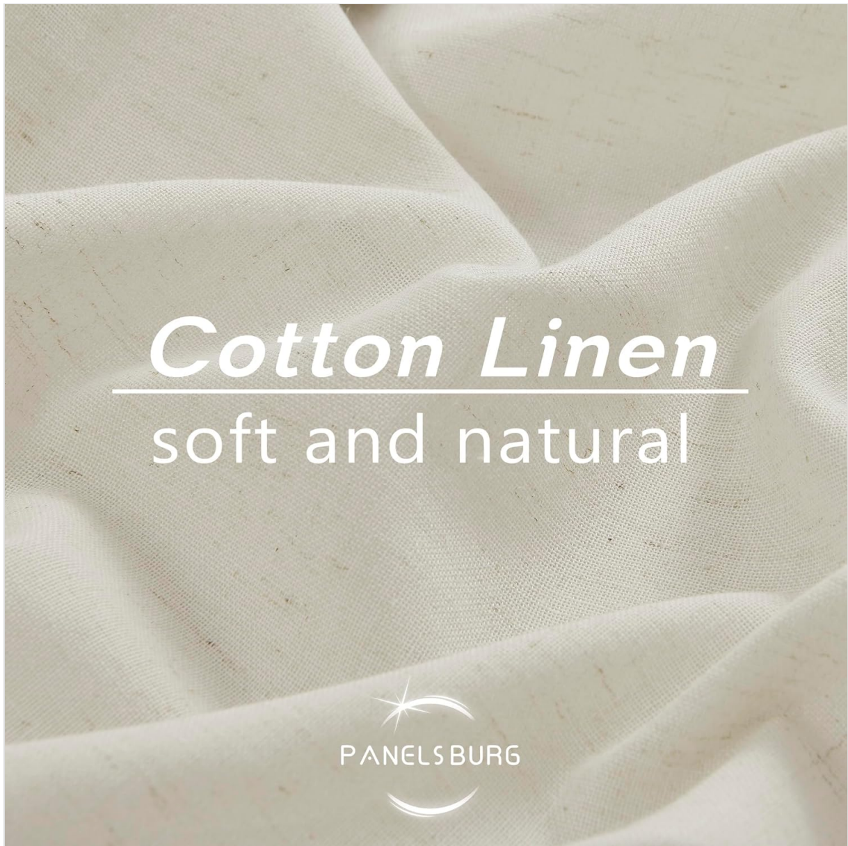
Figure 5: The soft and natural texture of the cotton linen blend fabric.