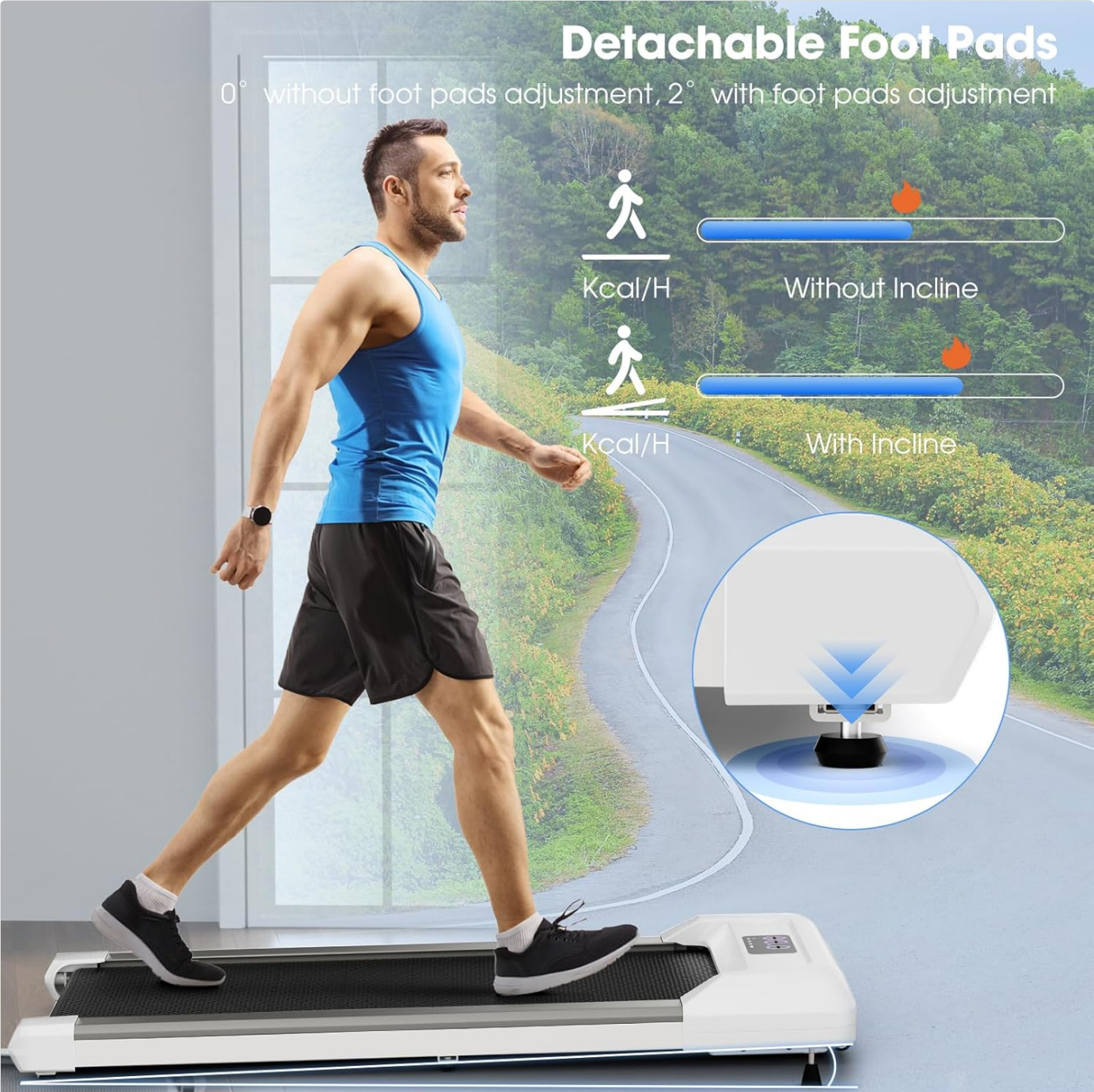
Image 4.1: Treadmill in use under a standing desk, illustrating typical setup.