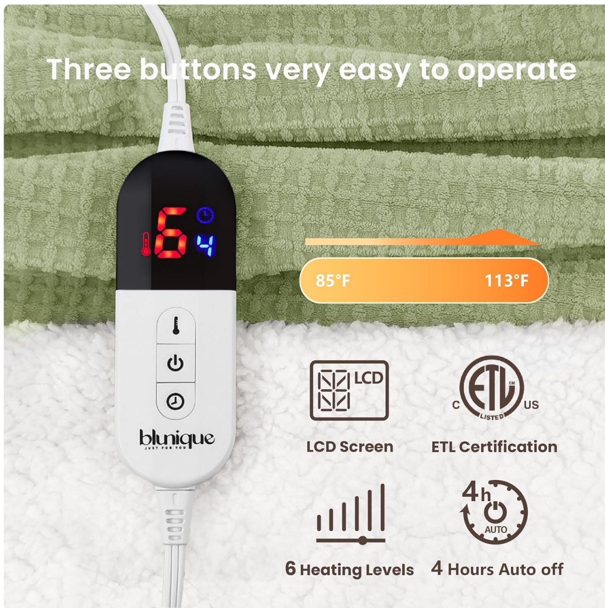
Image: Digital display controller for the blunique heated blanket, showing 6 heating levels and 4-hour auto-off feature.