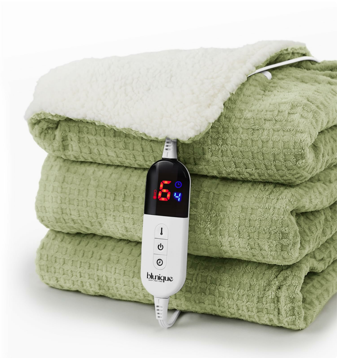
Image: blunique Waffle Heated Blanket in Sage color, draped over a sofa with the controller visible.