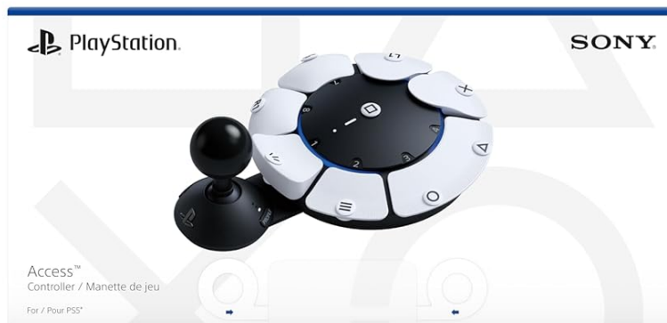
Image: The main view of the PlayStation Access Controller, showing its circular design with multiple large, customizable buttons and an attached joystick.