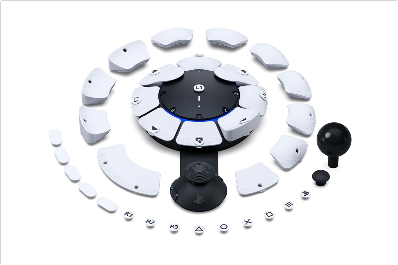
Image: A top-down view of the PlayStation Access Controller with its modular button and stick caps arranged around it, showcasing the customization options.