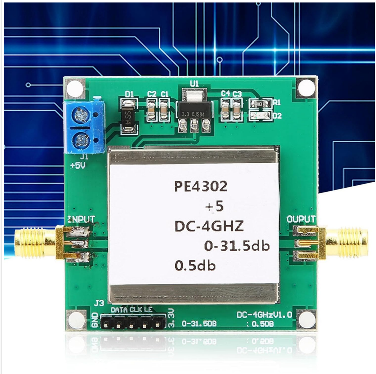
Figure 2: Close-up view of the PE4302 module, highlighting the internal DIP switches for control.