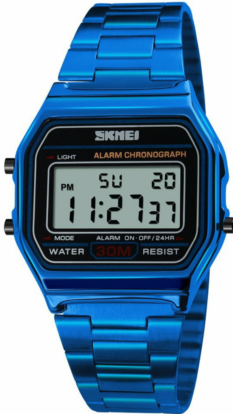
Front view of the SKMEI Vintage Digital Watch, showcasing its grey digital dial and stainless steel band.