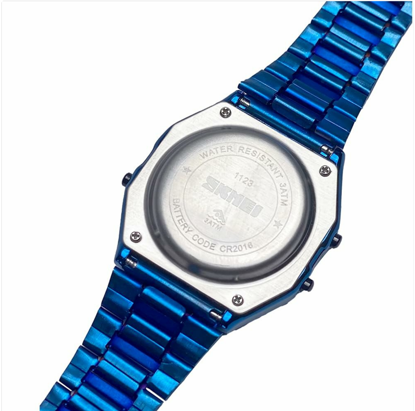
The back of the watch displays the model number (1123) and water resistance rating (3ATM).