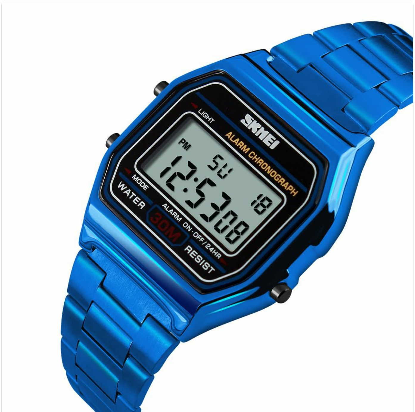
Side view of the watch, highlighting the four control buttons: Light (top left), Mode (bottom left), Start/Stop (top right), and Reset (bottom right).