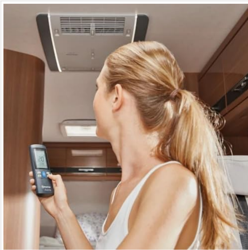
Image: A person comfortably using the Truma Aventa Remote Control to adjust settings for their rooftop air conditioning unit inside a vehicle, demonstrating typical usage.