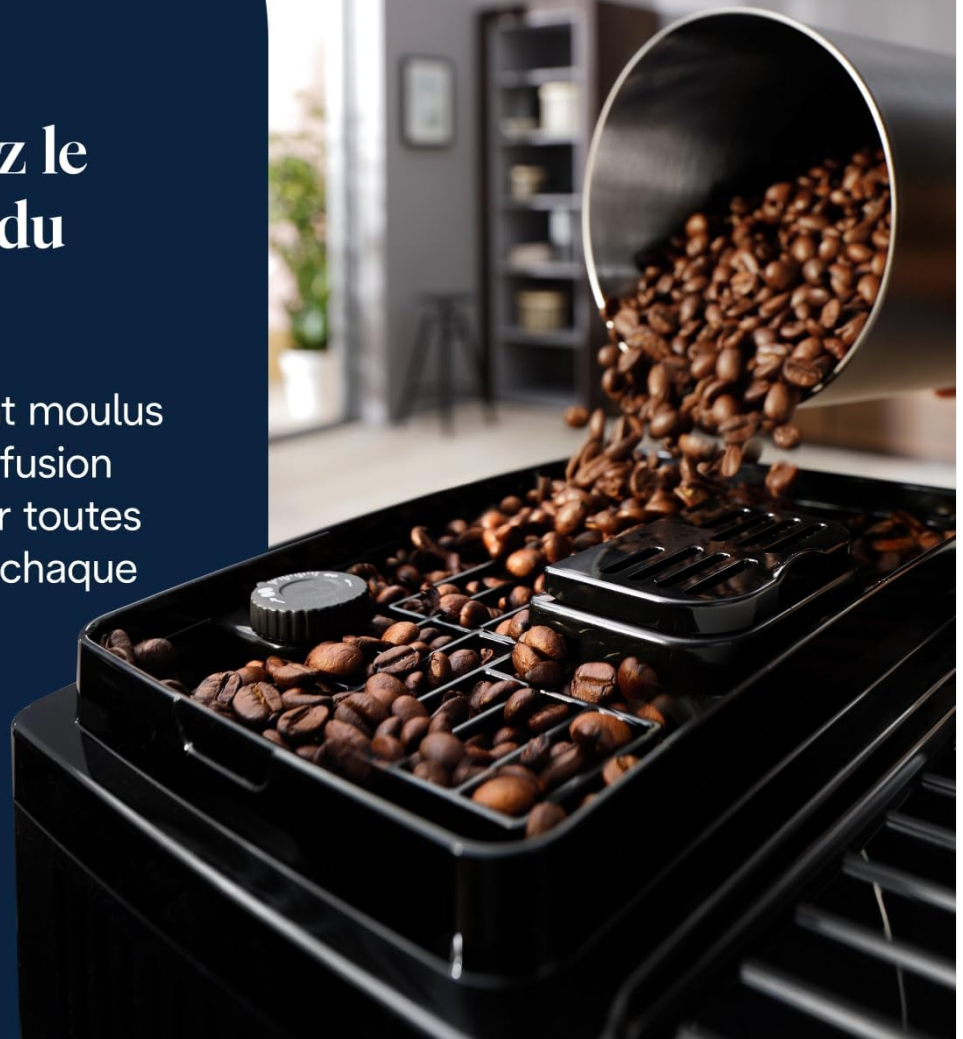
Figure 3: Filling the bean hopper with fresh coffee beans.

Les grains sont moulus juste avant l'infusion pour en libérer toutes les saveurs, à chaque tasse.