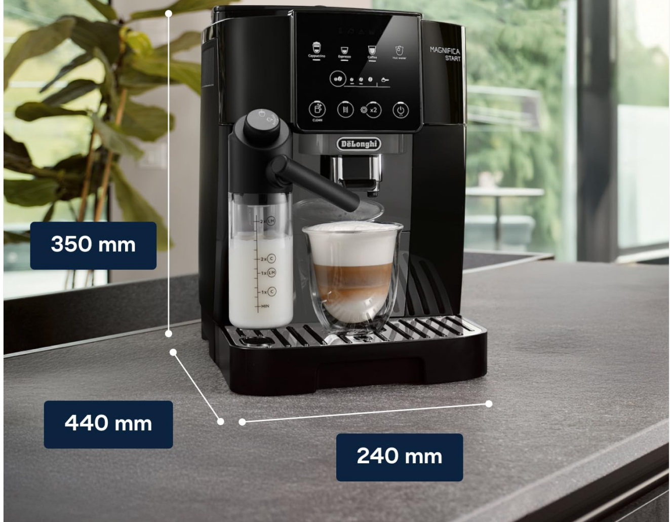
Figure 9: Product dimensions for placement reference.