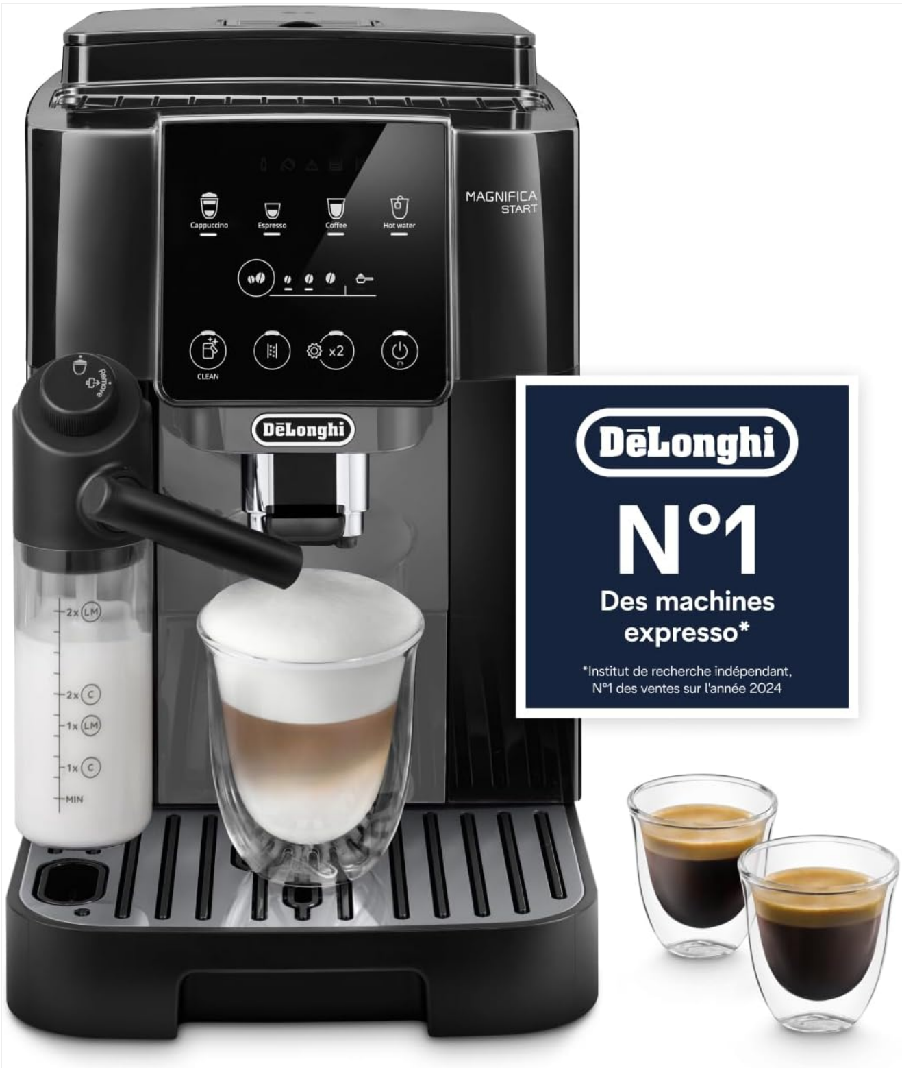
Figure 1: De'Longhi Magnifica Start ECAM222.60.BG Automatic Coffee Machine with two cups of espresso and a latte.