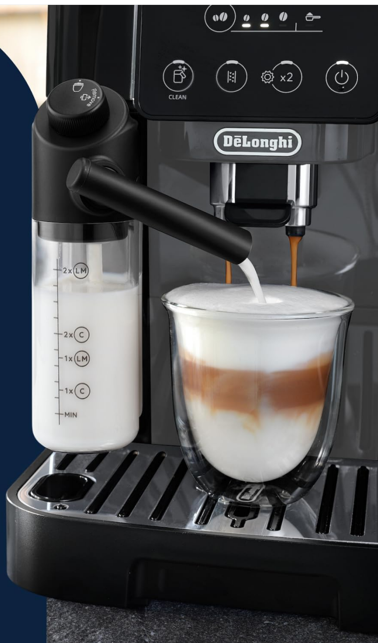
Figure 7: Automatic milk frothing using the LatteCrema system.

Ajoutez une mousse de lait soyeuse à vos boissons grâce à la technologie LatteCrema Hot.