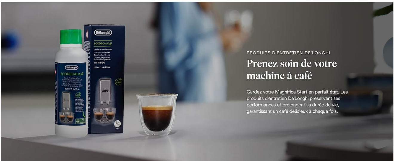
Figure 8: De'Longhi descaling solution for machine maintenance.