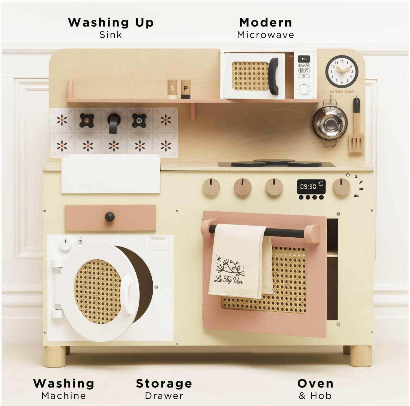
Figure 3: Key Features of the Play Kitchen