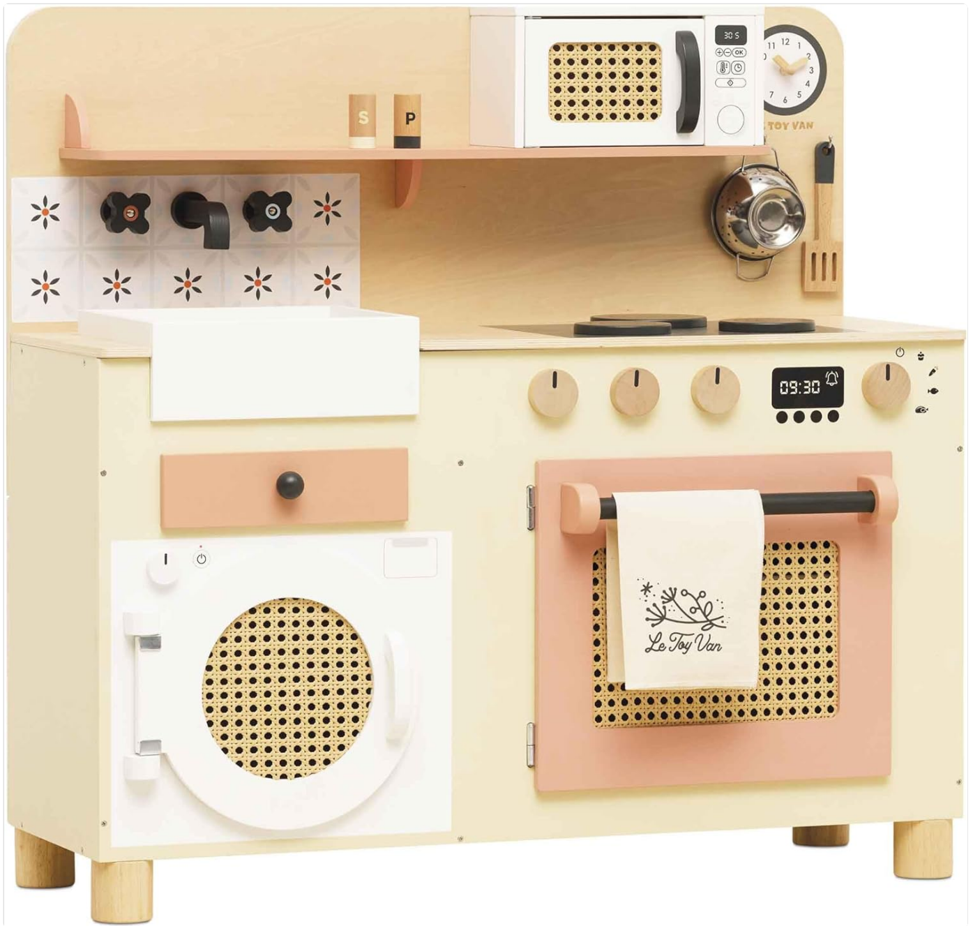
Figure 2: Assembled Kitchen Unit

Note: Some users have reported challenges with identifying parts due to labeling. We recommend carefully matching each piece to the diagrams in the assembly guide before beginning.