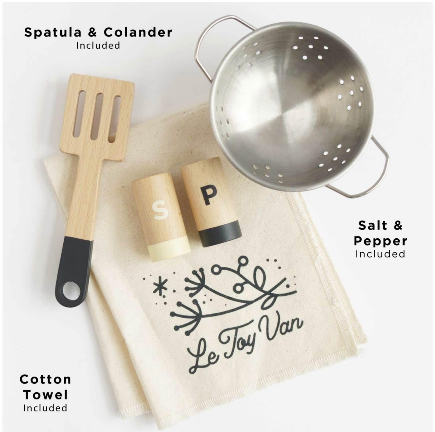
Figure 1: Included Accessories