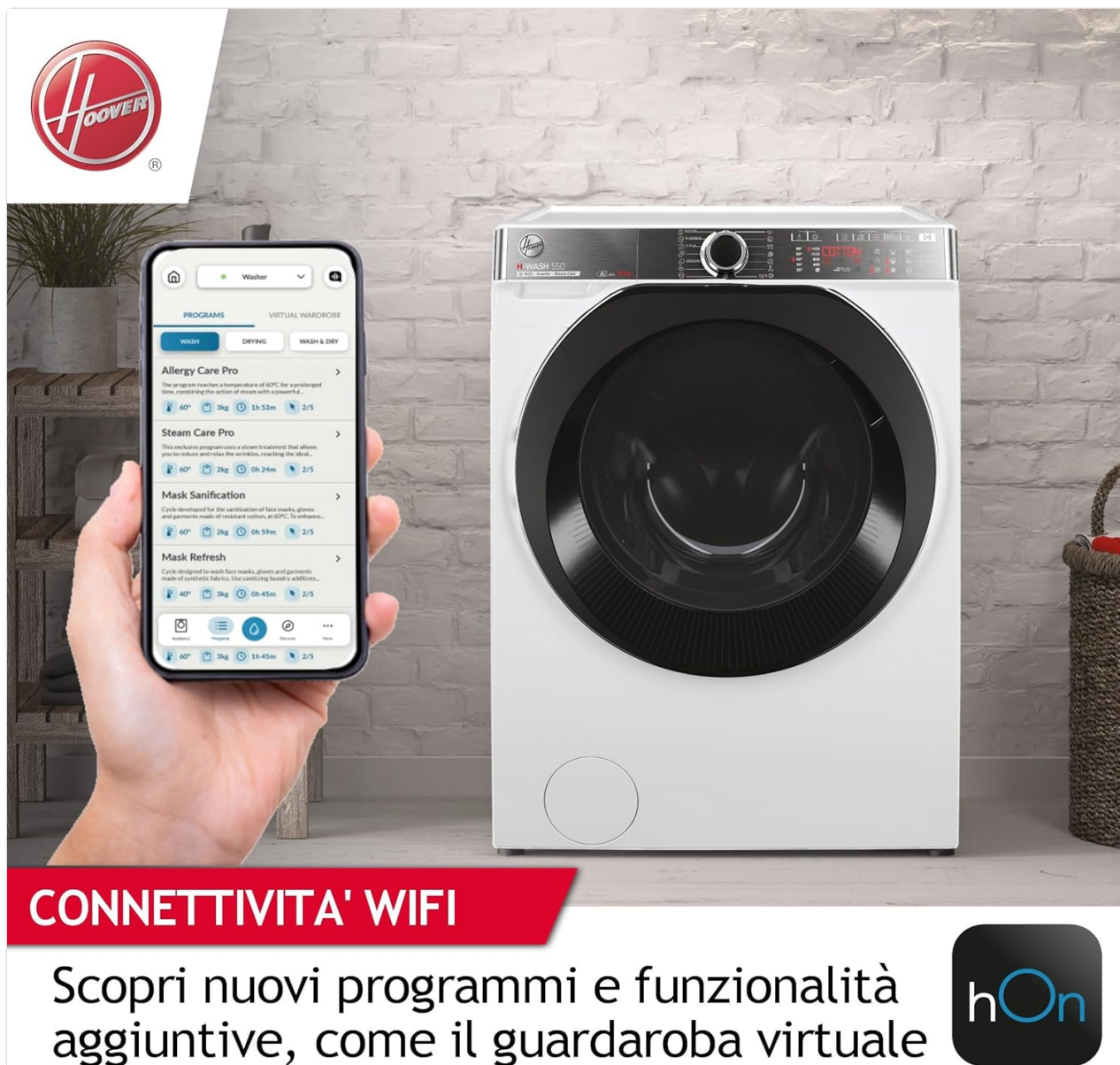
Image 3.2: The Hoover H-WASH 550 washing machine demonstrating its Wi-Fi connectivity with the HOn app, allowing remote control and access to additional features.