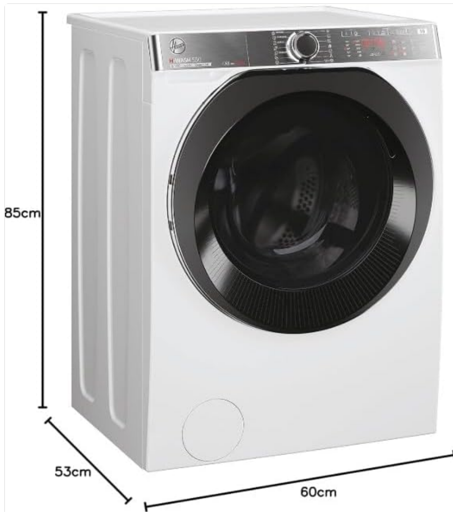
Image 3.4: The washing machine drum showcasing the ECO-POWER Inverter and Power Care System, designed for efficient and effective washing.