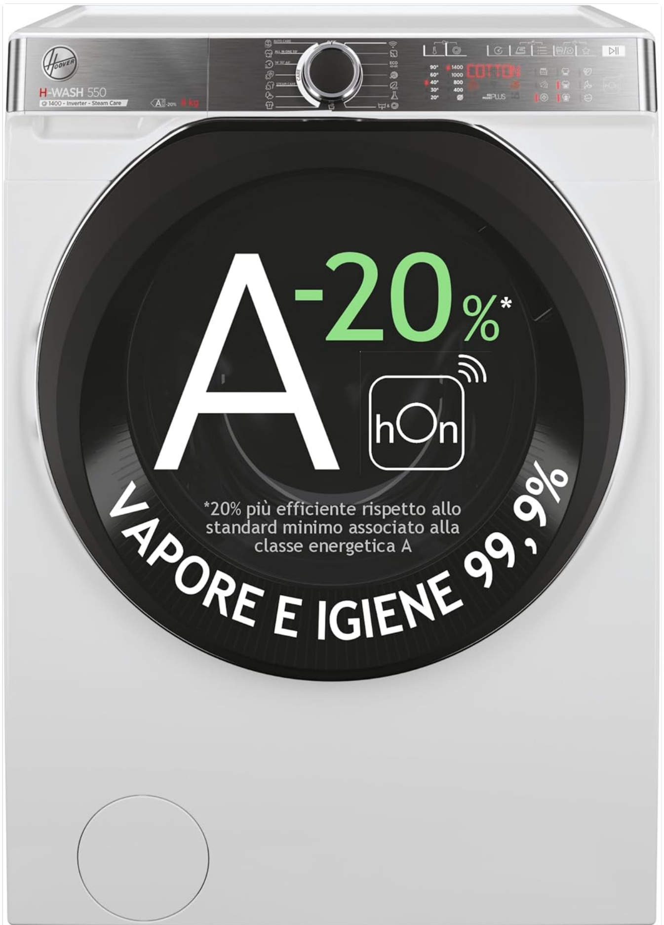
Image 1.1: Front view of the Hoover H-WASH 550 washing machine, highlighting its A-20% energy efficiency and HOn connectivity.