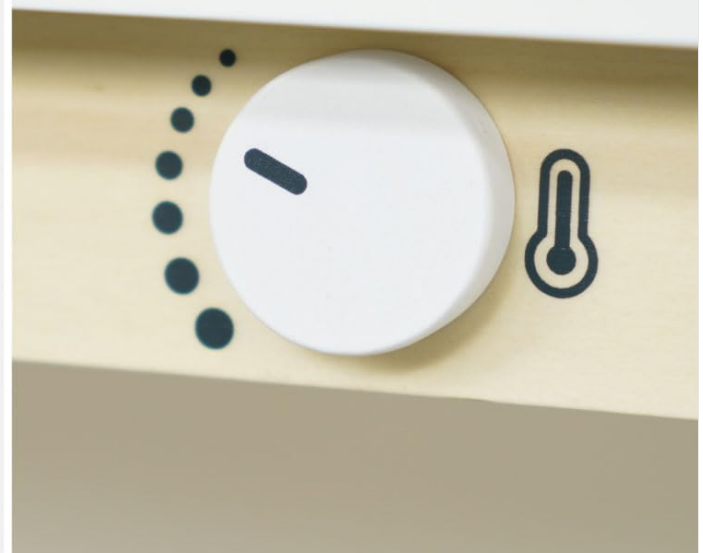
Image: Detailed view of the fridge freezer's interactive features.

Your browser does not support the video tag.