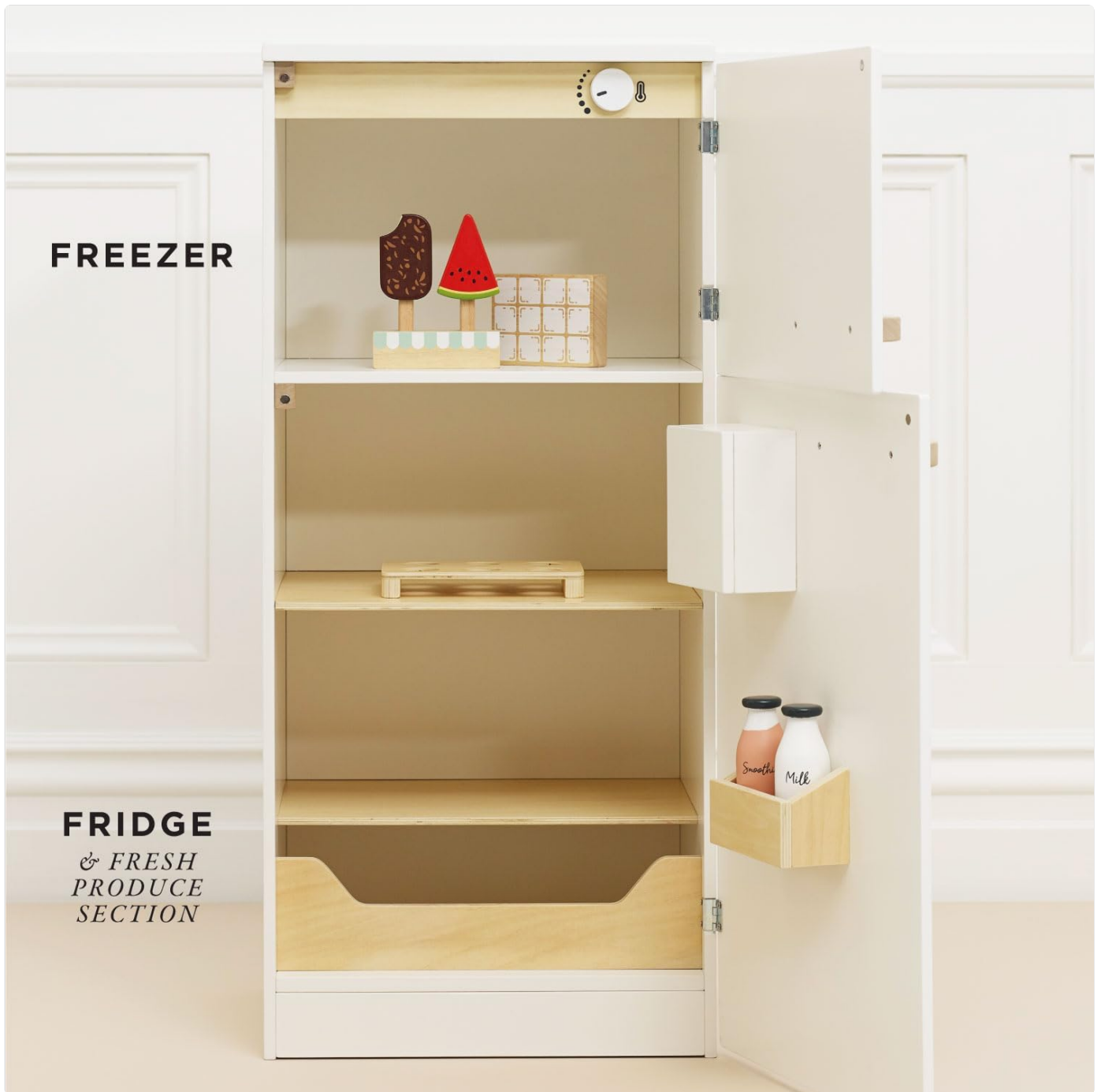
Image: Interior view of the Wooden Fridge Freezer with doors open.