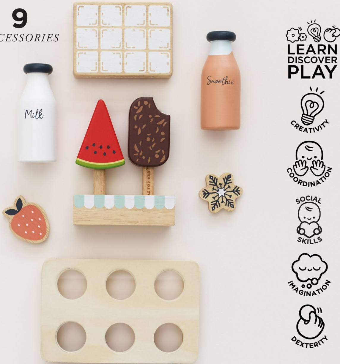
Image: Included accessories for the Le Toy Van Wooden Fridge Freezer Set.