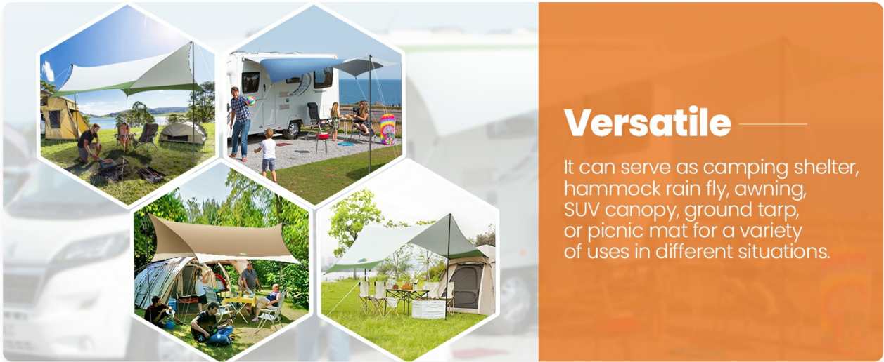
Image 4.1: Examples of the tarp's versatile applications in different outdoor settings.

For optimal performance, especially in windy conditions, ensure all anchor points are securely fastened and guylines are properly tensioned. While the tarp is waterproof, it is recommended to set it up in a wind-sheltered area when possible to maximize stability and longevity.