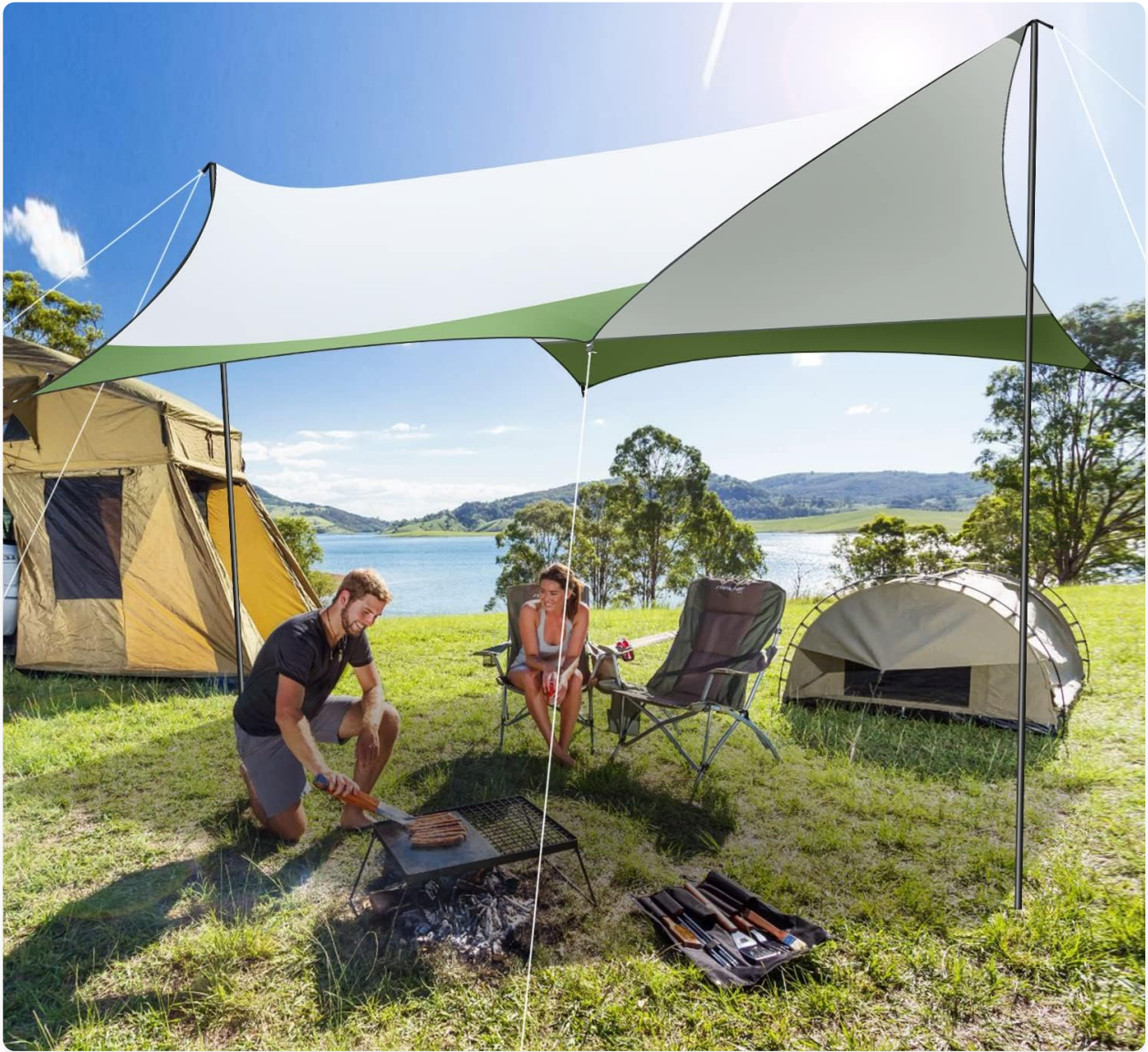
Image 1.1: The HOTEEL Camping Tarp Rain Fly providing shelter in an outdoor setting.