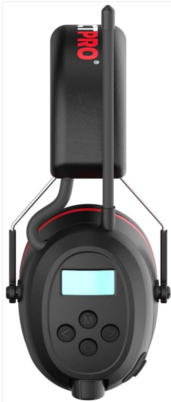
Figure 3.2: This image provides a close-up front view of the right earcup's control panel on the PerfectPro H-40 headphones. It features a digital display, power button, mode button, and navigation buttons for tuning or track control.