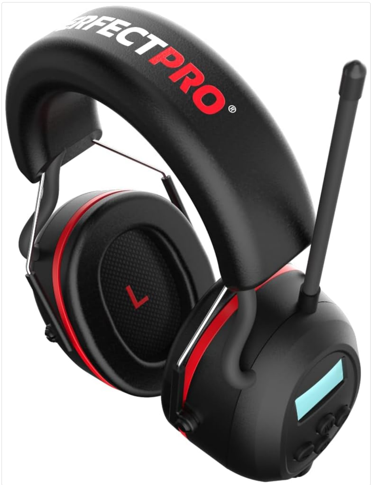
Figure 3.1: This image displays the PerfectPro H-40 EarProtection headphones in black with red accents, viewed from an angle. The right earcup shows the control panel with a small display and buttons, along with the extendable antenna.