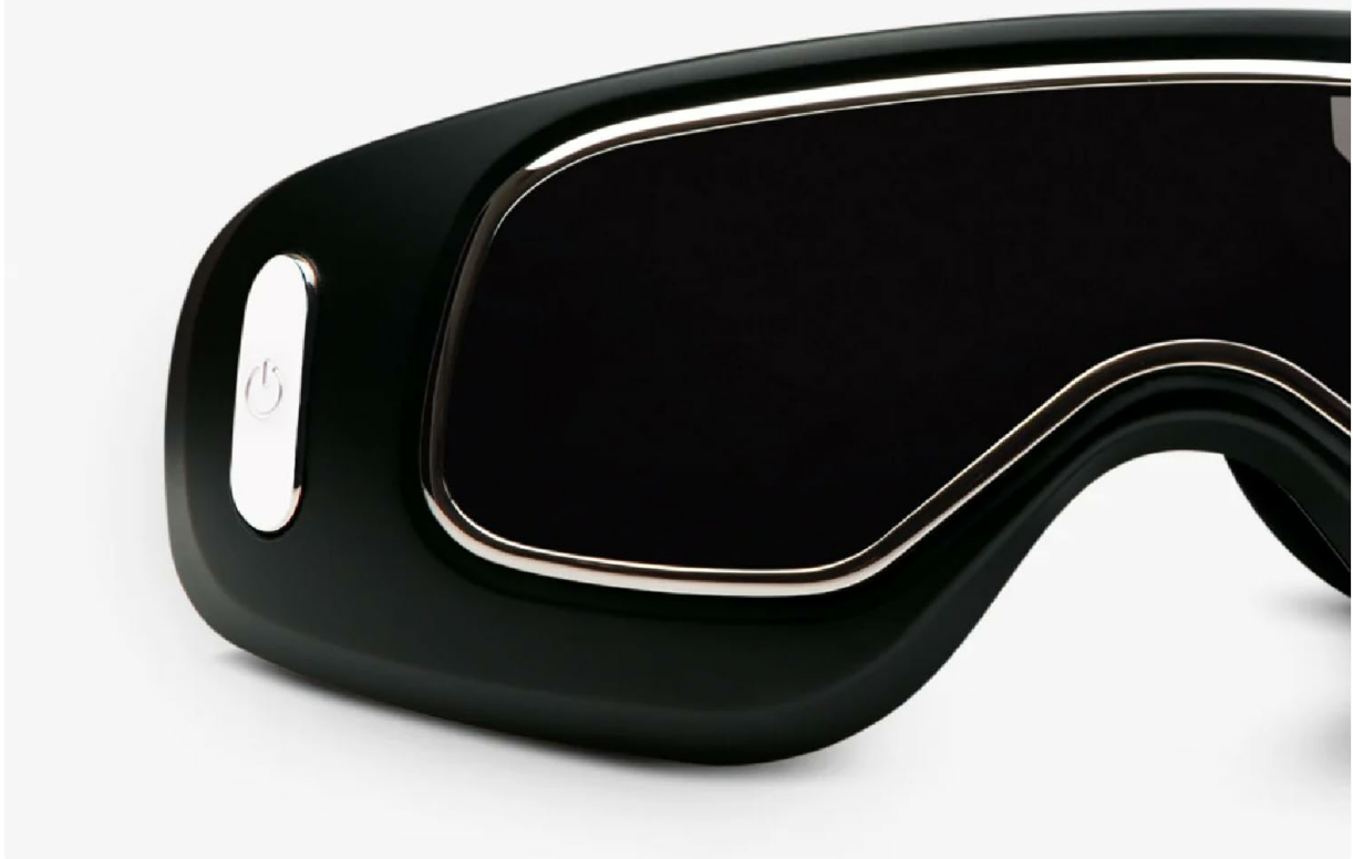
Image 3.2: Detail of the one-touch button on the side of the massager, indicating its simple control interface.

You can simply switch on and toggle between the different massage programs with just one button.