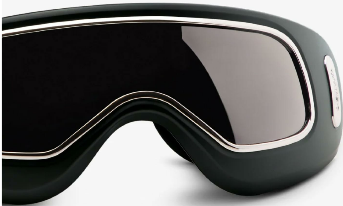
Image 3.1: Close-up view of the see-through lens on the OSIM uVision 3 Eye Massager. This feature allows users to maintain some visibility during use.

Equipped with see-through lens, you can go on with your daily activities while relaxing your eyes.