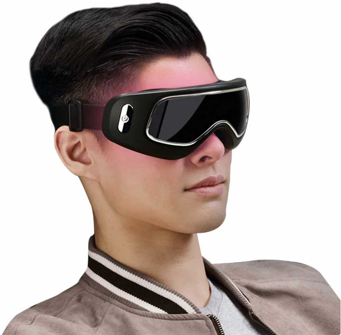
Image 1.1: A person wearing the OSIM uVision 3 Eye Massager. This image illustrates the product in use, highlighting its design and how it covers the eye area.