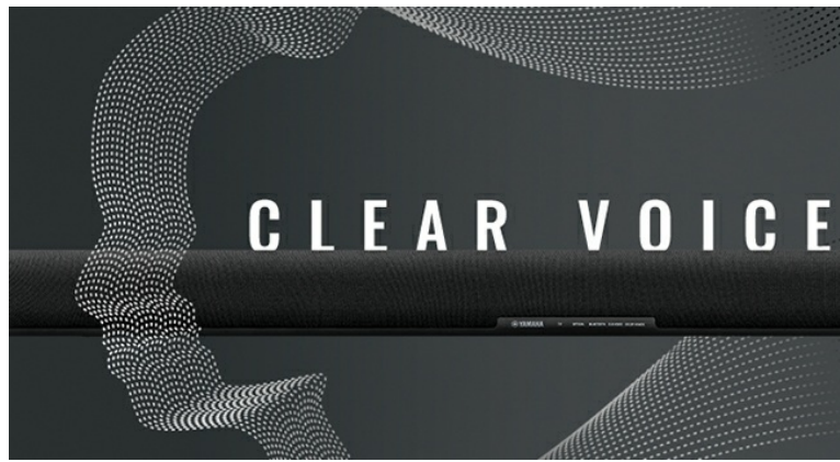
Illustration of the Clear Voice feature, designed to enhance dialogue clarity.