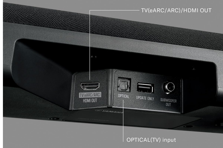
Detailed view of the HDMI eARC/ARC and Optical input ports on the sound bar's rear panel.