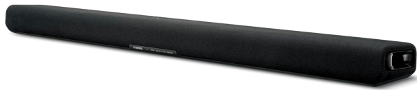
Angled front view of the Yamaha SR-B30A Sound Bar, showcasing its sleek black design.