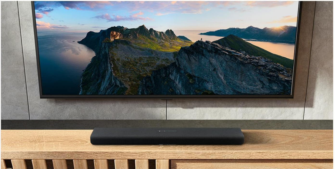
Figure 3: Sound Bar Tabletop Placement

Place the sound bar centrally below your TV. Ensure there are no obstructions in front of the sound bar that could block the sound.