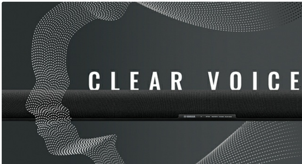
Figure 10: Clear Voice Feature

This animated graphic visually represents the Clear Voice feature of the YAMAHA SR-B40A sound bar, showing sound waves emanating from the bar with the text 'CLEAR VOICE' prominently displayed, indicating enhanced dialogue clarity.