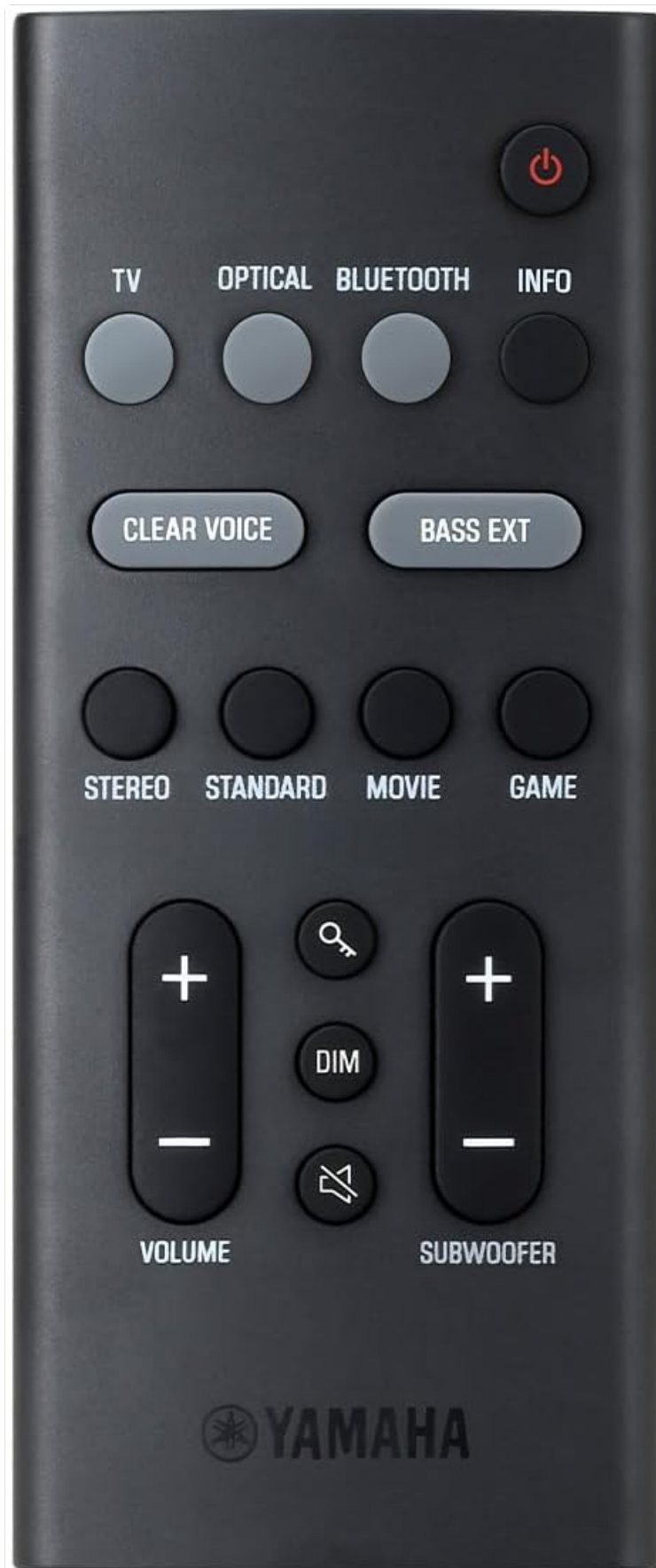
Figure 7: Remote Control

This image displays the dedicated remote control for the YAMAHA SR-B40A sound bar, featuring clearly labeled buttons for power, input selection (TV, Optical, Bluetooth), sound enhancements (Clear Voice, Bass EXT), sound modes (Stereo, Standard, Movie, Game), volume control, subwoofer level adjustment, and display dimming.