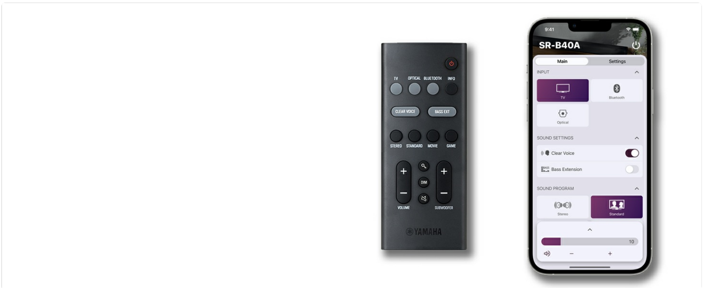
Figure 11: Remote Control and App Interface

This image showcases both the physical remote control and the digital interface of the YAMAHA SR-B40A's smartphone application, demonstrating the dual control options available to users for managing sound bar settings and inputs.