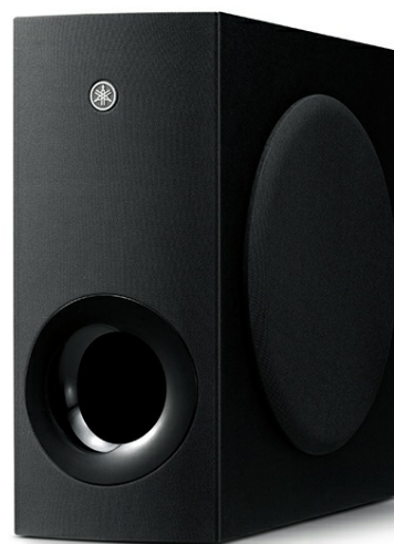
Figure 5: Wireless Subwoofer Unit

The wireless subwoofer can be placed anywhere in the room, ideally within 10 meters (33 feet) of the sound bar. Experiment with different locations to find the best bass response for your listening environment.