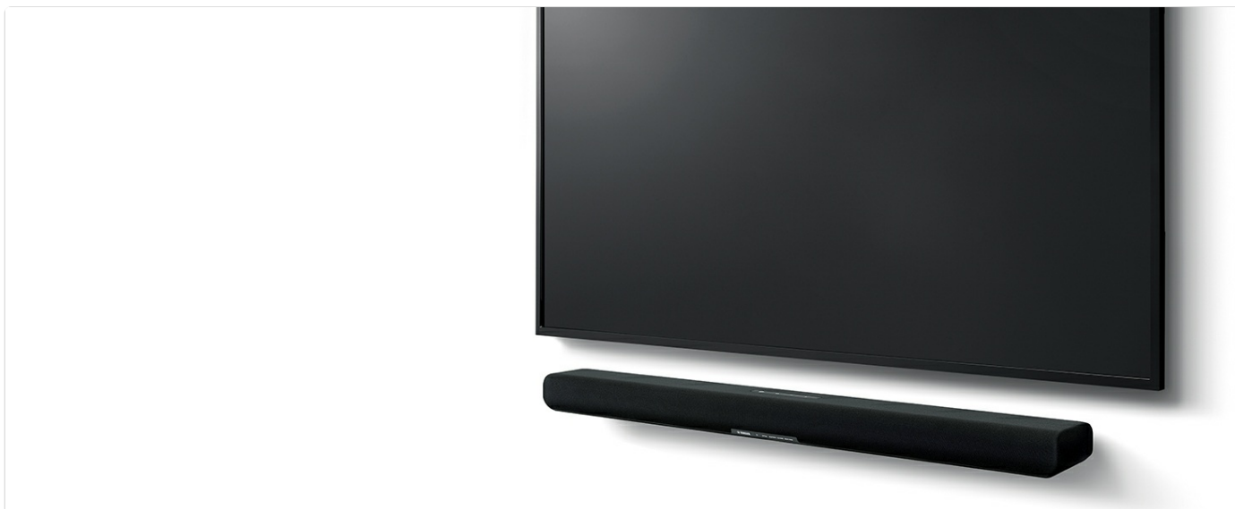
Figure 4: Sound Bar Wall-Mounted Placement

This image depicts the YAMAHA SR-B40A sound bar securely wall-mounted directly below a television, showcasing an alternative installation method that saves space and provides a clean, integrated look.