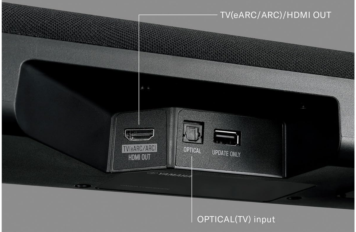
Figure 6: Sound Bar Connectivity Ports

This close-up image displays the rear connectivity panel of the YAMAHA SR-B40A sound bar, clearly showing the HDMI OUT (eARC/ARC) port and the OPTICAL (TV) input, along with a USB port labeled 'UPDATE ONLY', indicating the available connection options for audio input and firmware updates.