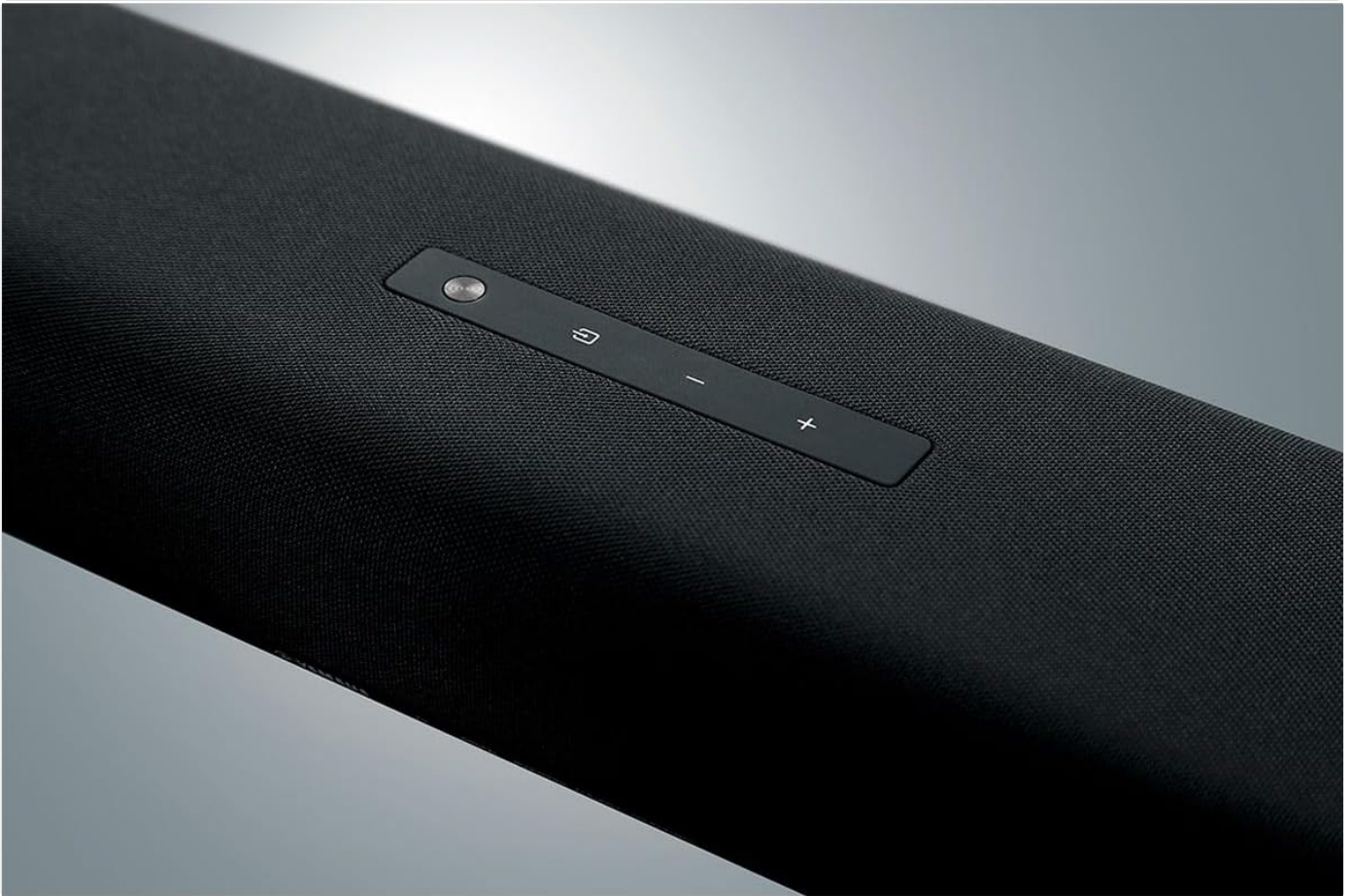
Figure 8: Sound Bar Top Panel Controls

This close-up image shows the minimalist control panel located on the top surface of the YAMAHA SR-B40A sound bar, featuring discreet buttons for power, input selection, and volume adjustment, designed for easy access and a clean aesthetic.