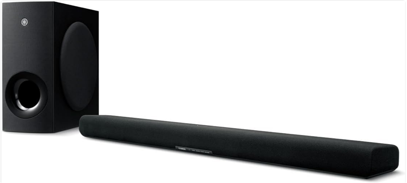
Figure 1: YAMAHA SR-B40A Sound Bar and Wireless Subwoofer

Thank you for purchasing the YAMAHA SR-B40A Dolby Atmos Sound Bar with Wireless Subwoofer. This system is designed to provide an immersive audio experience for your home entertainment. This manual provides detailed instructions for setup, operation, and maintenance to ensure optimal performance and longevity of your product. Please read this manual thoroughly before use and keep it for future reference.