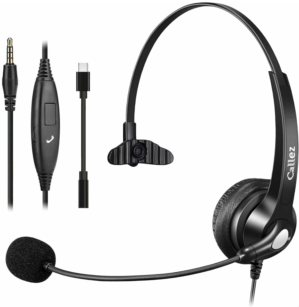
Image: Callez Y500E1 3.5mm Wired Headset, Gray-Monaural variant.