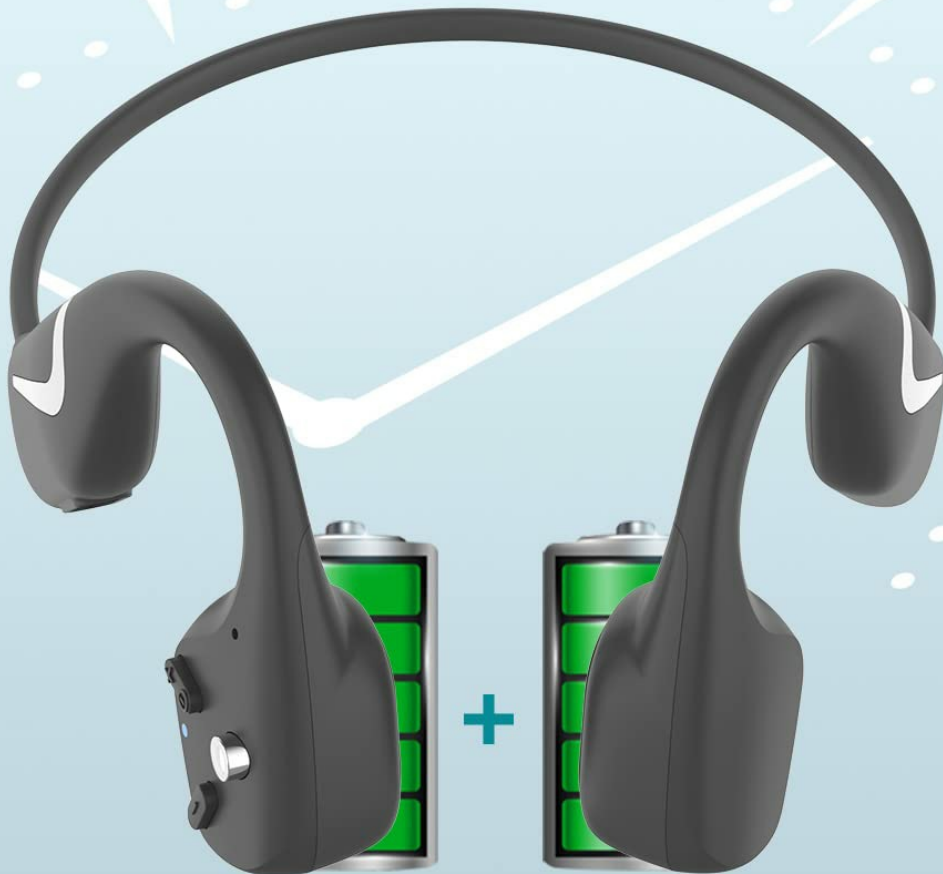
Image: An illustration highlighting the 500mAh battery capacity and 20 hours of playtime for the DV68 headset, featuring a dual battery design.