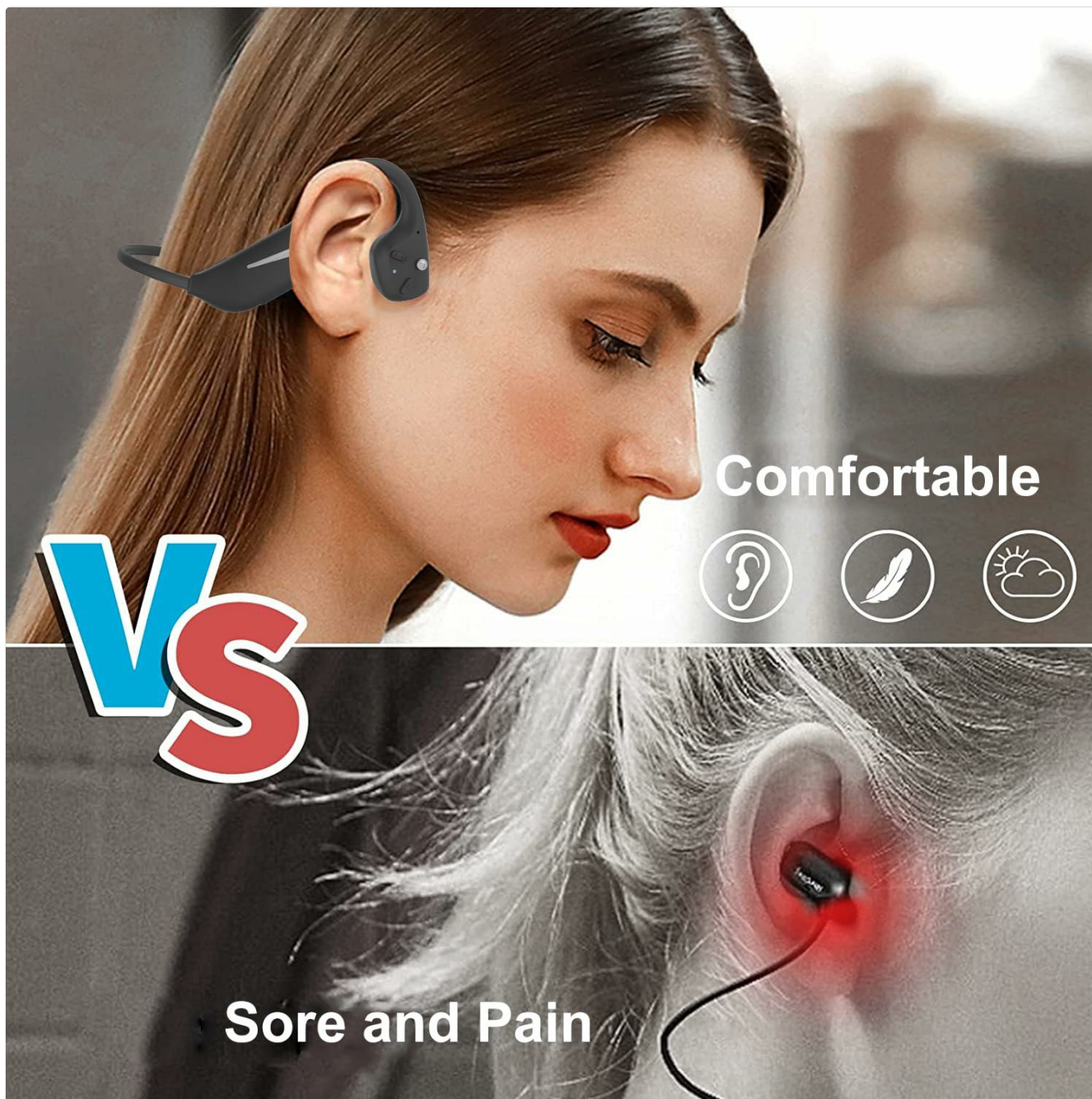
Image: A comparison showing the comfort of bone conduction headphones versus traditional in-ear headphones. The top image shows a person comfortably wearing the DV68 headset, while the bottom image depicts the potential discomfort of in-ear headphones.

band should go around the back of your head. The lightweight and streamlined design ensures a comfortable and stable fit for extended periods.