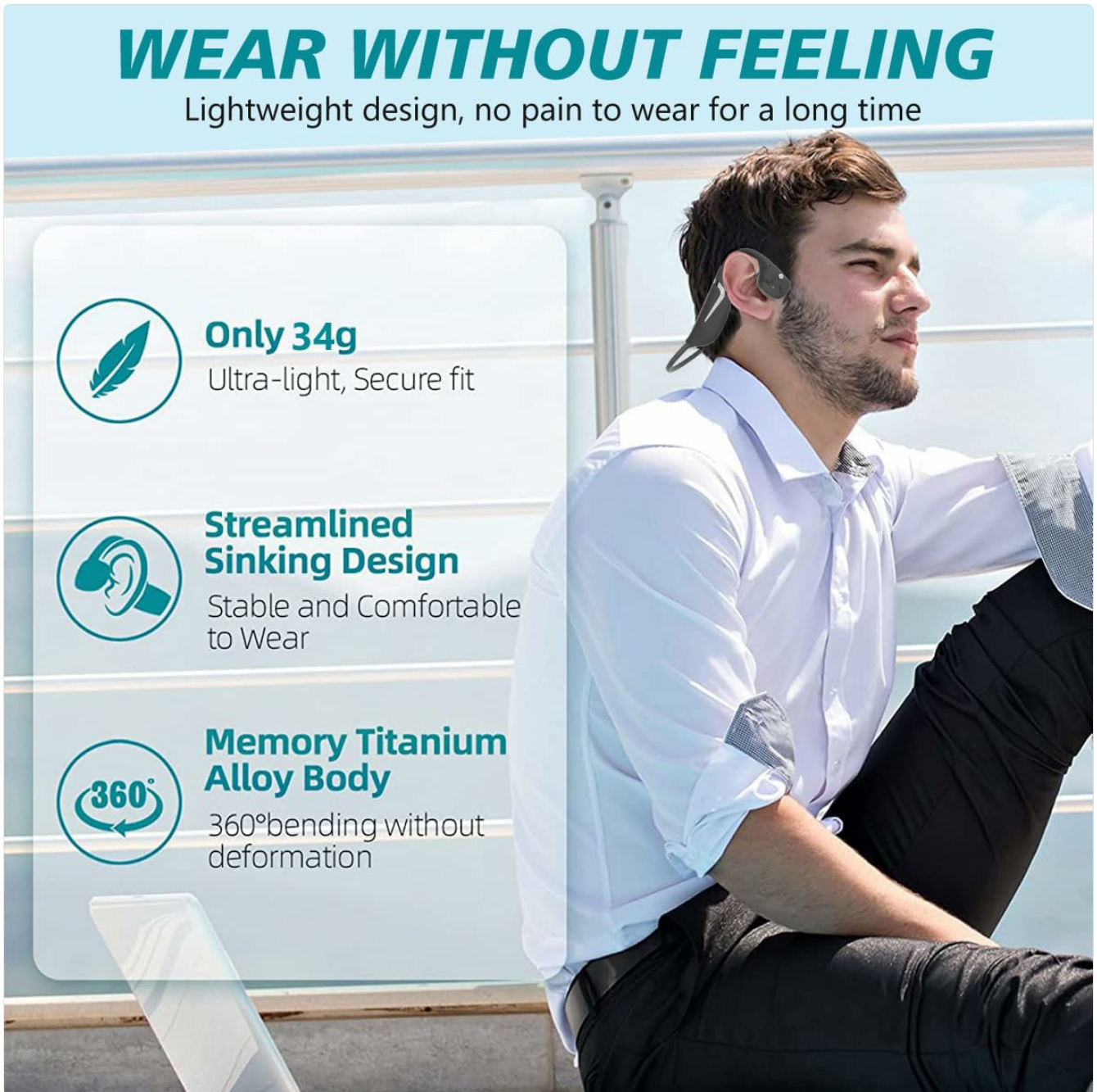
Image: An illustration highlighting the lightweight design and comfortable fit of the DV68 headset. It emphasizes features like ultra-light 34g weight, streamlined sinking design for stability, and a memory titanium alloy body that allows 360-degree bending without deformation.