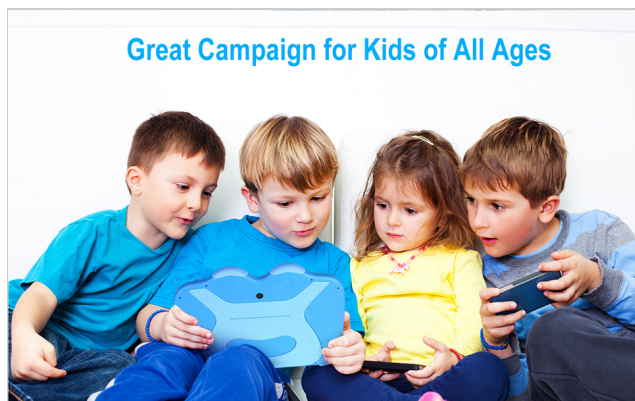
Figure 5: Kid-proof case with anti-drop and stand features.

The included kid-proof case is designed to protect the tablet from scratches, dust, bumps, and drops. The integrated bracket allows for hands-free viewing.