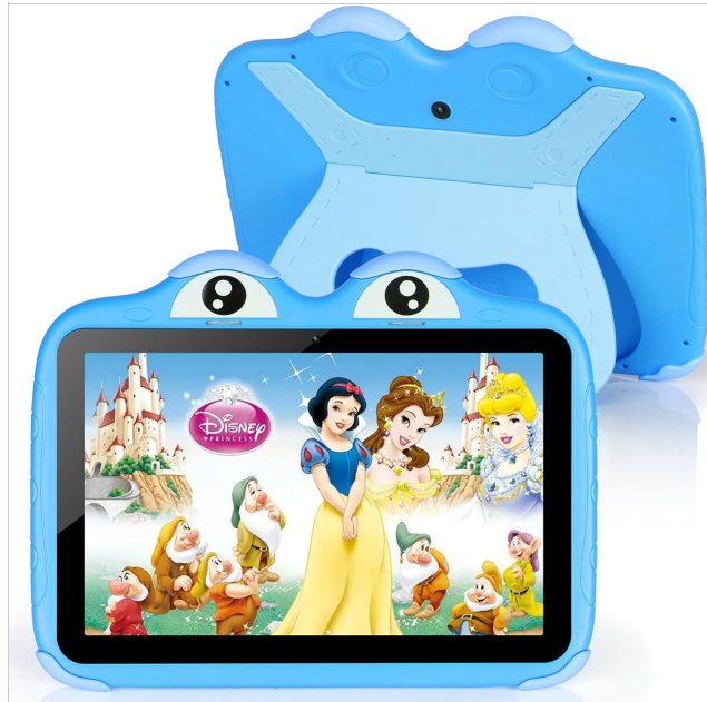
Figure 1: Front and Rear View of the Trayoo Kids Tablet in its protective case.

Refer to the images below for a visual guide to the tablet's components.