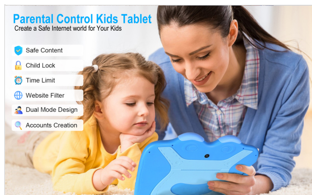
Figure 3: Parental Control interface for managing tablet usage.

Access Parental Control settings through the pre-installed iWAWA app or the tablet's main settings menu.